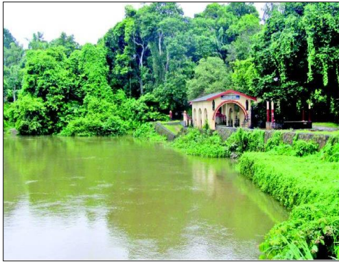
The dense greens spread of the Chammakavu grove

The blending of land, religion, myth, culture and civilization harmoniously together in a small space brimming with greenery, it is christened as Kavu . It is a natural space seen near traditional homes in Kerala. These small verdant patches, deemed sacred in the culture and tradition of Kerala and is home to