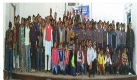
Involving Youth in Disaster Management: Meeting on Youth Centred Disaster Risk Reduction, January 9, 2016, Bihar, India

District Administration of Muzaffarpur District of Bihar with All India Disaster Mitigation Institute (AIDMI) organised a consultation with 115 youths of Muzaffarpur city on January 9, 2016. How to make Smart City, A Safe