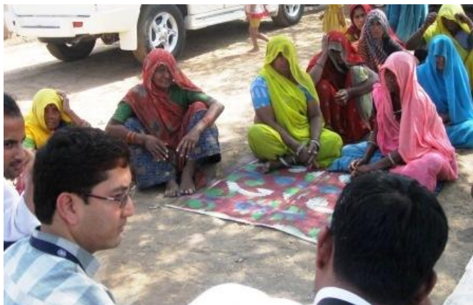
UNVPO interacting with a Women Self Help Group