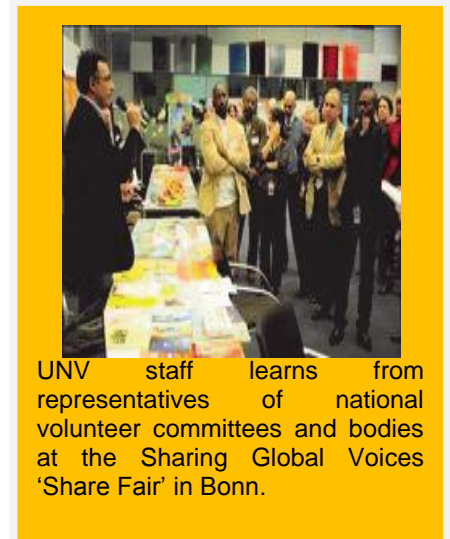
UNV staff learns from representatives of national volunteer committees and bodies at the Sharing Global Voices 'Share Fair' in Bonn.