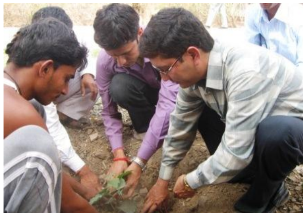
UNVPO planting a sapling at Ubdee in Khargaon