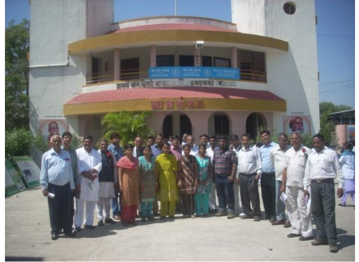
Community Volunteers from Hiwre-Bajar