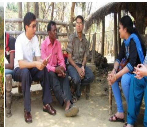
UNVPO in discussion with a Sarpanch at Korba