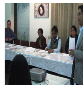
First IYV+10 Planning Meeting in progress

Along with the National Committee for IYV+10, four taskforces have also been formulated based on the four pillars of IYV+10: Recognition, Facilitation, Networking and Promotion.