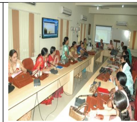
Elected Women Representatives discussing the importance of EWR Network