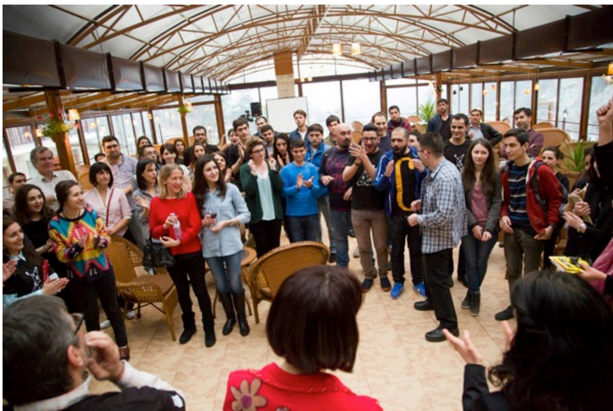
A social innovation lab in action in Yerevan

Thanks to a positive response by citizens and local officials, the Government of Armenia's Open Government Partnership National Action Plan 2014-2016 envisages bringing the tool to ten more communities. This success is a testament to rapid prototyping and continued iteration, building on feedback from national partners like Armenia's Ministry of Territorial Administration, local and regional authorities, and the International Centre for Human Development. It also builds upon a solid partnership with the private sector - from tech company Mobbis, which offered training to local government representatives on how to run SMS polls, to mobile operators Orange, Biline, and VivaCell MTS, who provided mobile connectivity.