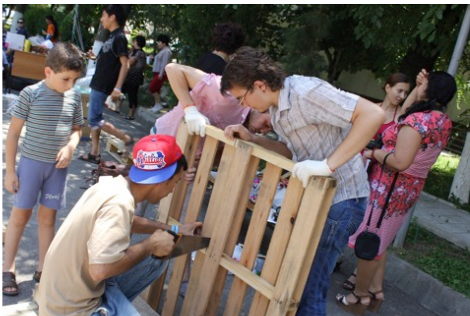
Uzbekistan gets into the “DIY” spirit

Using inexpensive DIY activity tools like used tires and garbage, volunteers in open space labs in Samarkand, Bukhara, Ferghana, Nukus and Tashkent work on a range of activities including creating playgrounds and restoring public buildings. The DIY approach also involves public-private-community partnerships. Companies can directly order hand-made crafts from DIY volunteers. Future plans include remaking unused public places into DIY parks where anyone can create and enjoy co-creation.