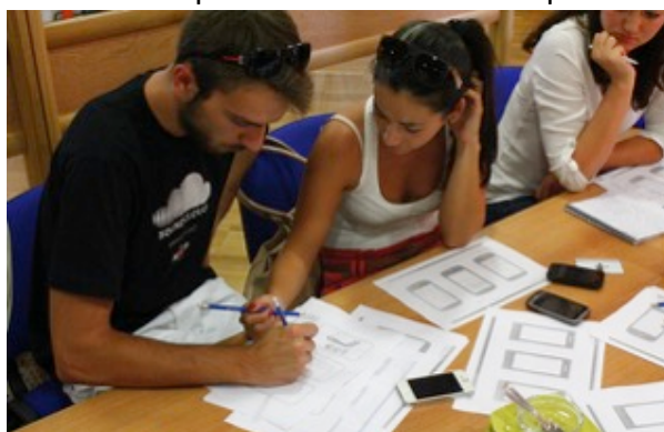
Thinking big, starting small in Skopje

Other social innovation hub achievements include the My Municipality development planning initiative; Skopje Green Routes travel planner, an SMS and Facebook application that is helping farmers reduce pollution, and PRV.mk , a website and mobile app informing young people about the latest available jobs.