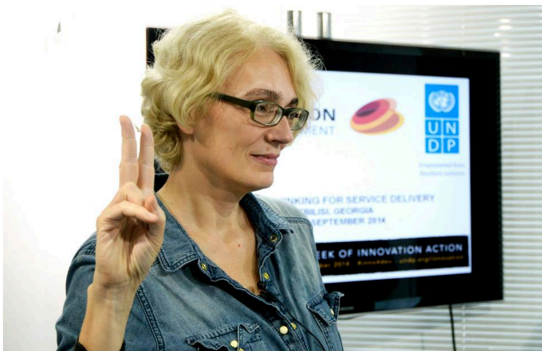
Co-designing new services in Georgia

The workshop included a step-by-step simulation of an emergency starting from the initial call to service delivery. After this, 112 rolled out new video and SMS services that were designed with those who would be using the services in the first place – people with disabilities. This made Georgia only the fourth country in Europe to have both services available to all citizens.