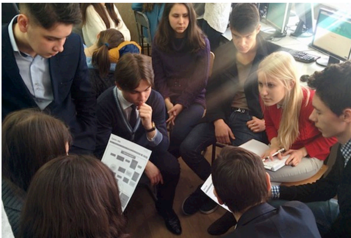
How does it look on paper? Prototyping a new platform

Field research indicated that users have found both services complicated, non-transparent, unfriendly and so time-consuming that it often takes two months to receive disbursement and 26 separate steps to access the service. Many give up.