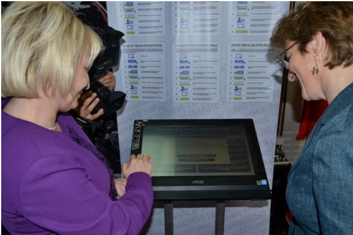
Inaugurating the My Municipality tool