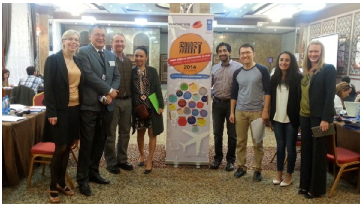
Kyrgyzstan makes the shift to micronarratives

While a majority said that they would prefer to work in Kyrgyzstan, the difficult economic situation saw many men saying they would leave and become economic migrants to support their families.