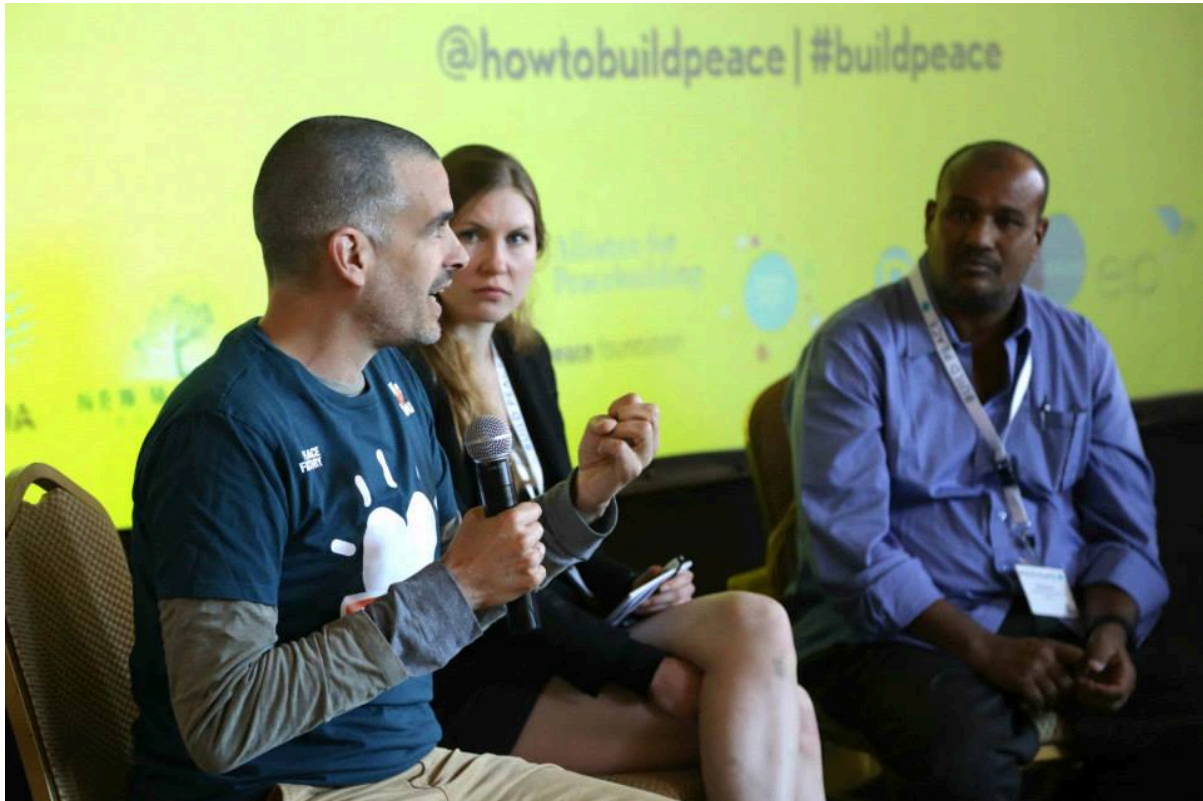
Peacebuilders and activists from around the world gather in Cyprus

The profound significance of the conference location was underlined by technologies that ignore physical boundaries to optimize opportunities for citizen-led peace making.