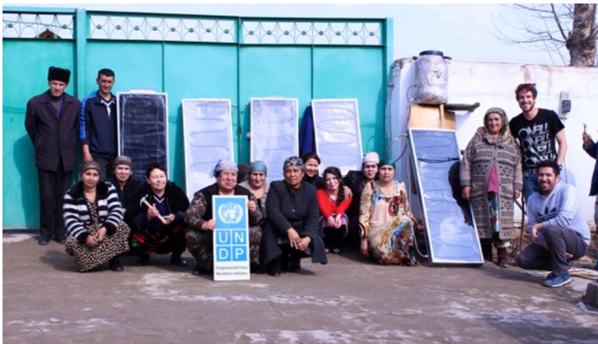
Empowering women in Tajikistan to become promoters of green energy