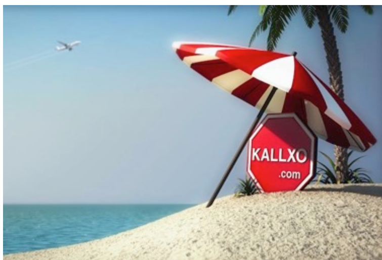
Corruption in Kosovo? Contat Kallxo

After the initial overwhelming response, and with support from the Swiss Agency for Development and Cooperation, the full platform was launched in late 2012, on a tri-lingual platform (Albanian, Serbian and English). It has had a powerful impact: over 5,000 citizen reports, 70,000 page views per month, more than 60,000 "likes" on Facebook, and over 400 articles and TV reports produced based on citizens' claims.