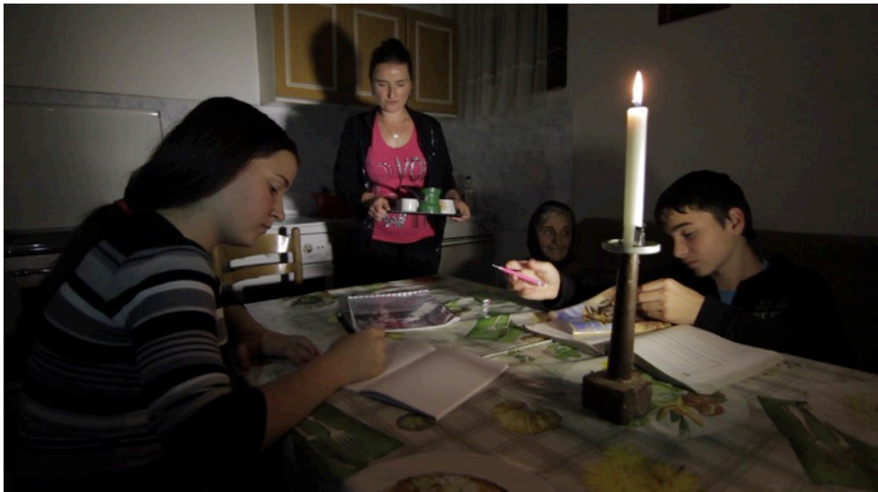
Learning by candlelight in Bosnia and Herzegovina: A new challenge is helping change that

Together with Nesta, a leading innovation consultancy NGO, UNDP in Bosnia and Herzegovina issued a global challenge seeking renewable energy solutions for war-returnee families living off the power grid in rural areas. The successful proposal had to cover the energy needs of an average family and cost only 5,000 euros. It also had to be flexible, reliable, easy to install, maintain and replicate, with good battery life and hot water capacity, and low maintenance costs.