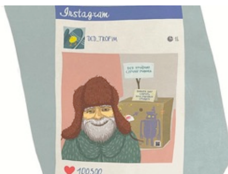
Meet Grandpa Trofim on Greenmap.by

On Greenmap.by, kids are asked to help Ded (Grandpa) Trofim, who lives an environmentally-friendly life in a small Belarusian village, collect caps from PET-bottles.