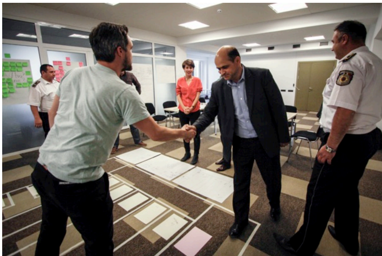
How do we make a police station more open? Codesigning in Moldova

The aim was to turn a community police station into a more effective, user-friendly workspace that would serve the community's needs effectively and in a collaborative manner.