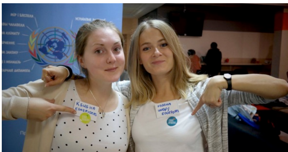
Young innovators in Minsk, Belarus

The hypothesis that innovation could help refresh governments' operating systems has proven true in a number of cases in the ECIS region. Innovation helped each government uncover new insights to reframe old problems and mobilize new expertise to shape fresh solutions. In each, innovation played a critical role in addressing major development challenges from youth employment, sustainable farming, and disaster management to promoting peace and reconciliation, and monitoring public services to fight corruption.