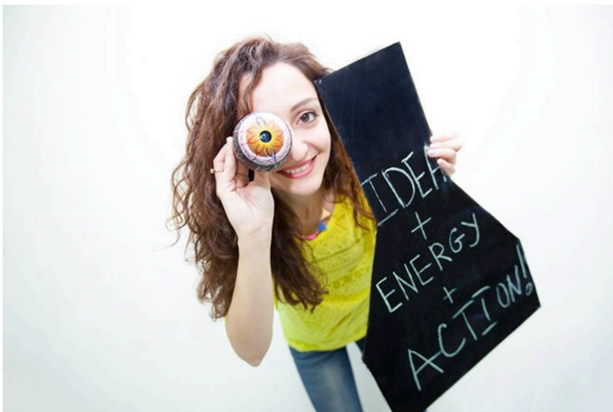
Innovation recipe for success in Armenia

UNDP's social innovations in Armenia have had a big impact, namely: