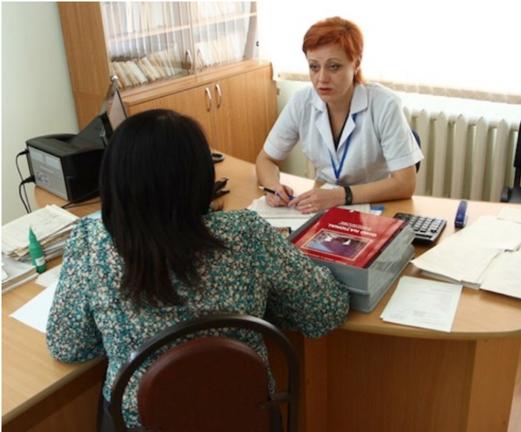
Experimenting with behavioural science in Moldova

Video observed treatment seemed a more effective and lower cost option; however, little reliable existing data existed to support this view. Furthermore, the reporting system was skewed with both doctors and patients incentivized to report high compliance. Getting accurate data to determine the best out-patient treatment option became the critical issue.