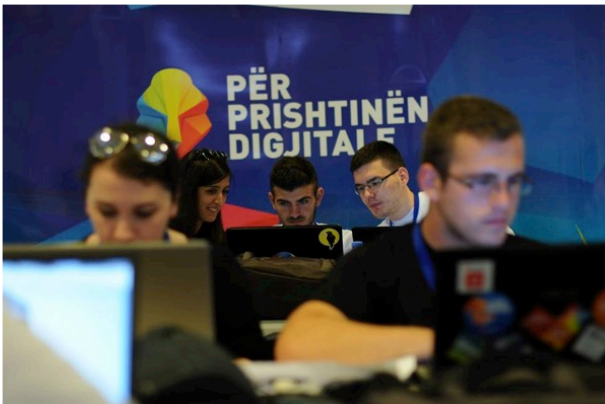
For digital Pristina: Digital capacity development in Kosovo

In October 2014, the city of Gjakova took a major step forward by releasing its 2011-2013 procurement data in machine-readable form to enable a more transparent view into the municipality's spending practices. The data formed the basis for e-prokurimi.org , an online platform that visualizes procurement data in a way that enables citizens to easily detect trends and patterns. Using an algorithm to auto-detect corruption red flags, e-prokurimi highlights suspicious tenders on the local level, and combines information on suppliers, city size, development priorities and contract size to support municipalities better allocate public finances.