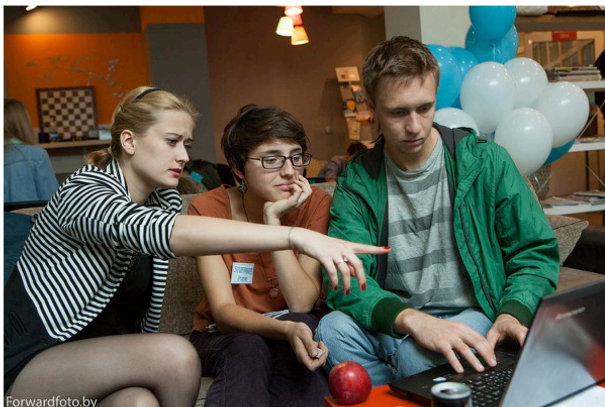
A hackathon for social good in Minsk, Belarus

In its search for innovative approaches to development programming, UNDP in Belarus launched its own social innovation lab. After a call for proposals solicited creative ideas from developers, photographers, designers, and e-marketing specialists, the social innovation lab organized a 36-hour hackathon, where participants were asked how technology could drive sustainable development in Belarus with innovative ways to: