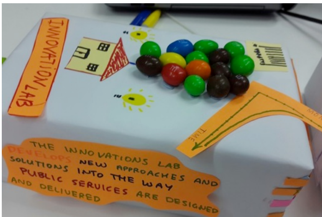
Georgia's innovation lab goes outside of the box for new solutions

Inspired by the UK's experience in government-driven service design innovations, PSDA Lab staff is trained in design thinking and behavioural science approaches to service development needs and draws on the international expertise of the Nesta, FutureGov, and BIT.