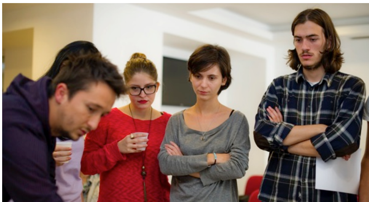
Training young designers on infographic creation in Prizren

In Kosovo, the overall unemployment rate is 35.1 percent, and eight out of ten people under 25 cannot find a job. While there is no shortage of diagnoses of the problem from international experts, and institutions and think tanks in Kosovo, there is a lack of efforts to understand youth insights and perceptions. UNDP turned to the collaborative foresight methodology FutureScaper to get young people's perspective. The aim was to then use those insights to deconstruct cultural, structural and other elements that may contribute to youth unemployment.