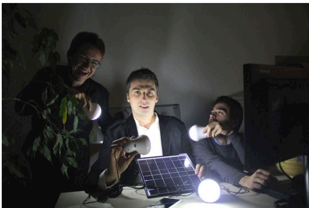
Testing solar lighting for a project in Tajikistan

Successful local implementation of the new goals and targets in the post-2015 agenda will require embracing innovation and its faster, more agile, participatory, and experimental approaches. Working together with citizens and partners, UNDP can deploy innovation to address some of the most ambitious and interlinked challenges in the new SDG agenda.