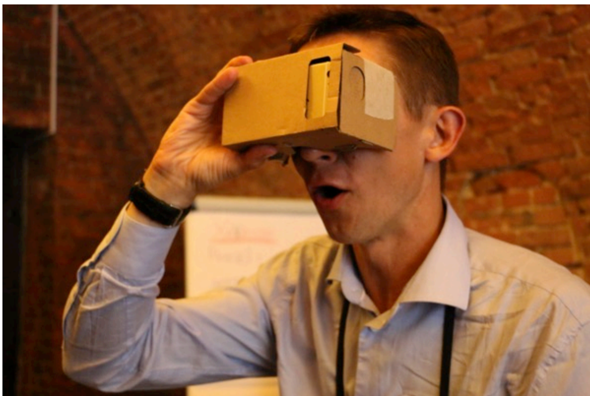
Hackathons in Belarus (UNDP in Belarus)