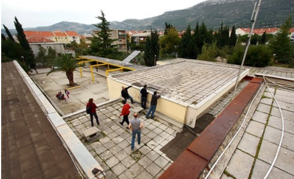
A primary school in Ostrog, Croatia gets outfitted with solar panels

UNDP is currently negotiating with international donors and the government to extend the project to cover more beneficiaries with this initiative. UNDP will install more renewable energy kits in Veliko Ocijevo, making it the first village in Bosnia and Herzegovina completely running on renewable energy - solar for electricity and domestic hot water and biomass for heating.