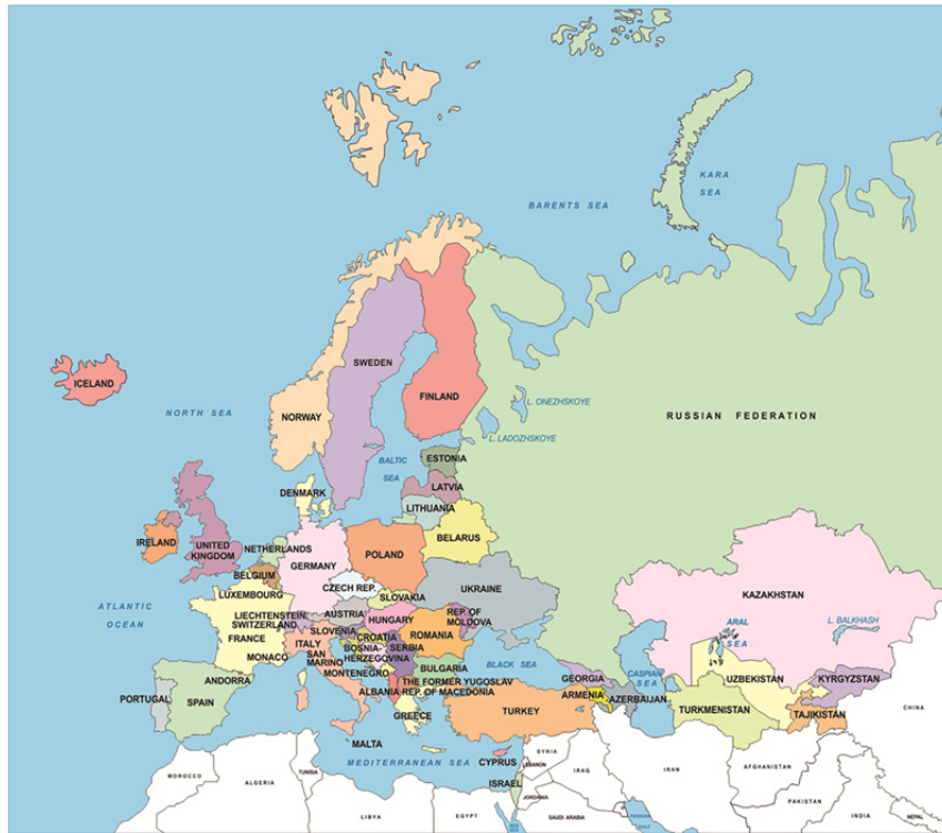
Map: Europe and Central Asia 20

Highly diverse, the region of Europe and Central Asia 19 includes high-income economies of Western Europe; high- and middle-income countries from Central Europe which have joined the European Union (EU); middle-income countries of