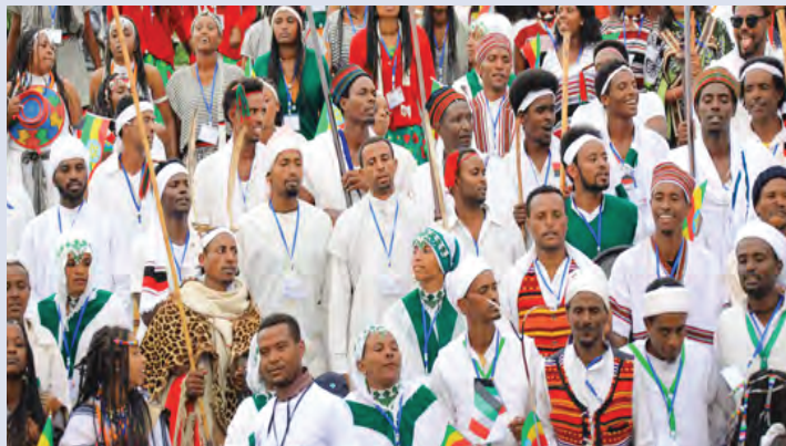
On 8th December every year, Ethiopia celebrate Nation, Nationalities and People's Day to strengthen ties and promote respect for diversity

Through its intervention, the programme contributes to the below 5 outcome areas: