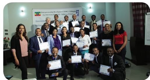
Graduation ceremony of the National Master Trainers by UNCTAD & UNDP

Canada's support has enabled the programme to expand its delivery of entrepreneurship training and business advisory services to women and youth. A new partnership with Microsoft East Africa was made to enable 200,000 aspiring and existing entrepreneurs access mentorship opportunities on strategy and marketing as well as free software and tools. Those deemed to be the best innovators by the programme will also be nominated for the 4Afrika Innovation Grant Award.