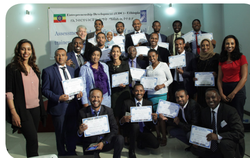
Graduation ceremony of the National Master Trainers by UNCTAD & UNDP

keen on getting their startups off the ground can sign up to get a business advisor assigned to them for a period of six to nine months respectively.