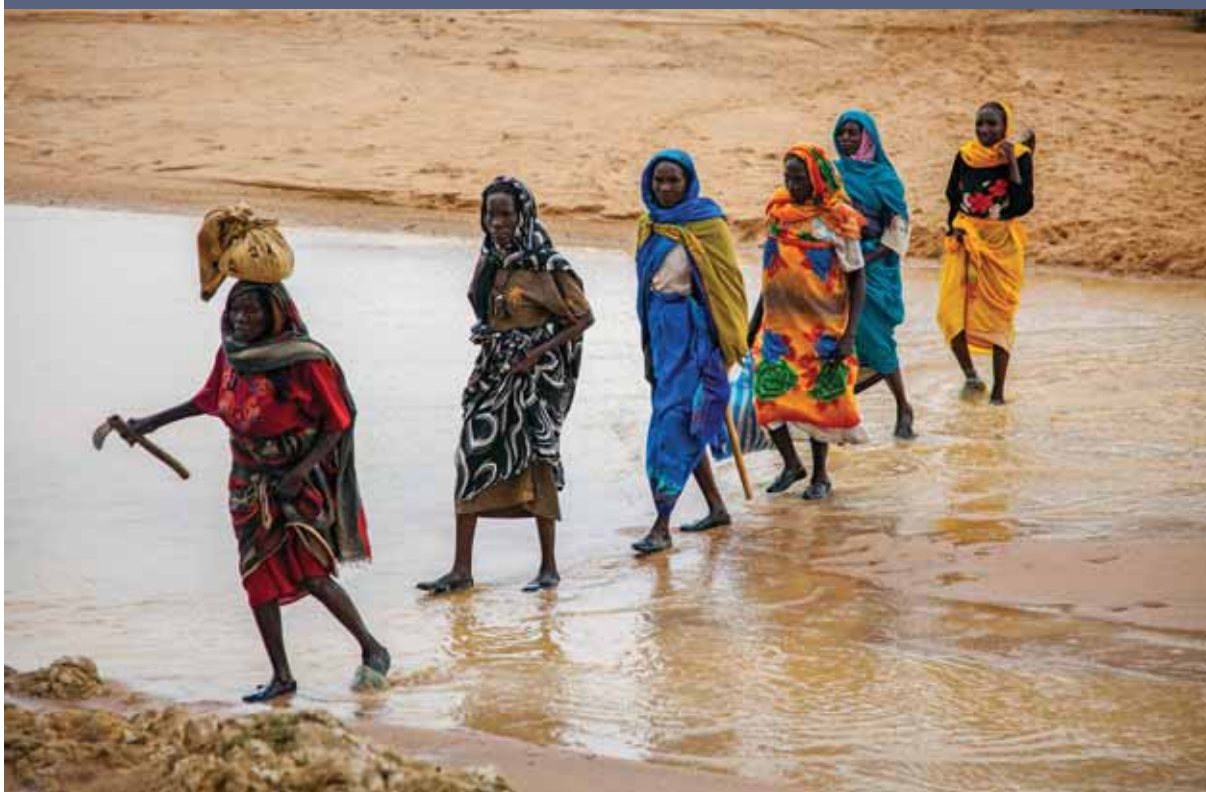
Sudanese women from Kassab IDP Camp in Kutum, North Darfur, venture out to collect firewood. Due to their traditional roles in collecting natural resources for household use, women IDPs are often at risk of sexual and gender-based violence perpetrated by armed groups or criminals

International organizations, UN entities and governments can also work to reduce the risk of sexual violence during these daily activities by promoting more efficient technologies and supporting sustainable livelihoods. In this respect, UNAMID is supporting a water project in eight villages of North Darfur, 169 in which 30,000 rolling water containers with a capacity of 75 liters each have been distributed to women in the communities. 170 While the project is principally focused on facilitating female residents' access to water, such technologies can help minimize the time women spend fetching water, thereby limiting their exposure to potential attacks. Other examples include the introduction of fuel-efficient cook stoves: the Rwandan contingent of UNAMID's predecessor, the African Union Mission in Sudan (AMIS), worked with local women in Darfur to build fuel-efficient clay stoves ( rondrezas ) traditionally used in Rwanda, which reduced the need for fire wood by up to 80 per cent. 171