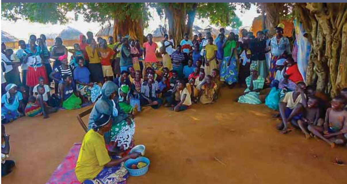
A sizeable crowd gathers to discuss women's land rights in Parwech, northern Uganda. Despite being responsible for growing 80 per cent of all food crops, only seven per cent of women in Uganda actually own land

Uganda has progressive constitutional and legal frameworks regarding gender. When it comes to women's land rights, however, both implementation and enforcement mechanisms are lacking. As a result, customs and practices that block women from exercising their land rights continue to prevail. One of the most significant issues in this regard is the inconsistent application of both customary and statutory laws protecting land rights. Competing land claims in the country are often linked to the multiplicity of land tenure systems – a legacy of colonialism that has been exacerbated by conflict.