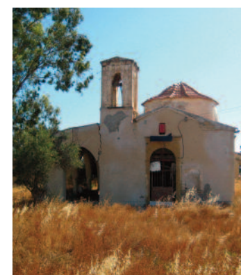
Trachoni / Demirhan Panagia Church