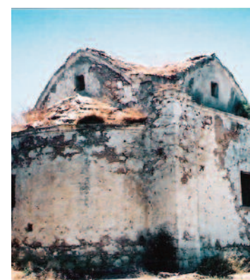
Philia / Serhatköy Profitis Elias Church