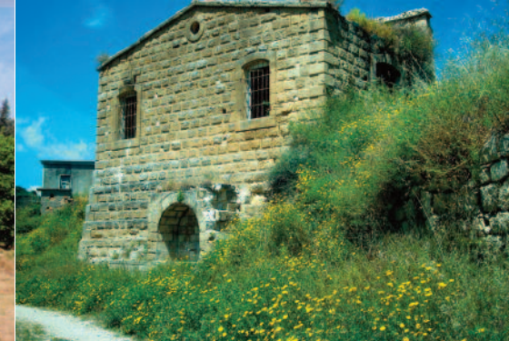
Evretu / Dereboyu Mosque