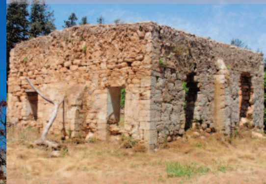
Çerkez Mosque – Phasouri / Çerkez Çiftliği

Education is central to the mission of the Committee. The Committee actively works to create an educational interactive programme that gives the opportunity to the younger generation of Turkish Cypriots and Greek Cypriots to learn about each other and the cultural heritage of the island.