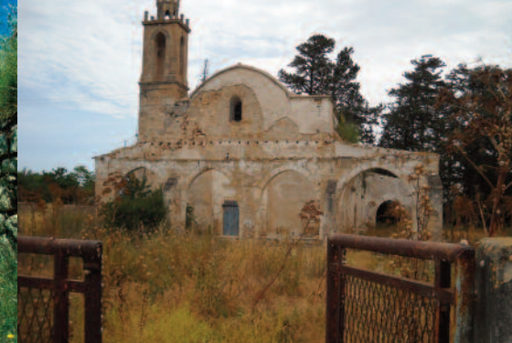
Komi Kebir / Büyükkonuk Agios Afksentios Church