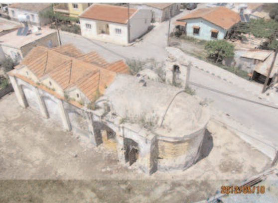
Syrianochori / Yayla Agios Nicolaos Church

The members of the Technical Committee wish to acknowledge the support and facilitation provided to their work by the Office and the staff of the Special Representative of the Secretary-General on Cyprus.