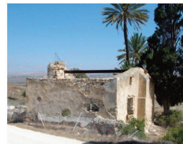
Denia / Denya Mosque