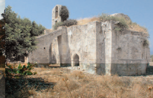
Kalograia / Esentepe Melandrina Church