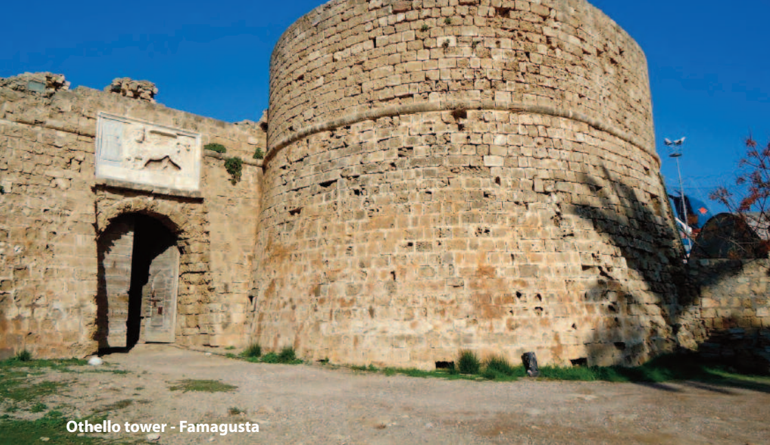
Othello tower - Famagusta

Established in April 2008, the Technical Committee on Cultural Heritage is dedicated to recognize and protect the rich and diverse cultural heritage of the island.