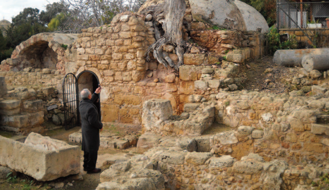
Kato Paphos / Aşağı Baf Batha

restoration of the Apostolos Andreas monastery in Karpaz/Karpasia having the support of all interested parties in accordance with internationally recognized modalities and regulations.