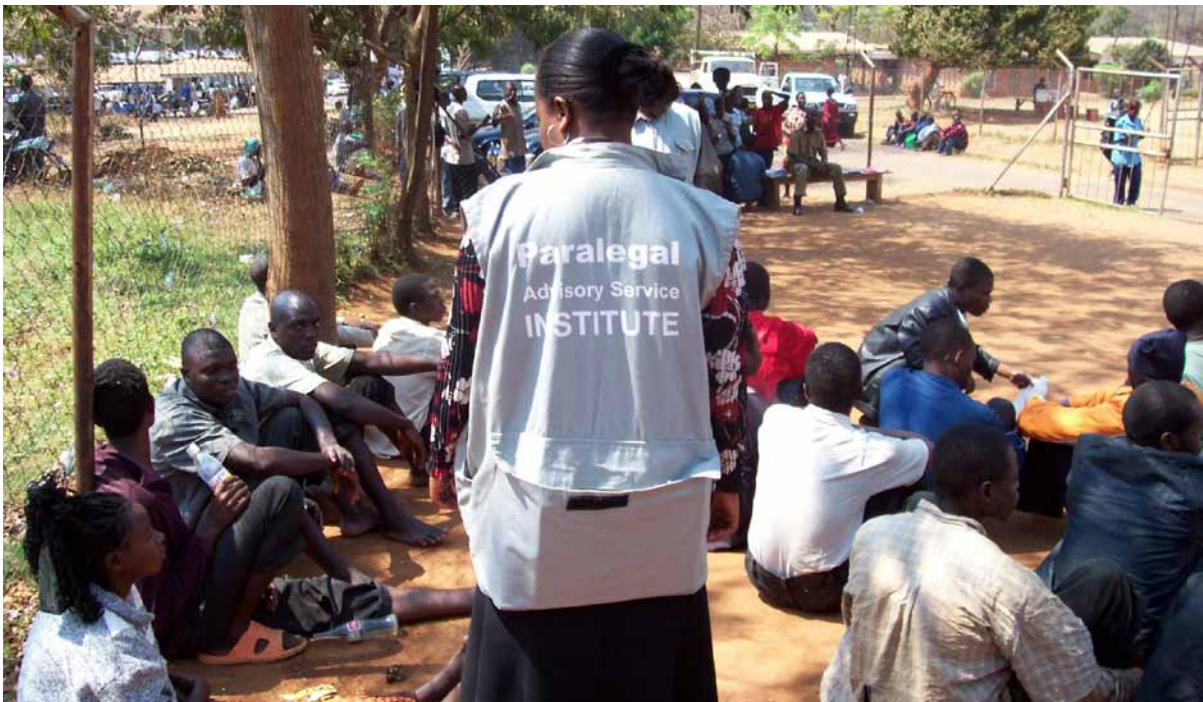
A paralegal providing legal advice and assistance at a Magistrates Court.