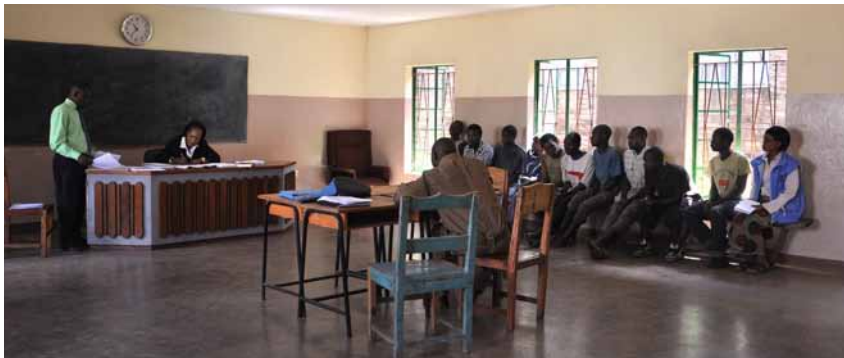
Paralegal Advisory Services Institute on Camp Court facilitated by PASI in progress