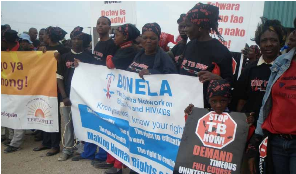
BONELA raises awareness and understanding around HIV issues also through public campaigns and forums.