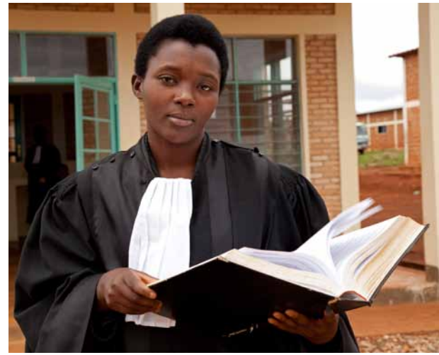
Burundi. A lady judge in Burundi stands outside the courthouse where she presides over cases.

Establishing formal linkages between reforms in the alternative justice mechanisms and the formal justice system can broaden opportunities for citizens to address their grievances. Lessons from various initiatives 54 indicate that even where innovations in the alternative justice system are relatively successful, the absence of systematic connections to the formal structures is likely to limit the effectiveness of such reforms.