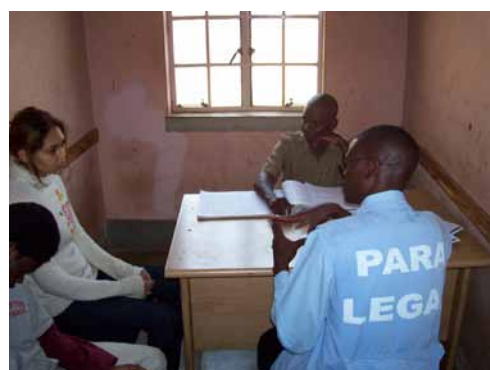
A paralegal attending a Police interview of a child offender at police station

Alternative dispute resolution mechanisms have been successfully utilized to avoid litigation and to expand the options for vulnerable individuals to access justice while maintaining harmony with their communities. For instance, widows and orphans are at times reluctant to take cases to the formal systems for fear of being perceived as airing family matters to outsiders - which might lead to their being shunned in the future. 57 However, the absence of standards, guidelines and an oversight mechanism for mediation can result in poorly mediated processes that are instead injurious to the poor and vulnerable groups especially where cases are "settled but not resolved" and may encourage forum shopping and allowing disputes to fester.