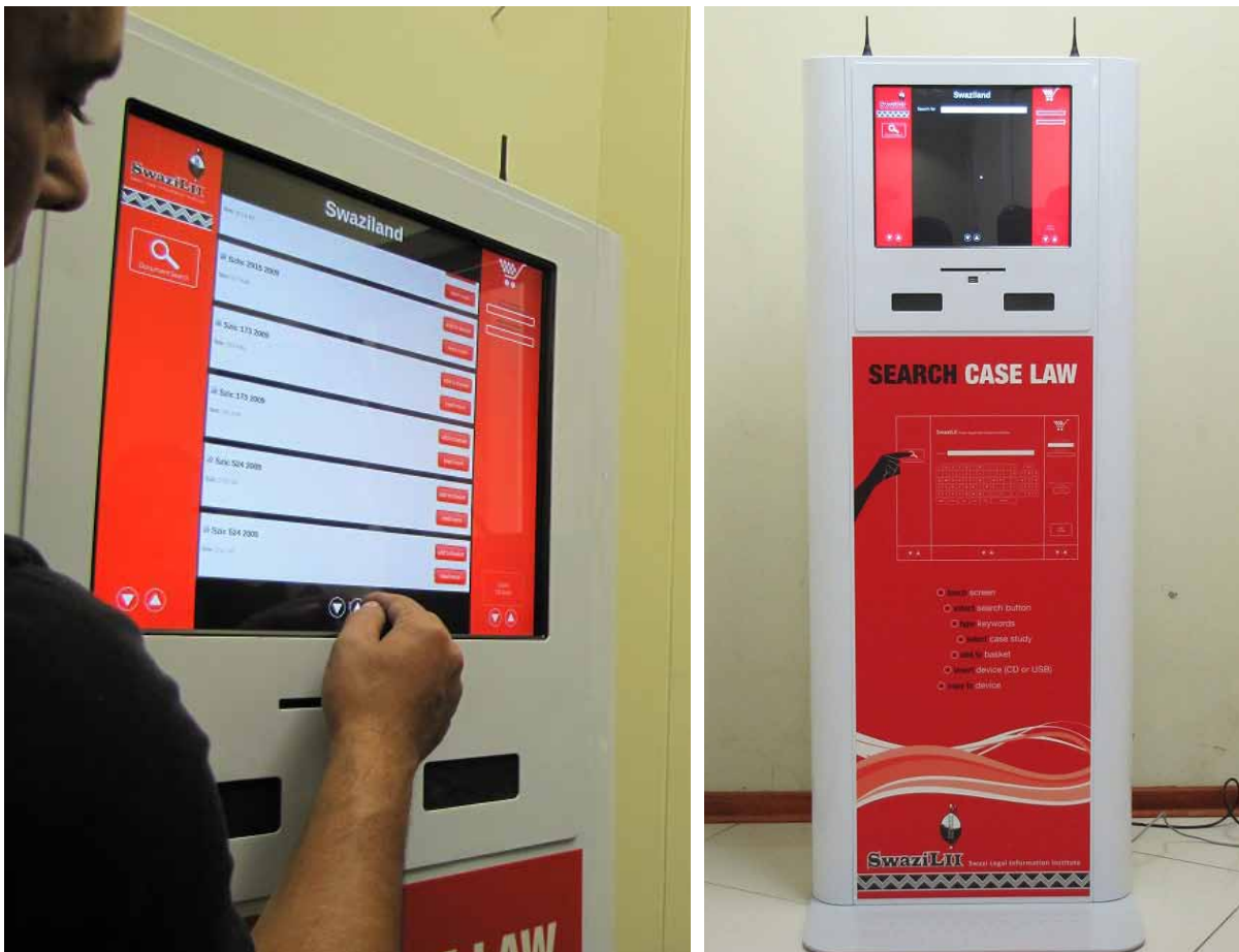
Freedom Toaster which is a kiosk that provides access to case law to those without internet connection.

This computerization will require massive expenditure on expensive court systems. Currently, basic ICT infrastructure is often lacking and funding unavailable. On the other hand, it should be noted that Internet penetration in Africa is growing exponentially and currently stands at 10.9%. 75 This provides opportunities for faster and cheaper alternatives to expensive systems. In Kenya, some promising work is being carried out in less costly Intranet-based open court systems. Initiatives exist using SMS texting, as in eastern DRC, to inform victims of crime of court decisions making use of a fast growing mobile market. This is a potentially viable and cost-effective alternative to explore. 76