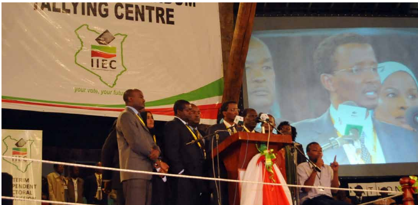
Constitution Making Process, Kenya.