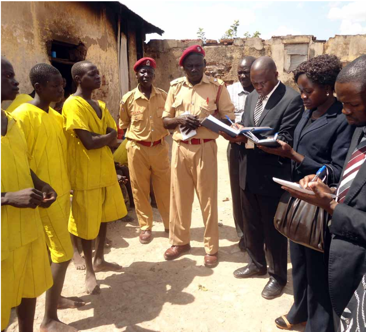
Suspected juveniles in the adult prison being screened by a doctor who was sourced by the Justice Law and Order Sector in the context of justice for children. Thirteen children were confirmed.