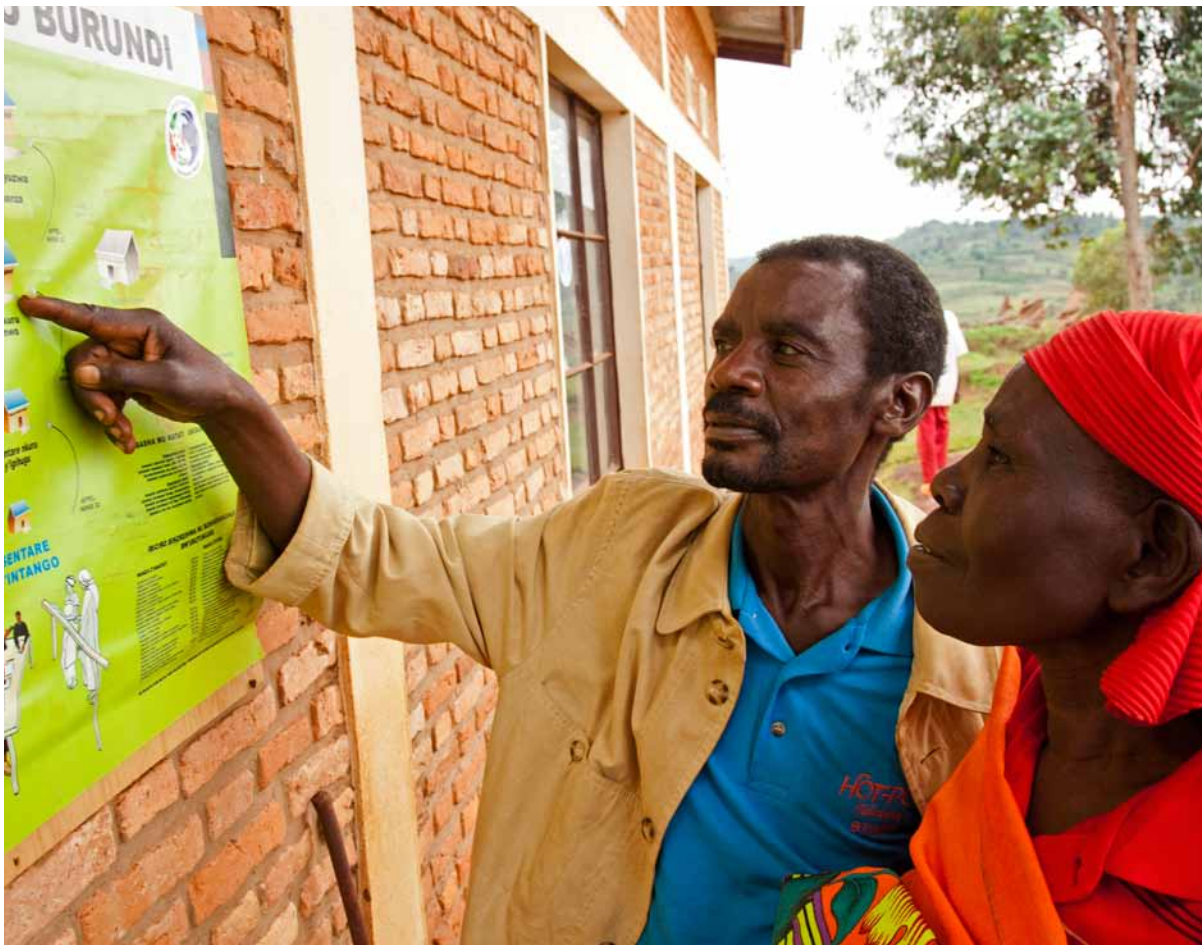
Burundi. Rural farmers find out information about local government systems which include justice systems.

Indeed, a number of African countries continue to top the Failed States Index 18 - a set of criteria that includes: legitimacy of the state, demographic pressures, progressive deterioration of public services, violation of human rights and the rule of law, weakened security apparatus, rise of factionalized elites, chronic or sustained human flight, mass movement of refugees or Internally Displaced Persons (IDPs), vengeance seeking group grievances and uneven economic development. Many states bearing these criteria are embroiled in some form of conflict, are on the brink of war or are emerging from conflict.