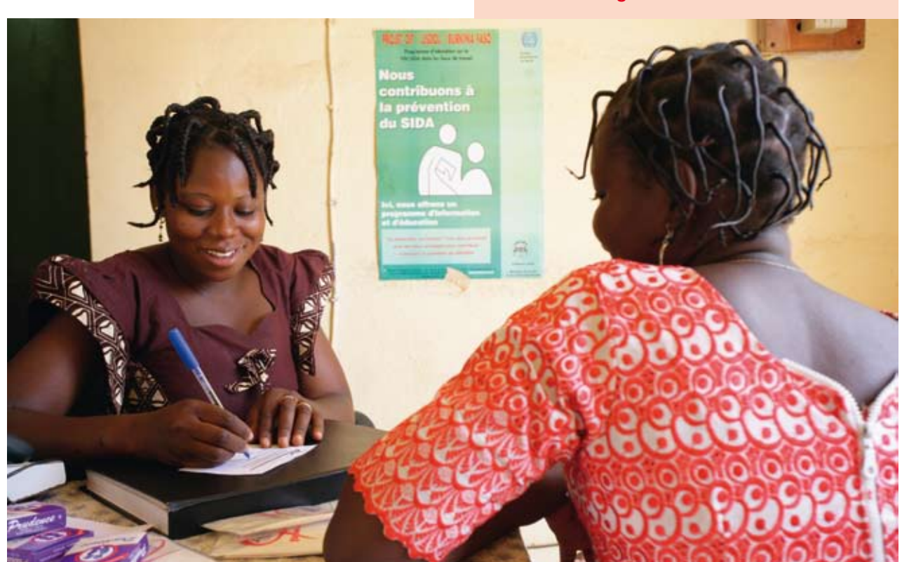
Getting clear information about HIV/AIDS is important for vulnerable young people