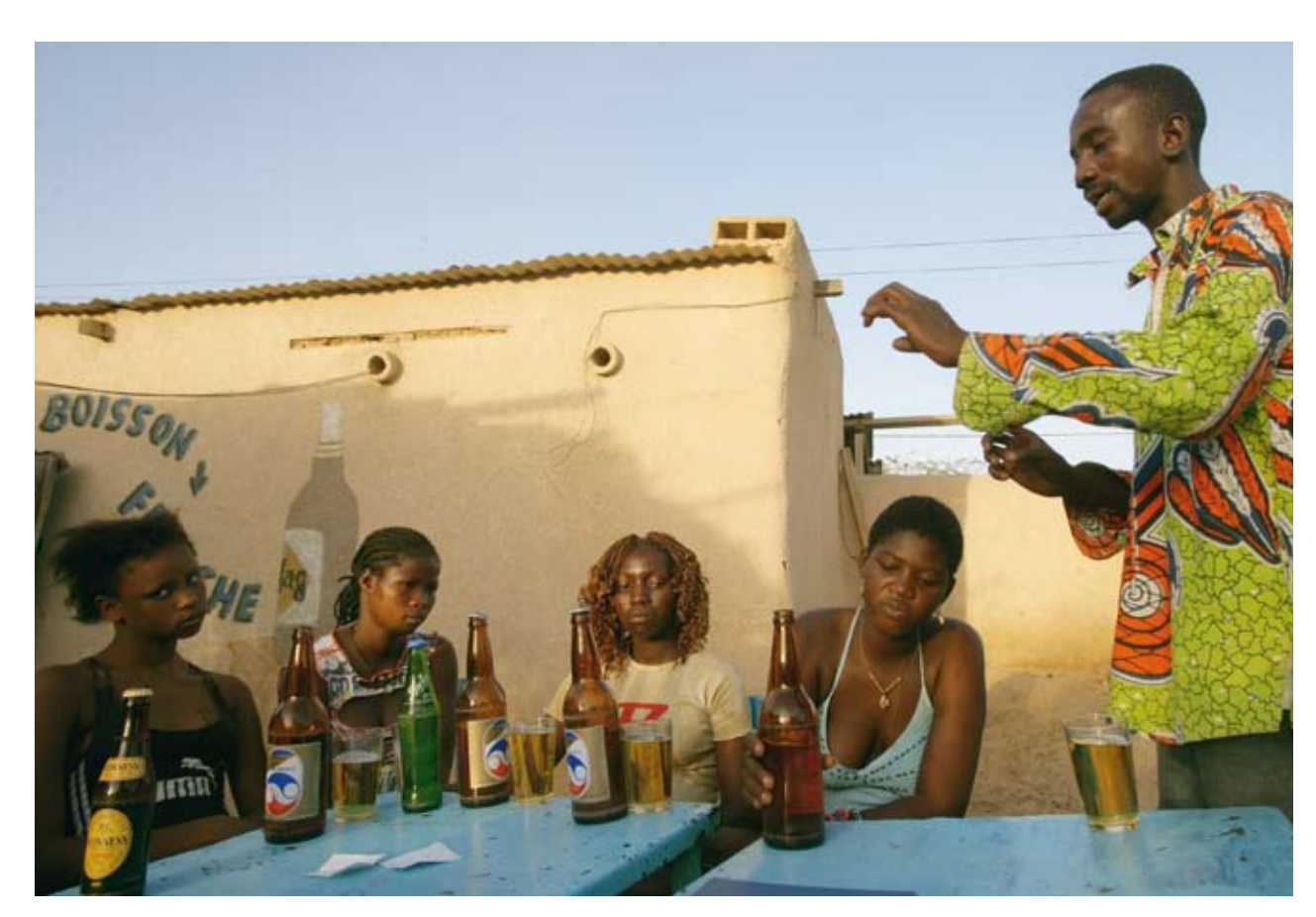
Urgently in need of protection in Burkina Faso's generalised epidemic, bar girls attend a prevention education session before starting their evening's work

He agrees that, as the results of present efforts are monitored and evaluated, adjustments will need to be made to future plans but is confident that, "Through PAMAC 's support to our network we are able to establish strong concurrence with other associations in Burkina Faso. We'll benefit from sharing with these groups and organisations which are learning as they go along, as we are."