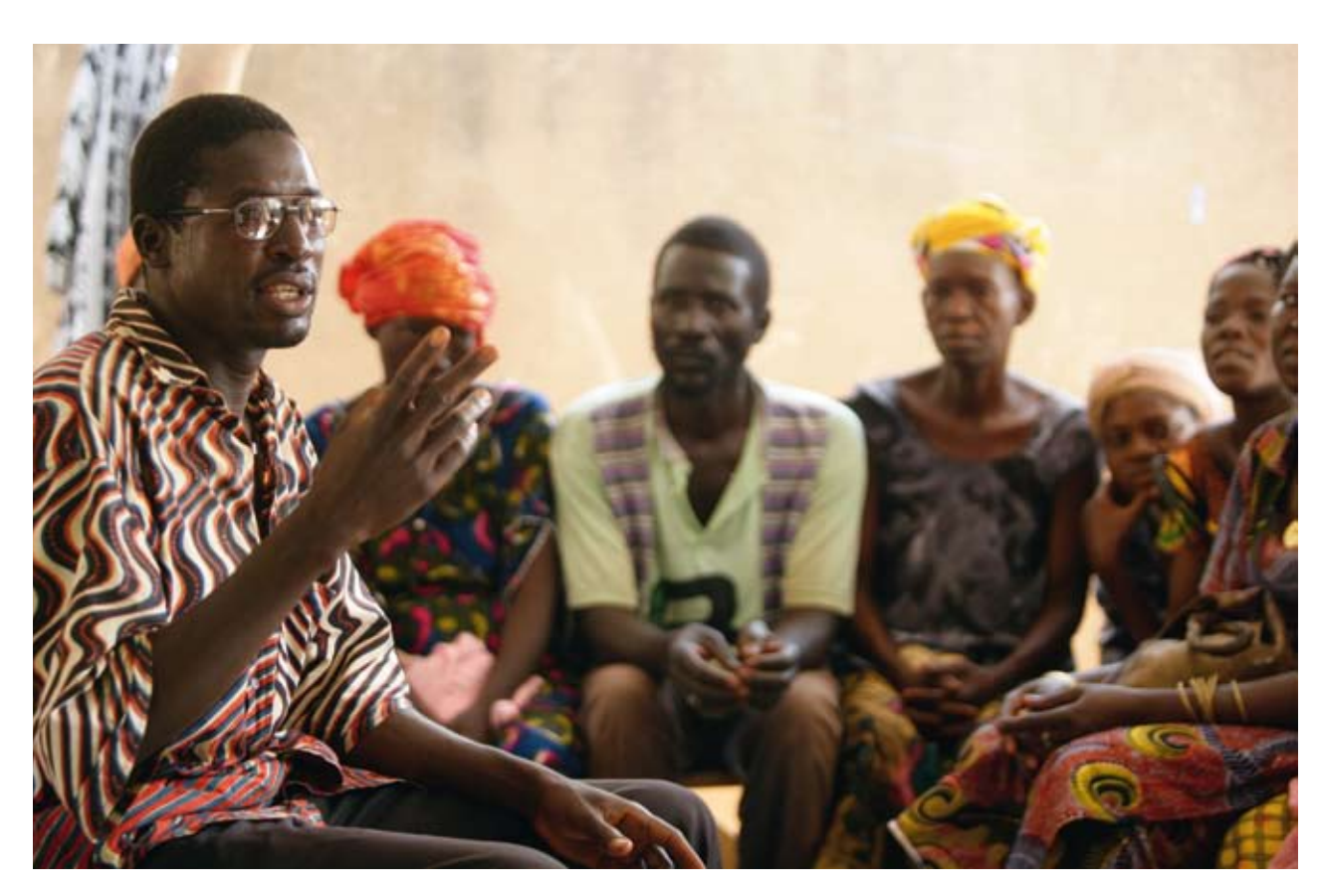
Airing views and problems, exchanging experiences: in a worrying world the weekly APIAS sessions are a lifeline for PLWHAS

People gather here at this time for the food and a discussion session every week, a chance to hear new information, air views and problems, exchange experiences. There's banter and laughter as the baguettes are distributed and a big bowl of salad is handed around.