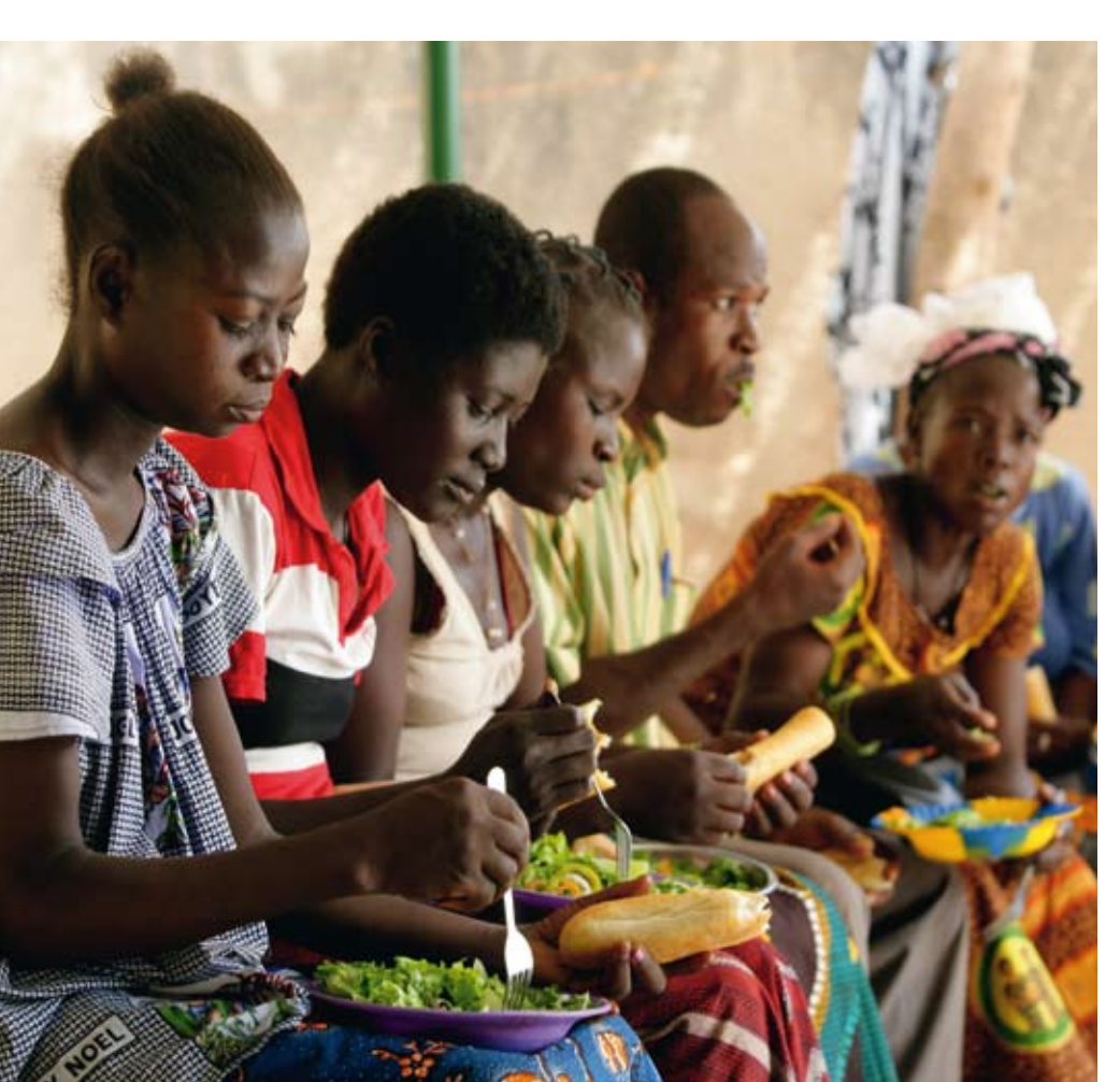
Every week on Friday there's a gathering for a communal meal shared by the PWLHA group at the APIAS centre in Ouagadougo

There is no doubt that the role played by civil society organizations, in conjunction with the role played by national authorities, will represent a key determining in the success demonstrated by Burkina Faso in its efforts against the epidemic.