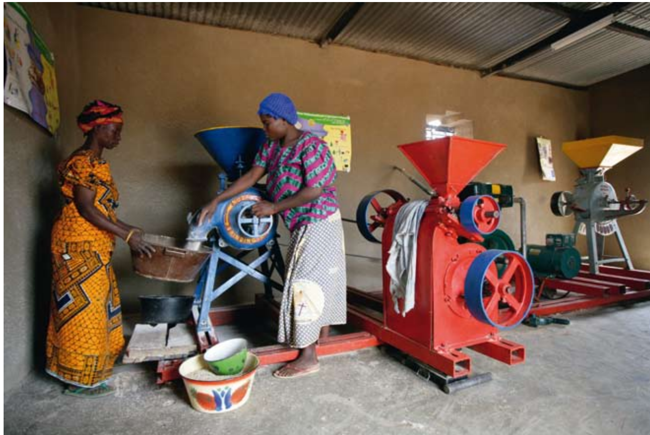
The diesel motor (second from right) powers the red and blue grinders to the left, and the big grey grain mill for sorghum, right