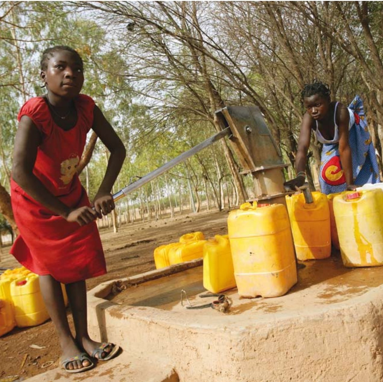
With the Multifunctional Platform, UNDP will reinforce its partnership with the private sector, with the electricity distribution and water sector and with microfinance sector