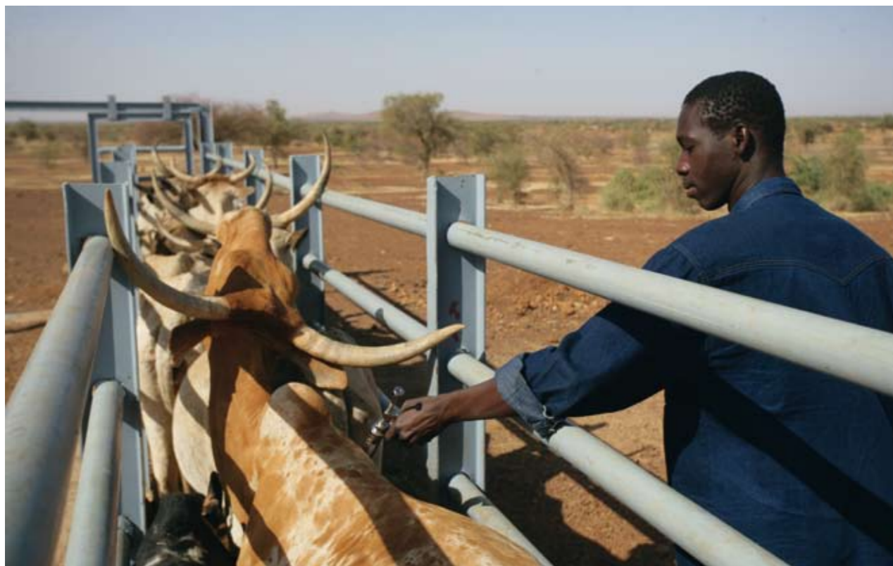
A smooth rapid turn-around for farmers vaccinating their cattle thanks to newly-constructed park near Yalgo

The park is a recent construction, partly financed by the commune of Yalgo. Lower down the hill the old-style model lies deserted, its cumbersome wooden structure toppled over in the dust. These days the turn-around is rapid, a smooth process, today being observed by three individuals closely implicated in its completion.