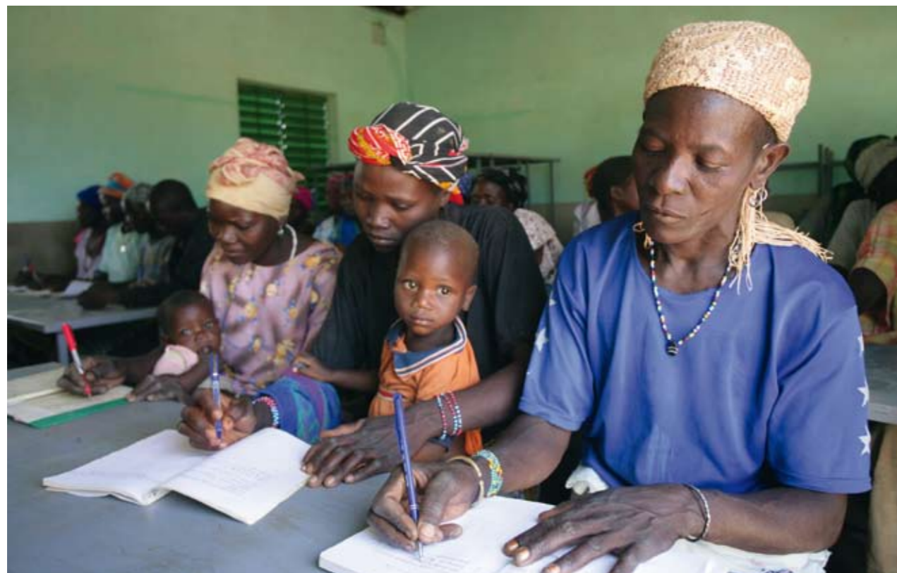
Every day 23 men and women attend literacy training sessions in the Ouagamcé school room

PAPNA's focus is on support to local economic improvement initiatives such as water management projects and investment in programmes ensuring food security. Through these, access to clean drinking water has been increased, literacy training has reached more than 1000 people, and health facilities and cooperative grinding mills set in place.