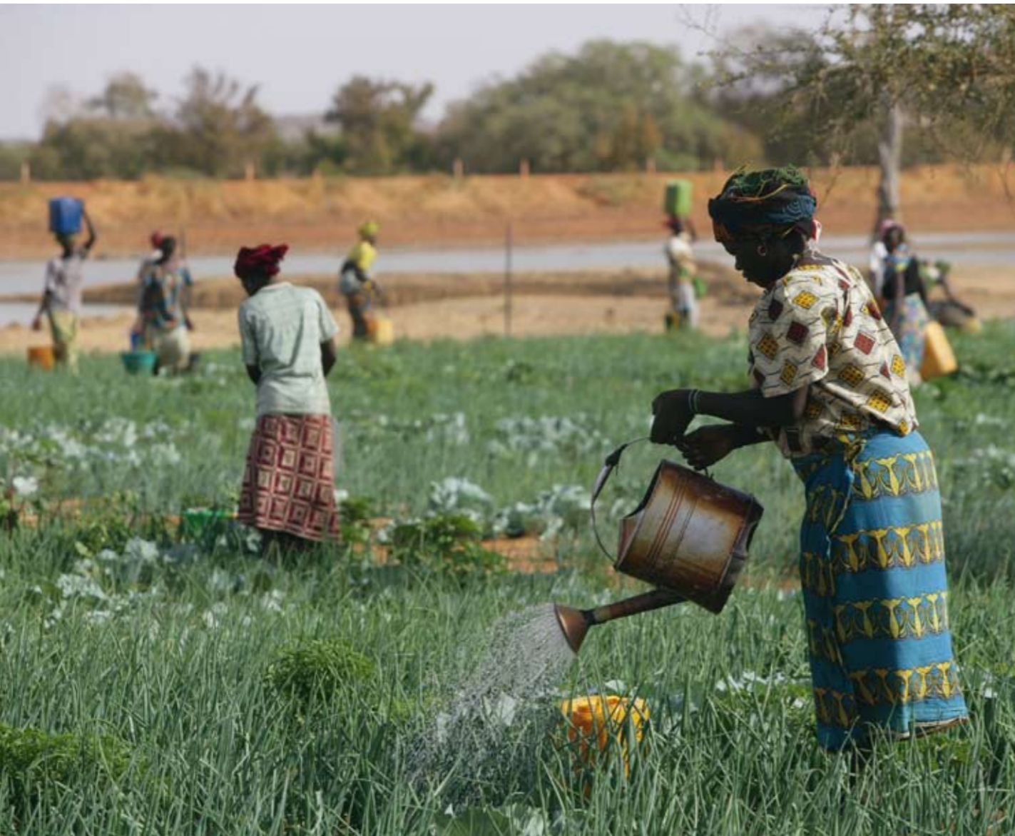
Crops like these improve family nutrition as well as bringing in cash when the surplus is sold

PAPNA support also paid for the plot's perimeter fence and the net which protects the vegetables from birds, and for improving the surface of the track down to the dam. Ensuring food supply in this way is important in a region which is proving increasingly vulnerable to recent changes in weather patterns which are producing drought as well as floods.