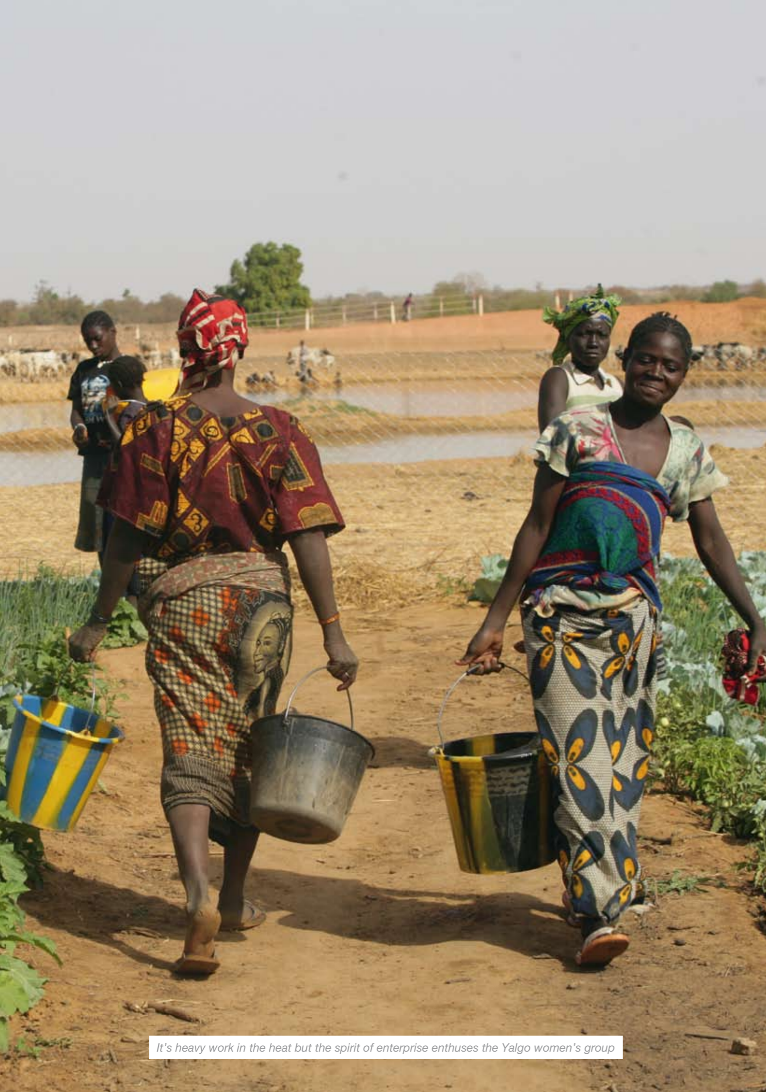
It's heavy work in the heat but the spirit of enterprise enthuses the Yalgo women's group