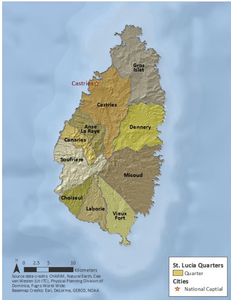
Figure 1. General overview map of Saint Lucia.

homes, and loss of livelihoods. From 1990-2014, cyclones and storms were responsible for 74.4% of combined economic losses to Saint Lucia ( http://charim.net/stlucia/information , 2014). Figure 1 presents a basic overview of administrative information for Saint Lucia.