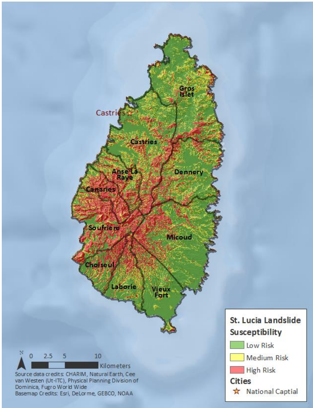
Figure 2. Landslide susceptibility map.

Additional flood hazard maps for the entire island were produced in 2006, 2012, and again, in 2015. Wind hazard maps and storm surge maps were developed for Saint Lucia by Kinetic Analysis Corporation (year unknown). Furthermore, a study on wind speeds was undertaken for Saint Lucia by the International Code Council in 2008 as part of the GEF- World Bank Special Programme on Adaptation to Climate Change (SPACC) Project.