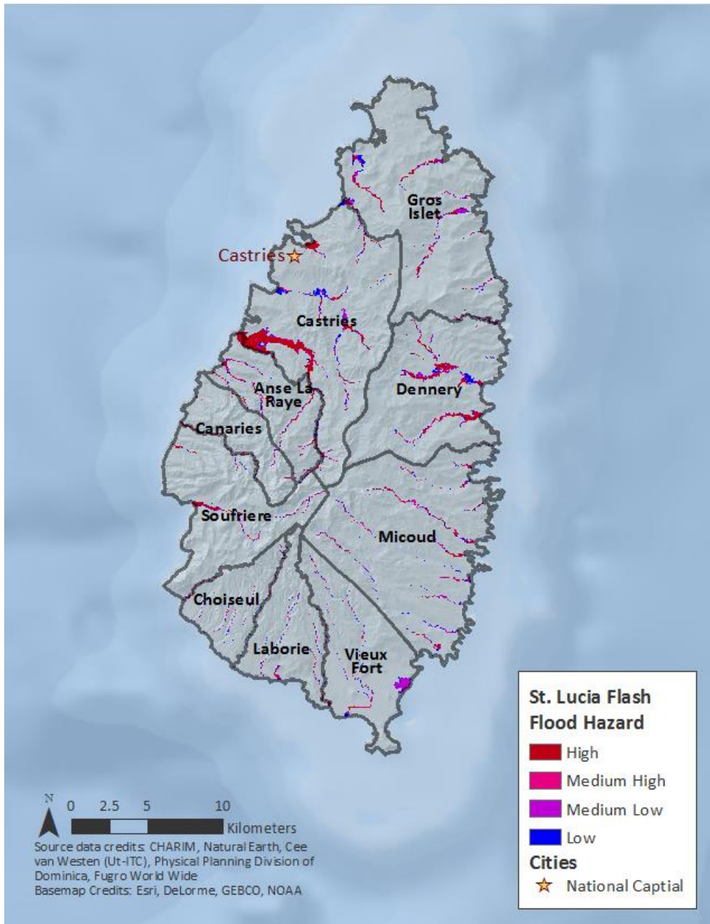
Figure 3. Flash flood hazard map.

The Climate-Resilient Eastern Caribbean Marine Managed Areas Network (ECMMAN) project developed a framework to advance national and regional data collection and strengthen marine managed areas in the region. This included the ECMMAN Monitoring Network which collects, analyzes and shares data through standardized methods, specifically focusing on ecological, socio-economic, and marine management effectiveness. CaribNode is a clearinghouse of natural resource maps and documents to create resource management tools. Finally, the project developed “Coral Reef Report Cards” which assess coral reef health to support marine protection efforts. Major threats to marine areas in Saint Lucia are domestic and agrochemical pollution, sewage contamination,