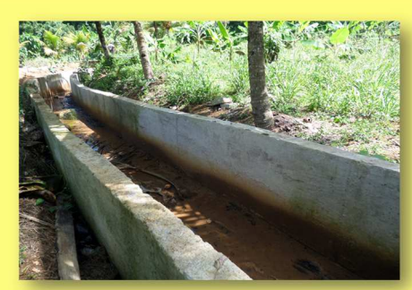
The Storm Drain Constructed in Calibishie

grant of US $47, 500 implemented their project "Incorporating Environment Protection Measures and Alternative Livelihood Activities for Climate Change Adaptation in Bagatelle." Residents of the community and the nearby villages testified that if it were not for the newly constructed 1600ft drain, during Tropical Storm Ericka they would have been a repeat or worst disaster than the Bagatelle Landslide of 1977 which claimed the lives of 13 persons. Congrats to the Dominican SGP Team for having the foresight to support these two projects. (TP)