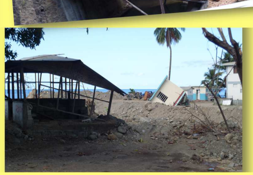
A Collection of Photos from the Infrastructural Damage left by Tropical Storm Ericka