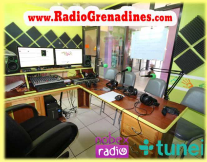
Radio Grenadines Studio

"Today twenty-one proud men and women sit across from me, now trained in Radio Broadcasting and Production."