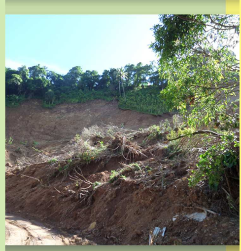
The Path left by landslides in Petite Savanne

On Wednesday August 28<sup>th</sup> 2015, the waters of Tropical Storm Ericka descended on the Nature Isle of Dominica causing massive destruction, mudslides and severe flooding. The days ahead were grim as Dominicans came to grip with what Ericka had left behind: loss of homes, major damage to the islands infrastructure and the loss of life. But in two communities with GEF SGP initiatives there was hope, Calibashie and Bagatelle.