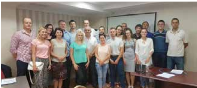
Project Cycle Management Training in Banja Luka

After public calls for projects for local communities and civil society organisations, there was a clear need for capacity building in this regard. In order to successfully resolve the issue of project involvement and facilitate the application process, in cooperation with the Centre for Civil Society Promotion, trainings were organised for local communities and civil society organisations on how to prepare project proposals, as well as the Training of Trainers and lobbying training for the third group of LSGUs.