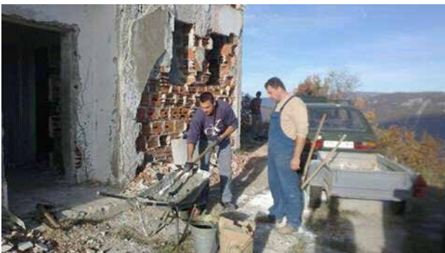
Works on the mountain lodge at the Pisvir peak

I hope this local community will only more forwards and that the right person would follow in my footsteps. My wish is to involve young people more actively in development activities, and to stay here – but that requires greater focus on job creation and employment.