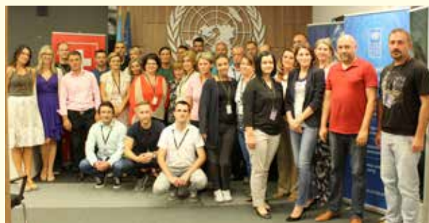
On 15 August 2017, in Sarajevo, UNDP signed new contracts with 27 civil society organisations in 35 local communities