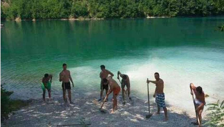
Cleaning a beach in MZ Slatina, Jablanica

We also cooperate with the organisation “Under the same sun”, and we worked together to make a beach on the banks of the Jablanica Lake and the cleaning of the banks. This organisation has also carried out training for members of our local community, and provided premises and IT equipment to work in project preparation.