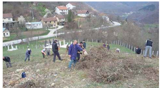
Mowing and cleaning of the graveyard