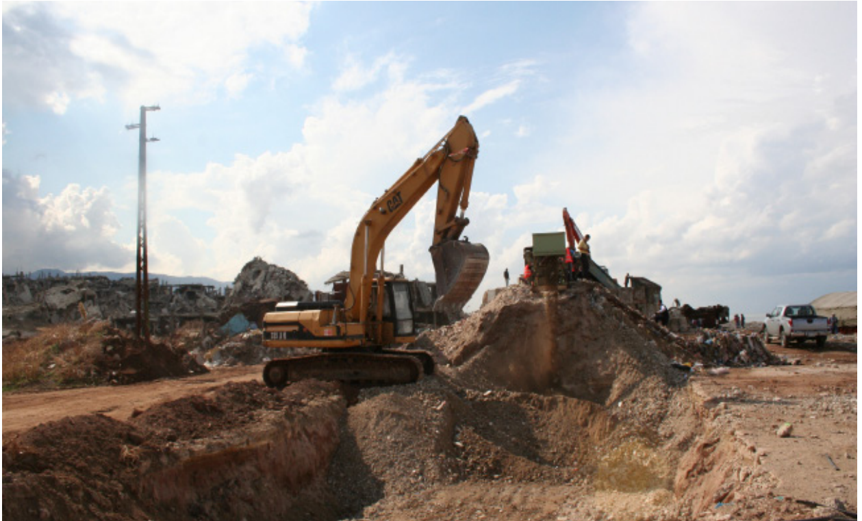
A UNDP project in southern and eastern Somalia supports recovery of conflict-affected communities through community infrastructure rehabilitation. This photo shows members of a participating community in the Bay region working to construct a water catchment.

This section looks at the implementation challenges that will need to be addressed if UNDP is to turn the objectives outlined in the previous two sections into practical actions as quickly as possible. Project implementation is framed within three main phases over a period of up to two years.