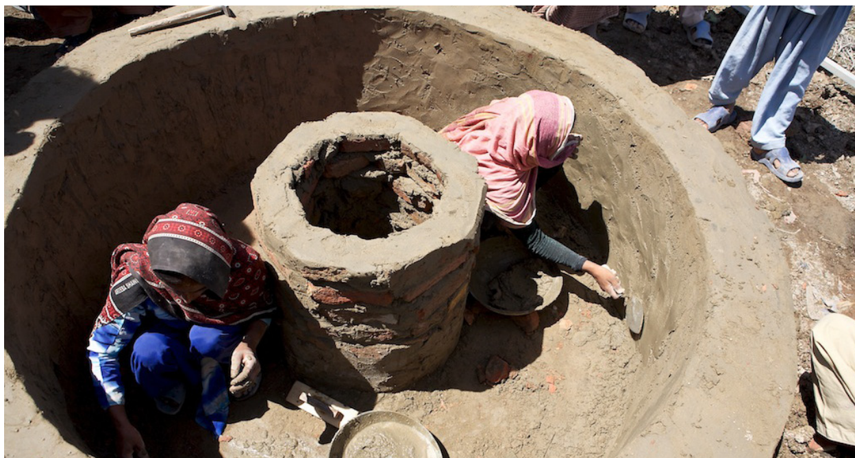
After the 2010 floods in Pakistan, UNDP supported the active participation of women in Sindh in reconstruction and masonry work, some of whom are now earning their livelihoods with skills they gained through UNDP support.

The following lessons are among the main findings gleaned from UNDP's engagement in community infrastructure rehabilitation in the aftermath of natural disasters and crises. Additional thematic lessons learned are to be found in the Comparative Experience Paper on Community Infrastructure Rehabilitation .