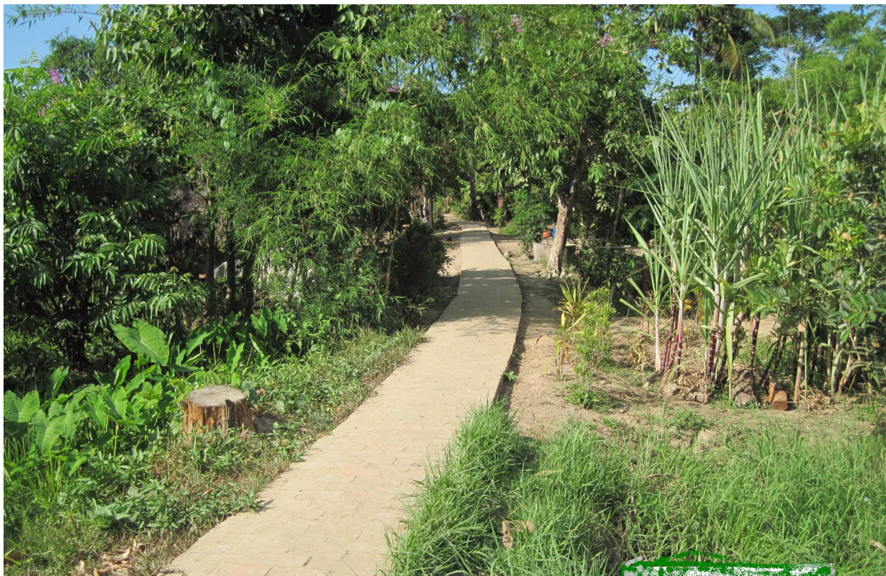
UNDP's 'build back better' approach in Myanmar helped Chaung Ma Gyi village improve on pre-Cyclone Nargis facilities: a mud path which was prone to flooding is now elevated and paved.

This chapter focuses on a number of key issues to take into account when developing a project document for community infrastructure rehabilitation. The related stages of the UNDP project management cycle are ‘Justifying a project’ and ‘Defining a project’ , as per the UNDP Programme and Operations Policies and Procedures (POPP). The major sections fall under the familiar titles of: 1) Situation Analysis, 2) Programme Strategy, 3) Results Framework, 4) Risk Assessment, 5) Management Arrangements, 6) Operational Support, 7) Partnerships, 8) Monitoring and Evaluation (M&E), 9) Resource Mobilization, and 10) Communications Strategy. A checklist for the planning phase is provided at the end of the section.