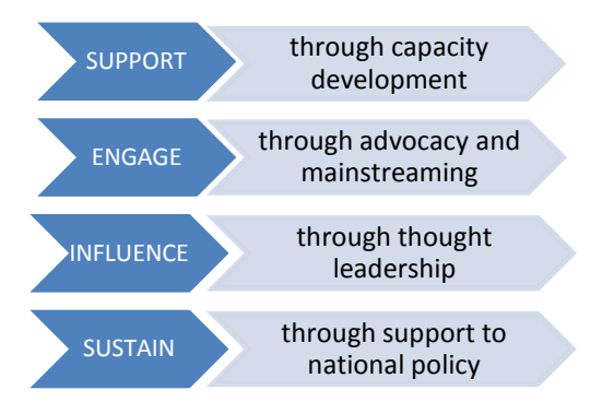
Figure 4: Four-pronged approach to support UNDP Youth Strategy outcomes

This section looks at how to support the processes required to carry out the many activities proposed in the UNDP Youth Strategy. Working towards the strategy's three main outcomes will be furthered through a four-pronged approach.