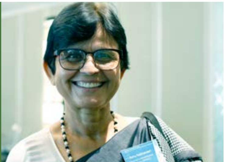
N. Paul Divakar, Chairperson, Asia Dalit Rights Forum

Present economic policy divides civil society from the private sector, so how do we bridge this gap that is the biggest challenge...in order to meet transformative outcomes it is very much necessary to transform people's mindsets, and its very much needed that the whole governance system gets transformed.