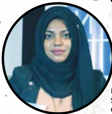
MARIUM JABYN, STATE MINISTER, MINISTRY OF GENDER & FAMILY, MALDIVES