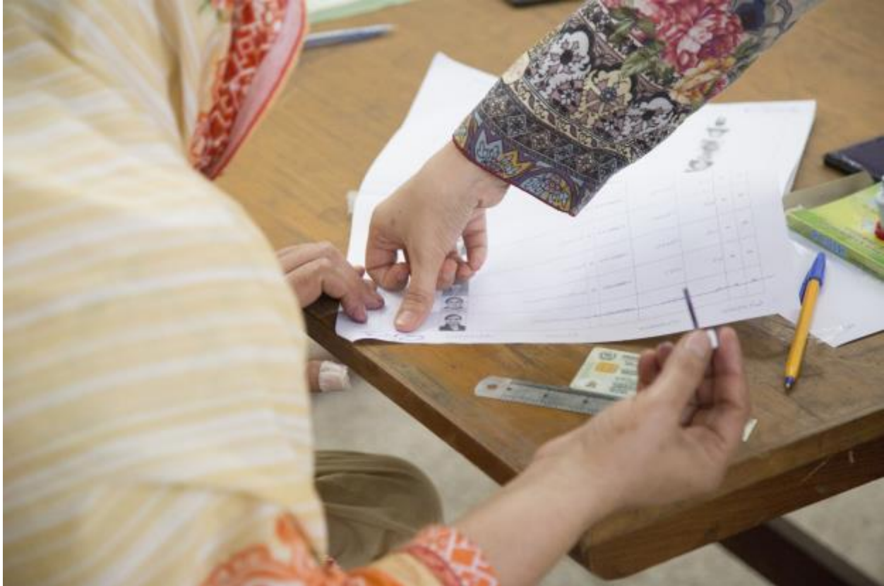
3 - UNDP Pakistan

A NIC is not only required to access public services, such as to obtain a driving license, open a bank account, start a business, purchase a mobile phone, but it is also a prerequisite for voter registration in Pakistan.