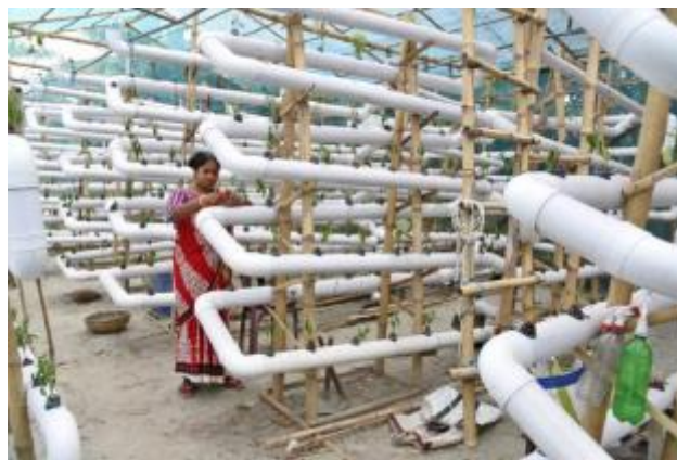
19 - Photo: Amit Kumar/ UNDP Bangladesh

She has been teaching other women in her area about hydroponic farming, as well as branching out to a crab farming cooperative. There are nine such cooperatives in Deluti Union that farm saltwater crabs — a proven climate-adaptive livelihood— operated entirely by village women.