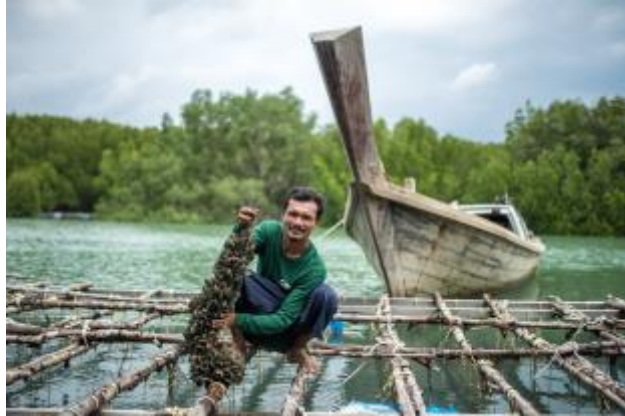
17 - UNDP Thailand

Ensuring gender equity in public finance management sounds very challenging. What are UNDP's strengths and opportunities in taking on this challenge?