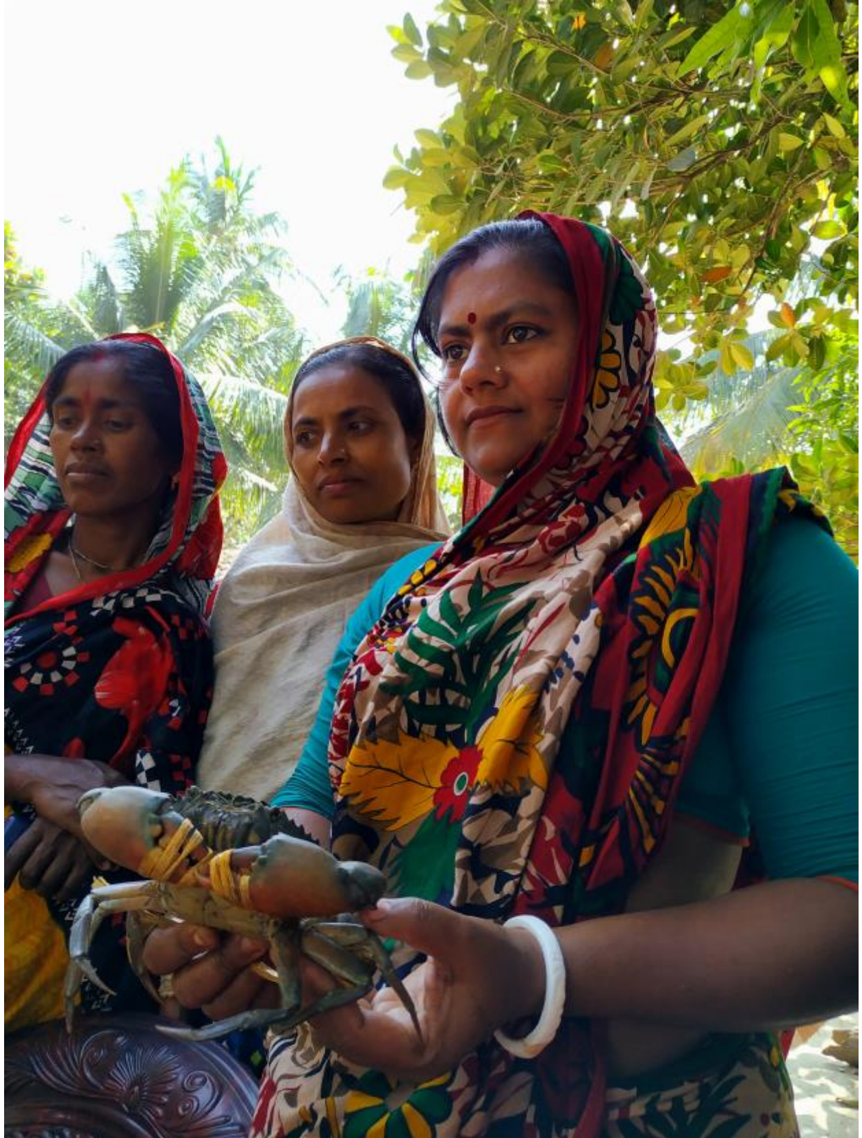
23 - Photo: UNDP Bangladesh