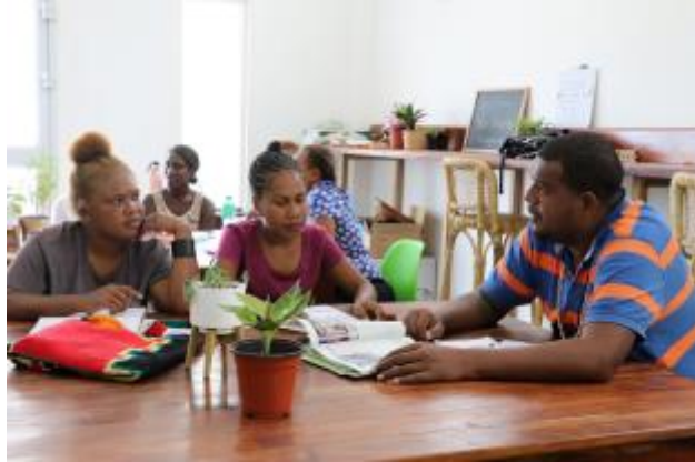
11 - Young entrepreneurs discuss challenges to operating a business in Solomon Islands during training at lumiWaka on 19 February 2019.

By offering office facilities, regular training and opportunities to network with peers and experienced members of the business community, the co-working space will help youth overcome common barriers to establishing a business.