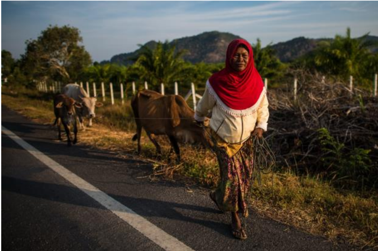
1 - UNDP Thailand

11. Blog | Dressed for Equality by Luciana Arlidge