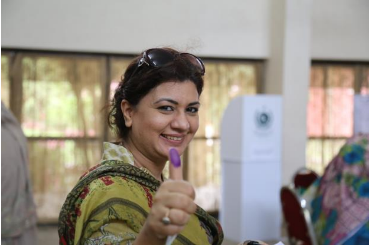
4 - UNDP Pakistan