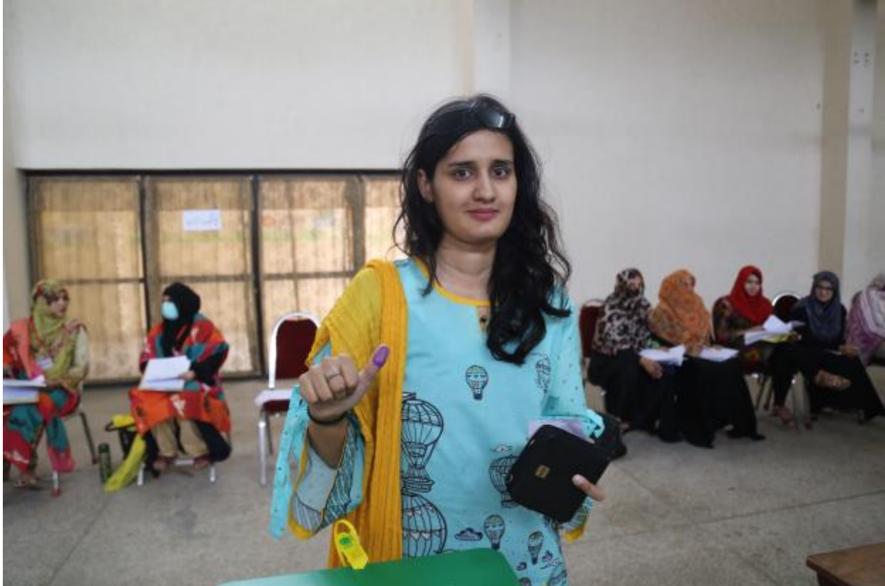
5 - UNDP Pakistan

Through targeted community efforts, unregistered eligible women were facilitated to obtain their NICs in order to become voters and take advantage of other fundamental rights that become available with a NIC. A series of measures, such as fee waivers for first-time NIC registrants, incentives for NADRA employees to increase efforts for NIC registrations by women, coordinated utilization of mobile registration vans, and increasing working hours for selected NADRA field offices were adopted to facilitate the registration of women. In addition, existing ECP working groups were actively engaged to mobilise and inform the public. Various inclusive voter information activities were held targeting women, and men, to raise awareness on women's electoral participation.