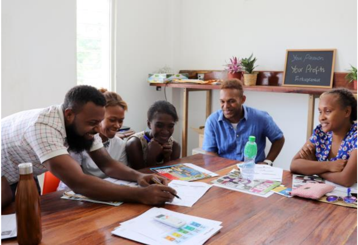
12 - Young entrepreneurs share how aspects of Solomon Islands culture challenge business owners during training at lumiWaka on 19 February 2019.