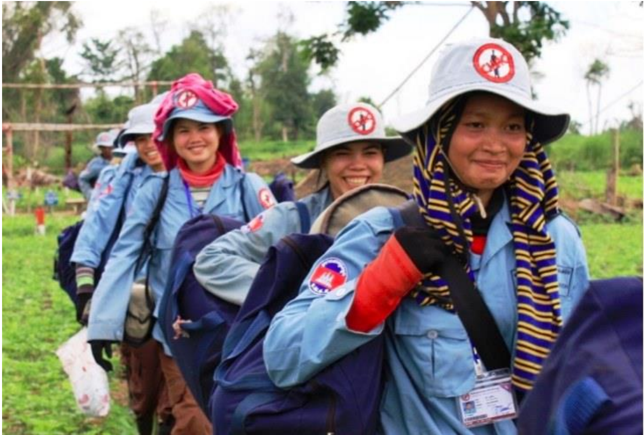
13 - Women in demining heading to work (Photo by CMAA)/UNDP Cambodia

She is supported through UNDP's Clearing for Results Project with the Cambodian Government, which have encouraged more women participation and visibility in the sector. The project ensures equal participation of women and men in decision-making roles in mine action activities, the empowerment of the role of women in peacekeeping operation, and addresses the issue of the Explosive Remnants of War (ERW). Although the work sounds terrifying, women in the sector have gained an extraordinary level of confidence in themselves from being in the field.