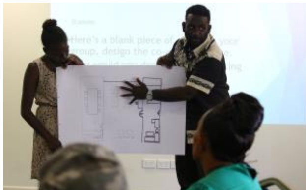
8 - Young entrepreneurs suggest layouts for lumiWaka at the design workshop organized by YECSI and UNDP in Honiara on 27 November 2018.