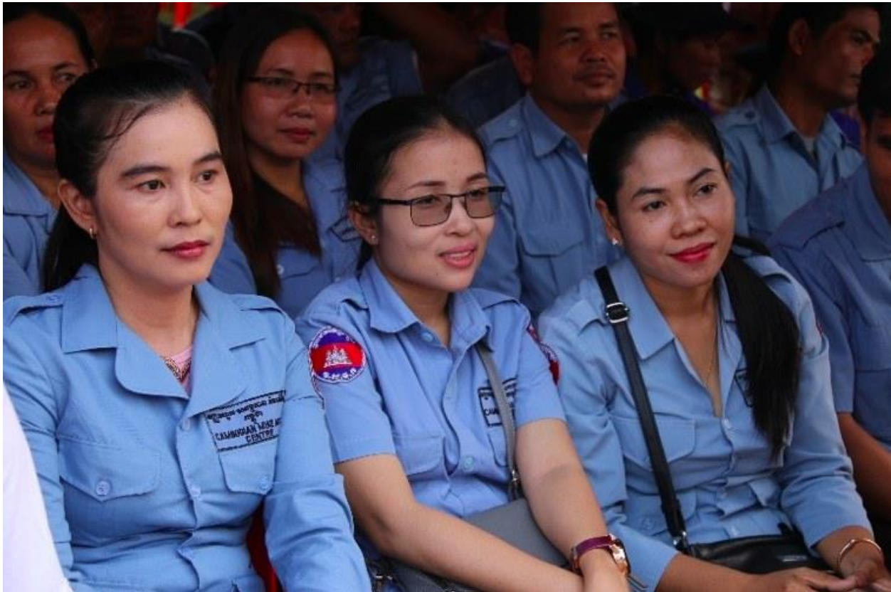
15 - Women in demining from the Cambodian Mine Action Project/UNDP Cambodia