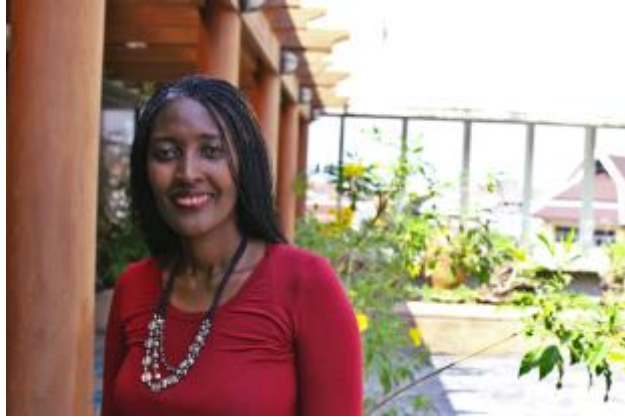
18

brought at the forefront and are given the opportunity to be heard and to determine the priorities. Their participation fills in the gaps that must be considered to maximize the impact of climate finance.