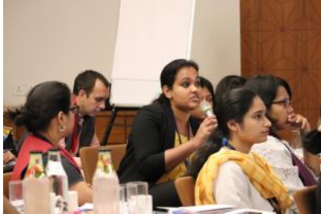
24 - Open Ideation Workshop, Hyderabad, India

A key barrier to the greater participation of women in the workforce is the unavailability of reliable and affordable childcare services.