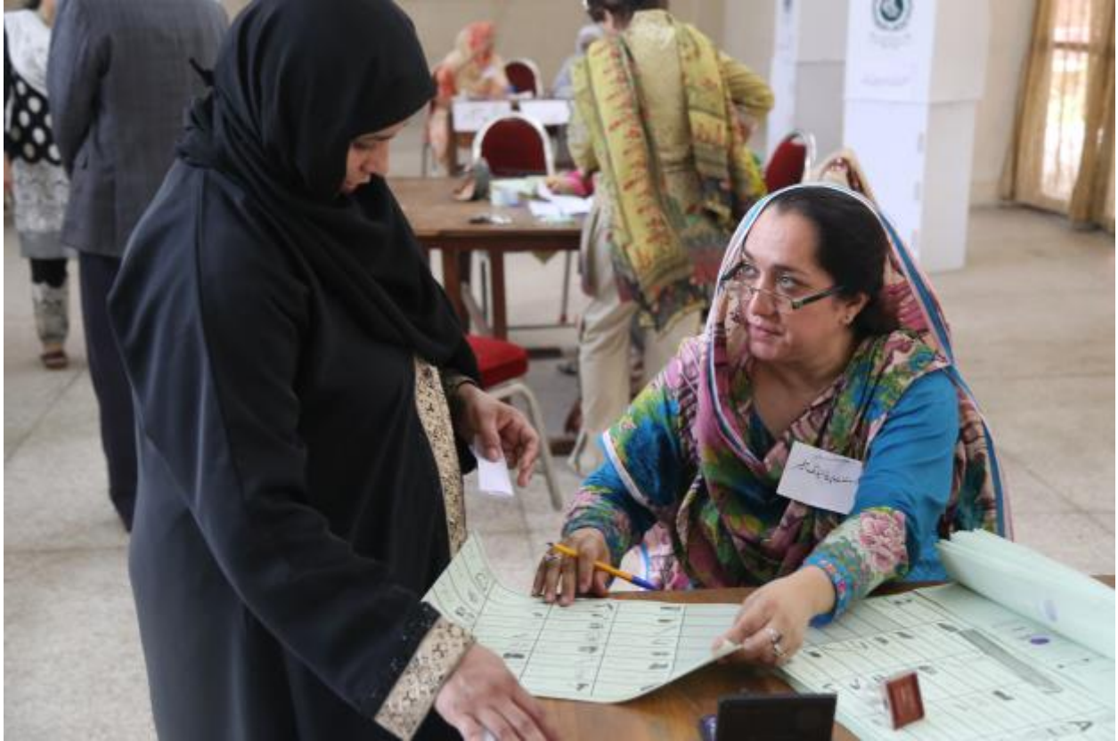
6 - UNDP Pakistan