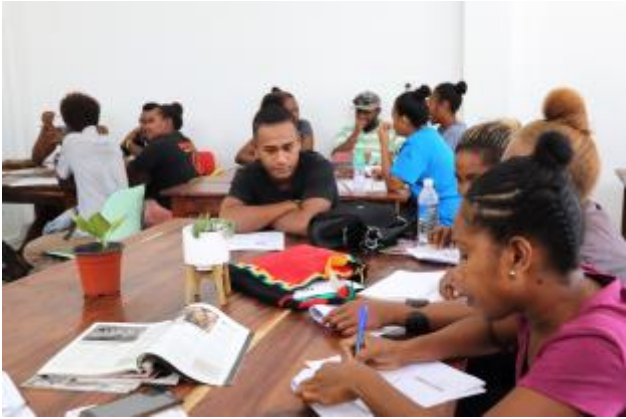
10 - Young entrepreneurs discuss challenges to operating a business in Solomon Islands during training at lumiWaka on 19 February 2019.