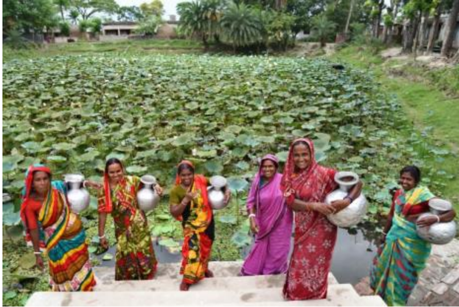
21 - Photo: Amit Kumar/ UNDP Bangladesh

UNDP and the UP's goal is to provide them with alternative climate-adaptive livelihoods, and make it easier for them to collect freshwater—to make them better equipped to face climate change.