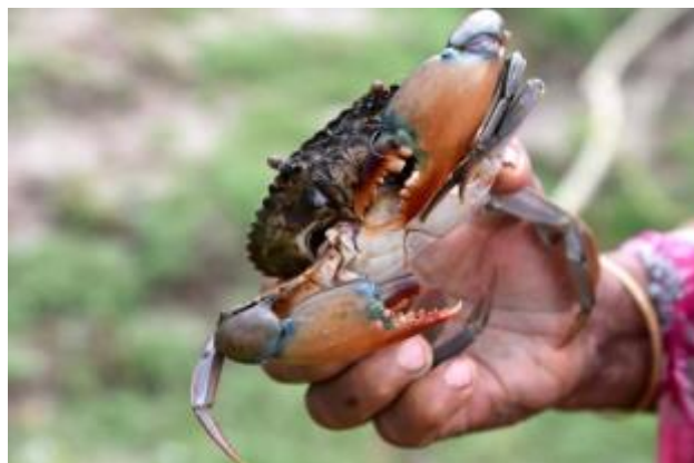
22 - Photo: Amit Kumar/ UNDP Bangladesh

The UP conducted a union-wide survey taking into account women's land ownership, quality of land (i.e. salinity), annual income, infants and school-going children, and if they were affected by cyclone Aila or lived in a cyclone-prone area.