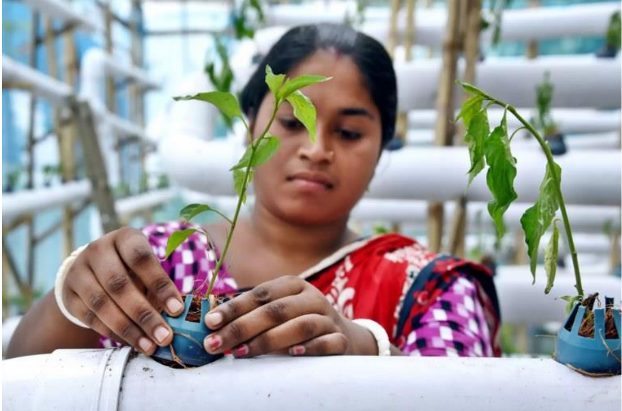
20