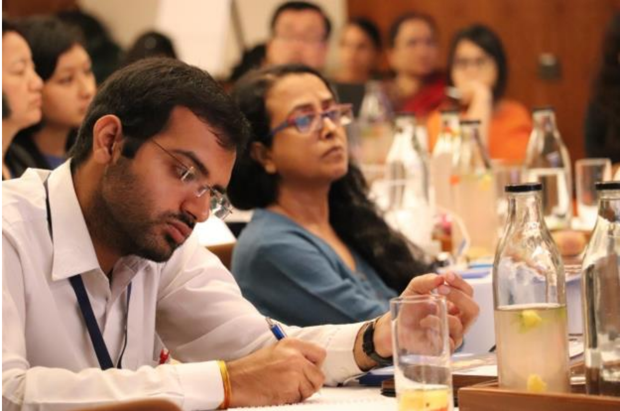
25 - Open Ideation Workshop, Hyderabad, India

To change people's behaviour towards and perception of unpaid work, participants considered a few different options. One solution proposed by the participants involved working together with major advertising companies and agencies, and offering them gender-responsive training. The advertising industry in the Asia region has grown exponentially. By encouraging images used in advertising to take a more gender-neutral approach, they could potentially influence the narrative of gender roles in the home and help redistribute unpaid work more fairly between women and men.