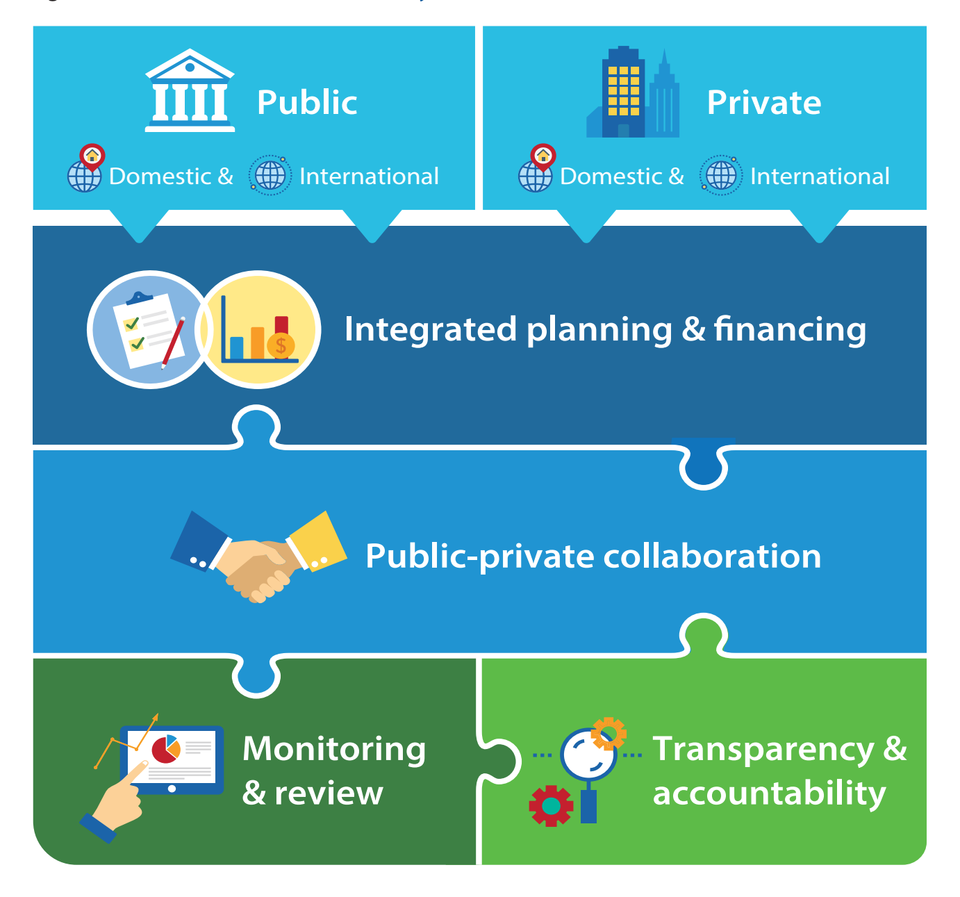
Figure 1. The dimensions of the DFA analytical framework