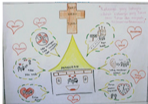
In this picture, Sara Kaigere describes how parents and children in the household should treat each other: parents shouldn't yell at each other when they are angry and shouldn't be violent towards their children if there is something they do not want their child to do. It is important to spend time with family and to be willing to listen to each other.

In Cambodia, volunteerism included drawing pictures, writing song lyrics, and a writing competition and these finished pieces were then shared with the community.