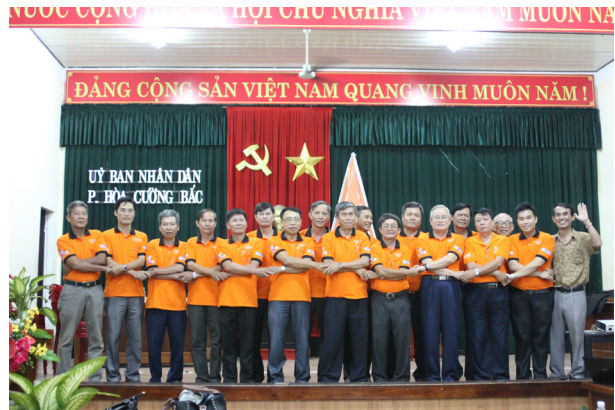
Male advocates club, Viet Nam

personally meaningful and fulfilling to unique opportunities for capacity development and career development. P4P maintained ongoing discussions with volunteers to understand how to structure their work in the most rewarding ways and ensuring that investment is made in their ongoing capacity development and career coaching, integrating them into a team, providing regular support, and continuously recognizing their contributions and highlighting their achievements.