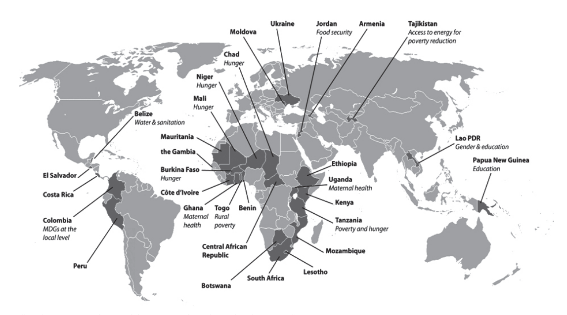
"WORK IN PROGRESS: MAF ROLLOUTS TO DATE"

The strategy assumes most governments and partners "know the interventions required to meet the MDGs" and identifies three factors constraining implementation: "a lack of capacity to systematically identify and address bottlenecks/constraints; poor alianment of efforts to overcome bottlenecks; and limited accountability for government agencies and development partners". 728 All three reside at the core of governance concerns and need to be addressed with determined and comprehensive efforts to address features of poor governance, including adoption of a human rights based approach. This valuable insight does not seem to be picked up in the strategy or the operational parts of the MAF. An opportunity to highlight UNDP's particular expertise in these areas thus appears to be missed.