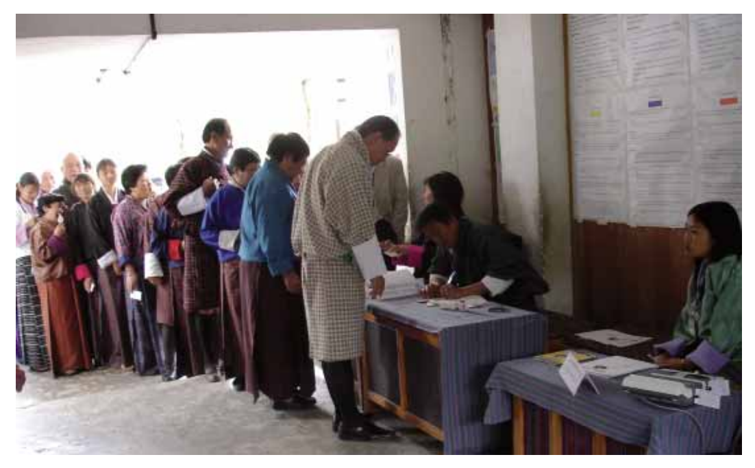
Primary round mock elections, Bhutan