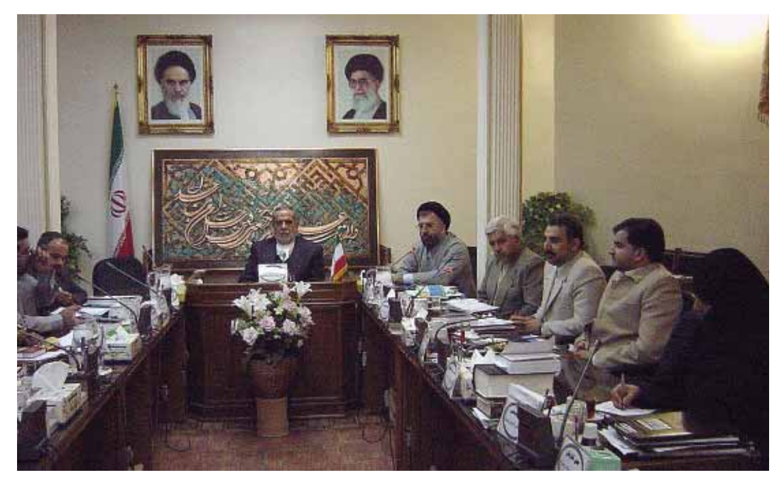
Municipal council meeting in Qum, Iran

This again evokes the frequent tradeoff between representation and service delivery functions. Village Councils can "afford" to meet more regularly than District Councils, although the latter exercise oversight authority over a much wider range of services and considerably bigger budgets.