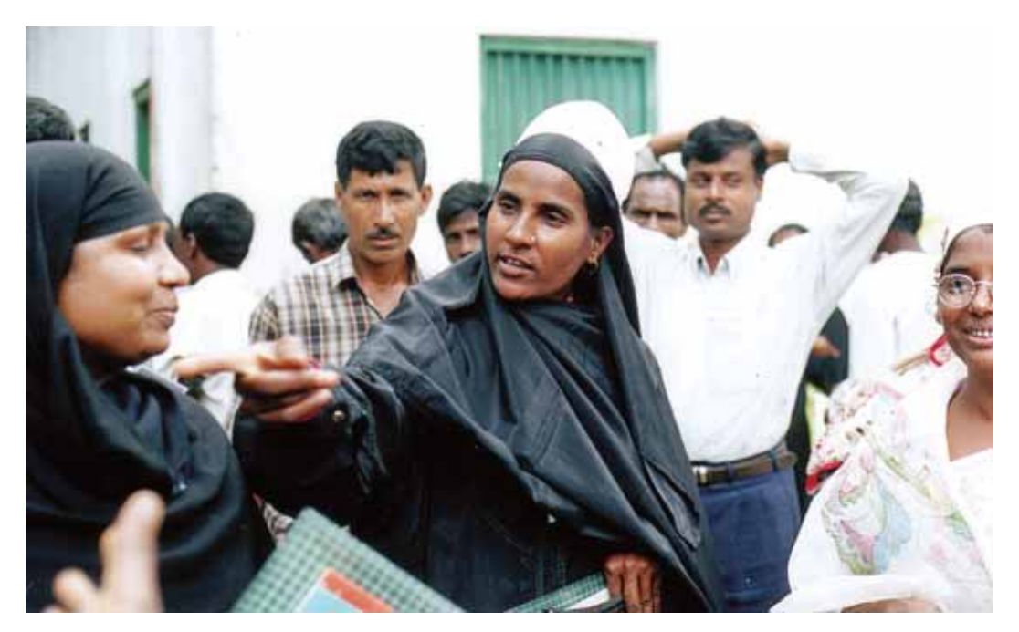
Zilla Panchayat members, Bangladesh

In Philippines, steps have been taken beyond merely reserving seats for the young in that a separate LG body (the Youth Council) has been established; only those older than 15 but younger than 21 may stand for election as well as vote. A member of these bodies also serves in the other LG units. In addition, municipal and provincial councils in Philippines are required to appoint three "sectoral" members, representing women, workers and other disadvantaged groups as necessary.