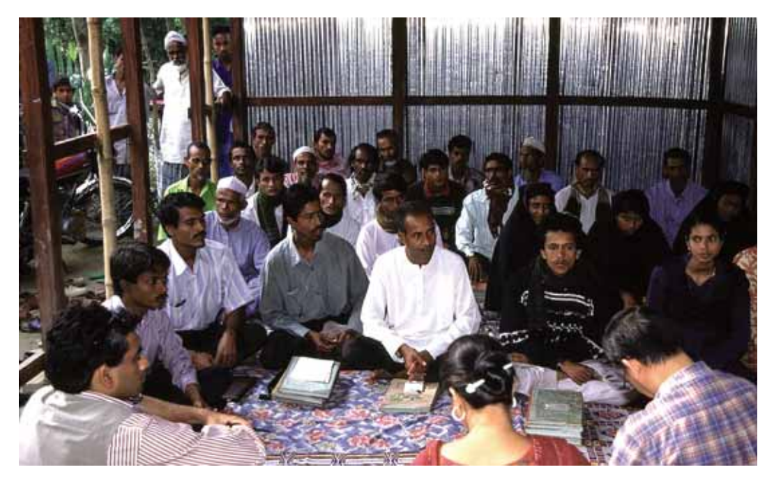
Zilla Panchayat meeting, Bangladesh

In other cases, it can be argued that de-politicizing LG elections reduces the potential for tensions between different LG tiers. However, in the case of upper-tier LG Councils being largely elected indirectly by lower-tier Councils (e.g., Pakistan, partly in Philippines), this should not be as much of an issue as when upper tiers are directly elected (e.g., Indonesia).