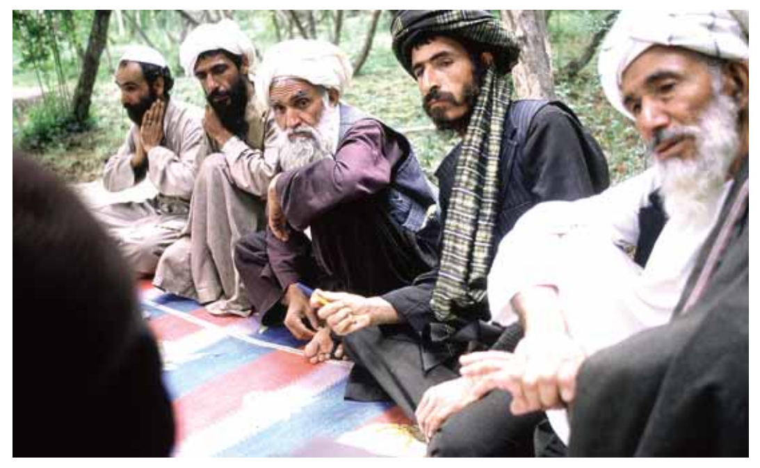
Village council elders, Afghanistan

In such African cases, traditional chiefs "represent" custom – and custom is considered to be of importance, hence the need for elected LGs to cohabit with them in a constructive way.