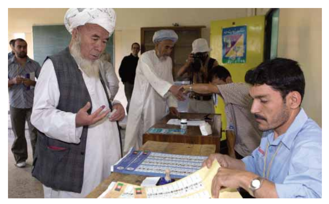
Wolesi Jirga and Provincial Councils election day, Afghanistan 2005

A number of issues arise here. Firstly, are directly elected officials more accountable to their constituents than indirectly elected officials? For example, in India, where all councillors at all levels are directly elected, can it be said that they are more accountable then their Nepali counterparts on District Councils, who are largely drawn from Village Councils? There is no hard and fast evidence on this – but common sense would tend to indicate that directly elected officials in upper-level LGs would be more accountable to their constituents for overseeing activities/functions specific to that level. Where councillors are indirectly elected from lower-level LGs, they clearly also owe some allegiance to their "base" constituency, rather than to the larger constituency.