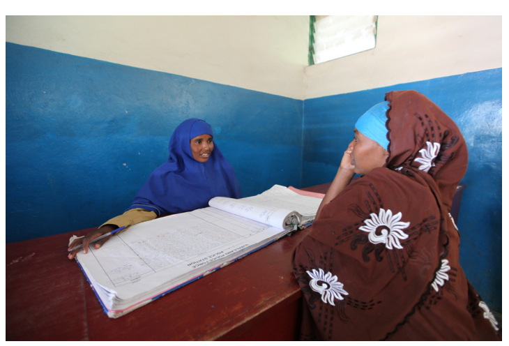
The Women and Children police desk in Hargeisa, Somaliland. With UNDP's support, this unit and others like it ensure that the particular needs of women and juveniles coming into contact with the law are appropriately addressed.

As part of this programme, UNDP works with judges, police, prosecutors, elected officials, and civil organistions to provide free legal aid to victims. In addition, UNDP provides human rights training, and technical assistance to enable countries to build accountable, transparent and fair institutions, as well as open political dialogues on justice and security.