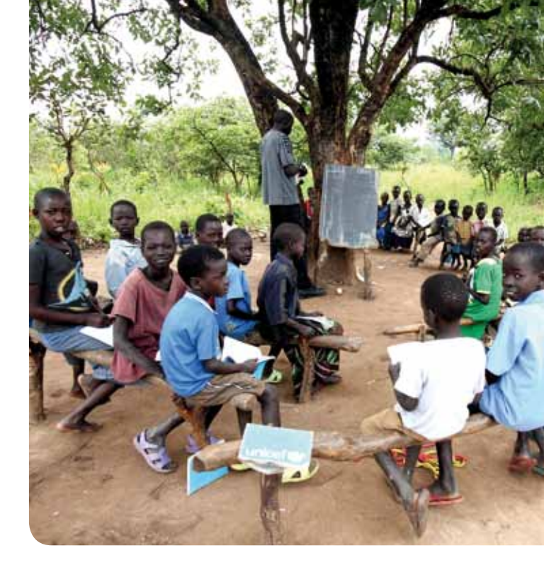
Capacity development is a central strategy for reducing disaster risk (Words into Action, ISDR, 2007)