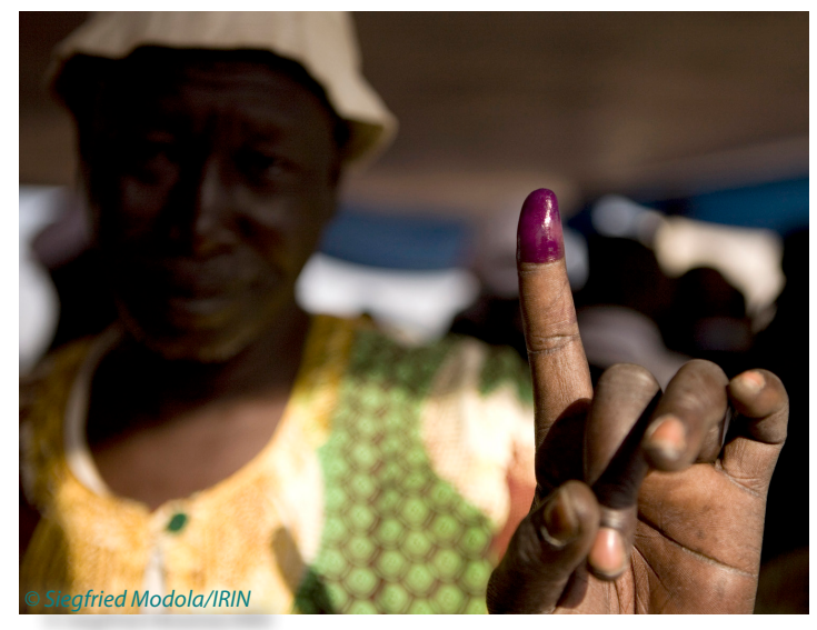
A man at a Juba polling station on voting day in the Southern Sudan referendum.

In Somalia , during 2010, UNDP supported local governments to produce for the first time annual development plans in partnership with the communities that they represent. This resulted in the rehabilitation of vital community infrastructure that improved access to services such as health centers, water boreholes, irrigation systems, roads, market places and garbage collection points for 140,000 people.