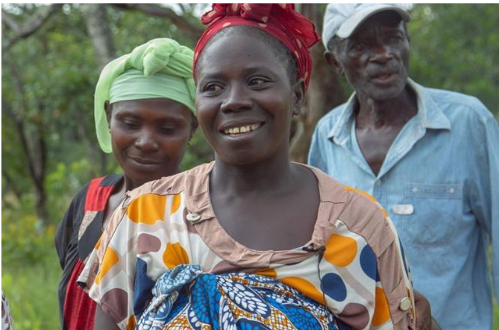
Beneficiaries of the sustainable Charcoal project, Cuanza Sul/UNDP Angola |