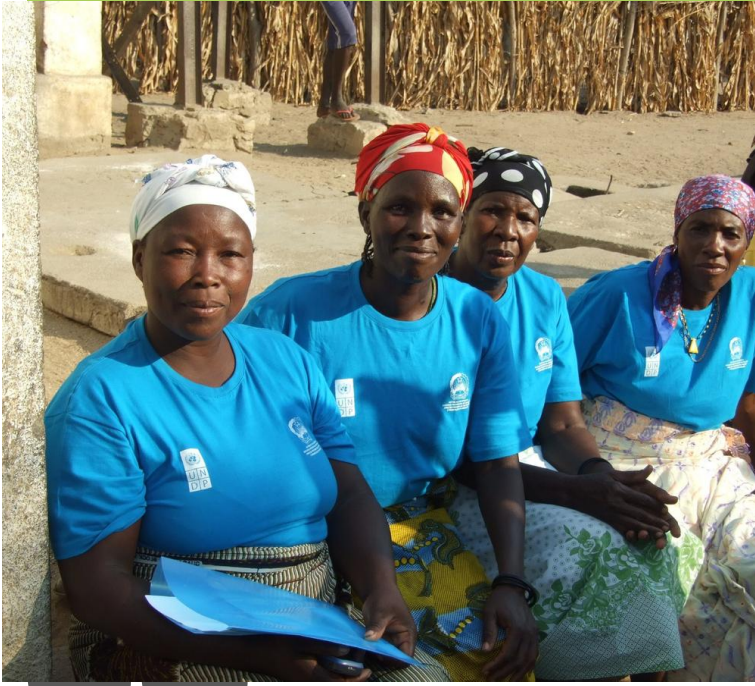
Beneficiaries of Promoting the Empowerment of Angolan Women Through CSOS Project