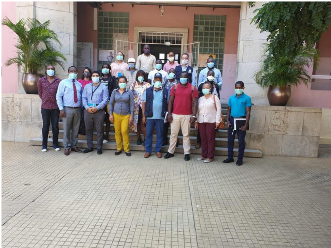
Members of UNDP, ANASO , Luanda's Provincial Governor in Community Engagement Strategy for COVID-19 meeting held on 4th May 2020.