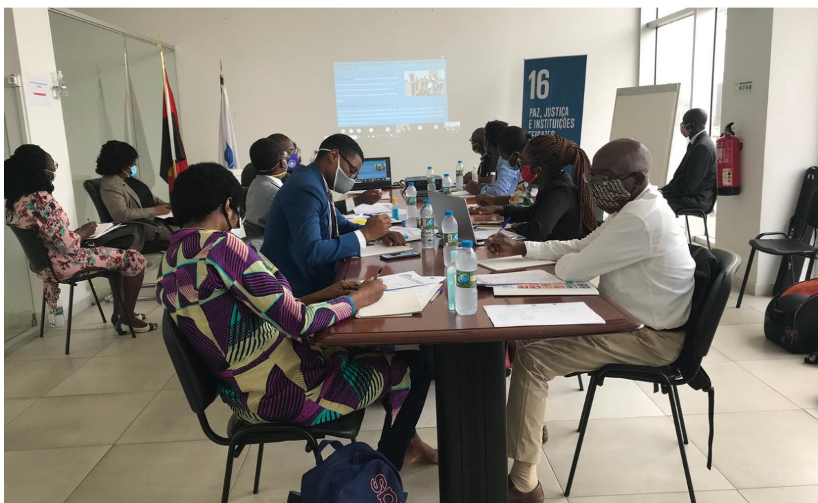
Participants of training focuses on the police daily duties on COVID-19 crisis