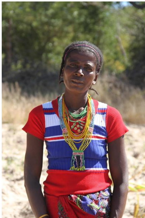
Woman trained with Resilience Building preparedness for resilient recovery in Huila Province