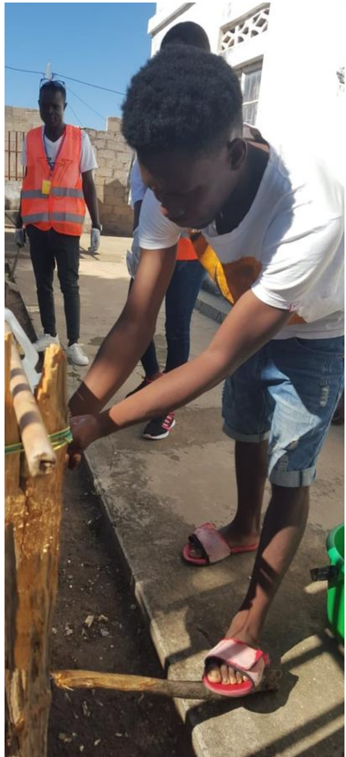
Beneficiaries of the Tip-taps/ADPP Angola