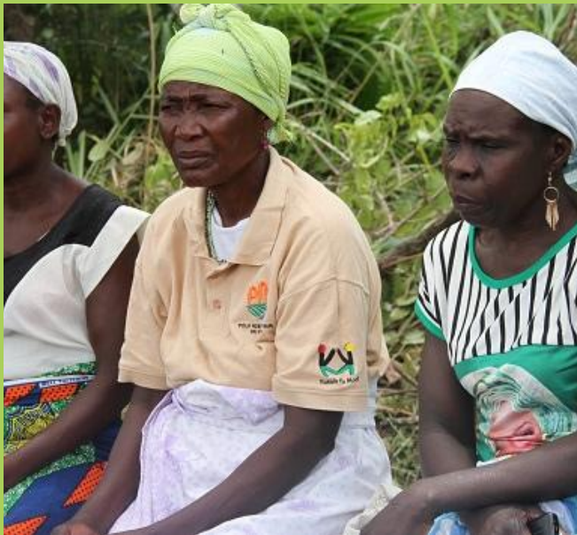
Beneficiaries of Sustainable Economic Development & Inclusive Growth Project /UNDP Angola

The public campaign products include radio spots, tailored messages, a package of radio programs and debates and literature distribution.