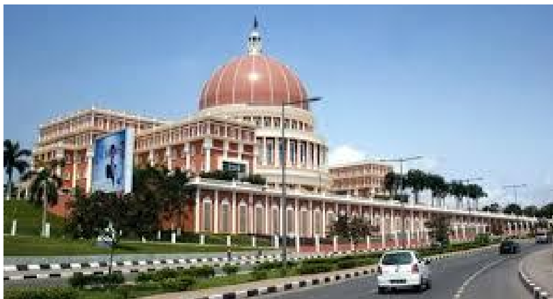
National Assembly of Angola /ANGOP Angola