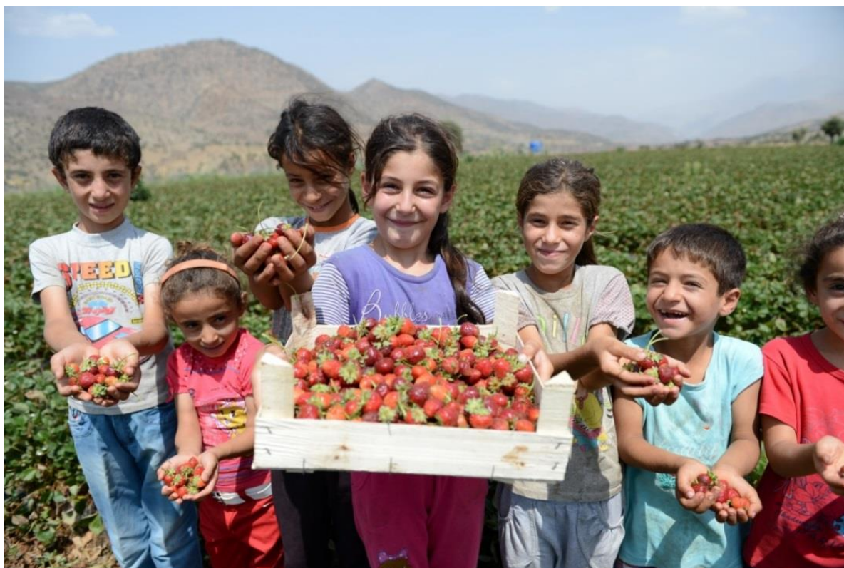
Levent Kulu Photo: Strawberry fields in Turkey.