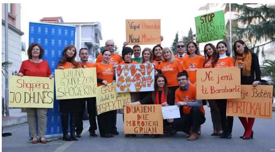
UNDP in Albania marks the International Day to End Violence against Women, November 2014.