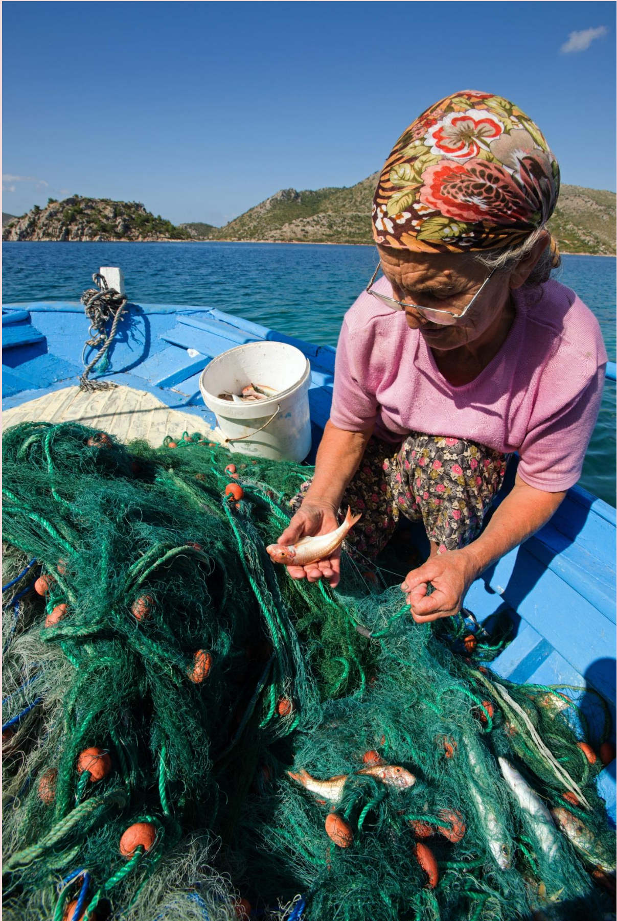
Zafer Kizilkaya Photo: A fresh catch, Turkey.