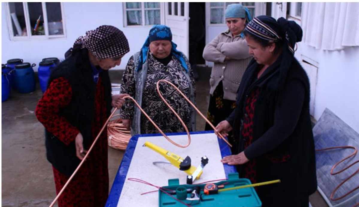
Participants of the DIY solar water heaters workshop in Jilikul practice how to bend a cuprum pipe, March 2015.