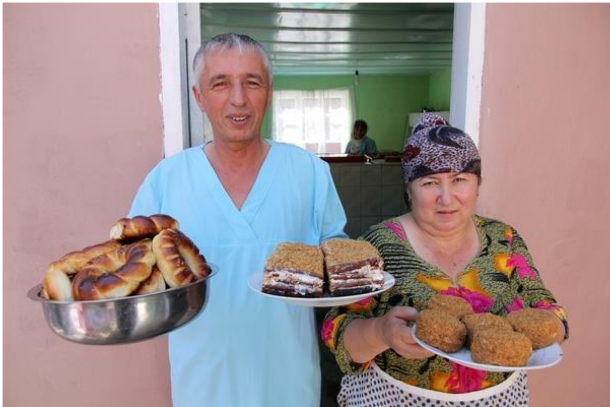
Participants in the UNDP "Aid for Trade" project. The project supports countries in the ECIS region to improve human development through trade and private sector development. The project works both regionally and individually with 11 countries: Armenia, Azerbaijan, Belarus, Georgia, Kazakhstan, Kyrgyzstan, Moldova, Tajikistan, Turkmenistan, Ukraine and Uzbekistan.

In the rural communities of Karakalpakstan, women made up 45% of the beneficiaries of UNDP initiatives who got new jobs in 24 business projects.