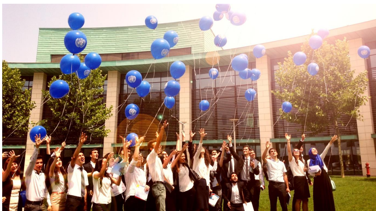
First Global Forum on Youth Policies in Baku, Azerbaijan, October 2014.