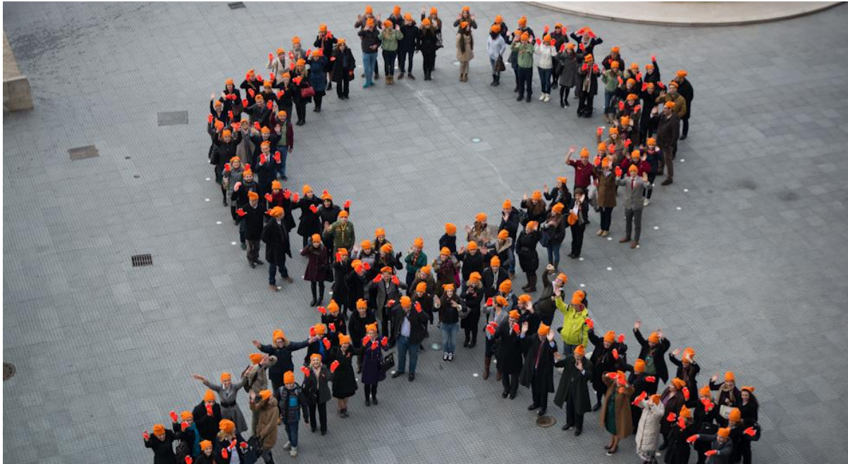
The closing of the “16 Days of Activism” campaign, a human ribbon symbolizing commitment to end gender-based violence. Filip II Square in Skopje, the former Yugoslav Republic of Macedonia, December 2014.