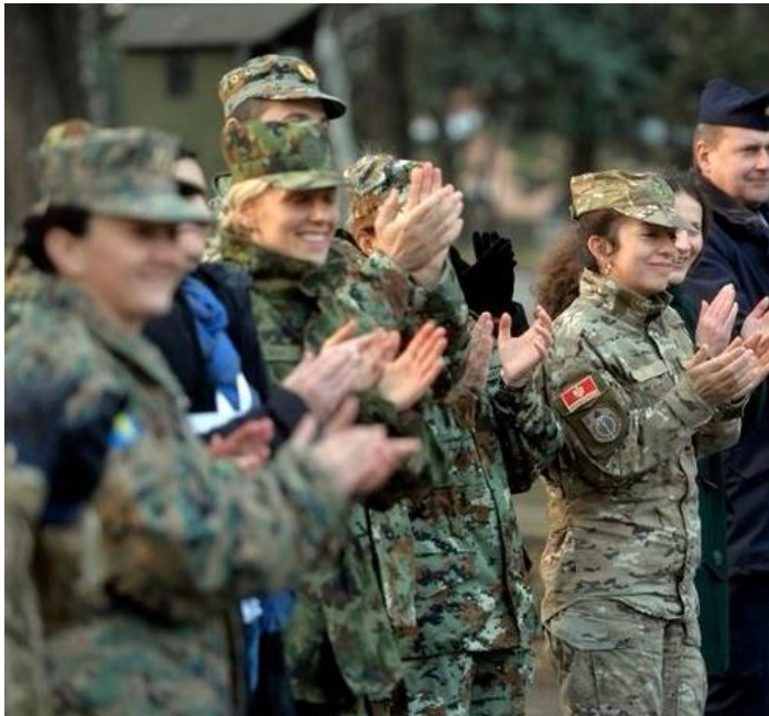
Trainers during an outdoor exercise as part of the Gender Training of Trainers Course, February 2015, Belgrade, Serbia.