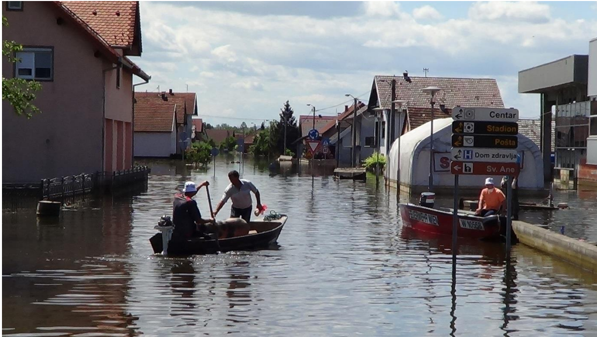
Floods hit Bosnia and Herzegovina, Domaljevac Šamac May, 2014.