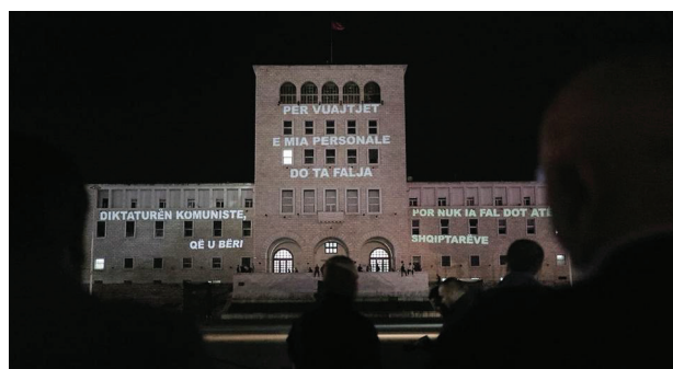
Installation in Tirana