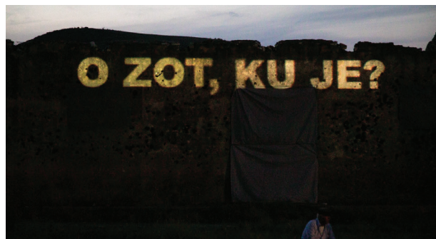
Installation in Tepelena