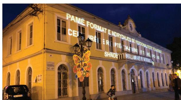
Installation in Shkodra