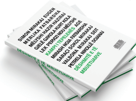
Publication “Tepelena Camp - Testimonies of Survivors”