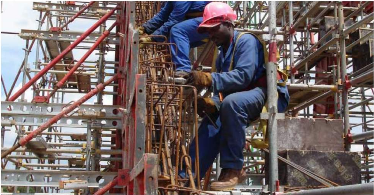
Structural economic transformation is at the heart of Africa's post-2015 development agenda.

The new Strategic Plan for 2014-2017 aims to enable UNDP to better respond to programme countries' needs and aspirations, currently and beyond 2015.