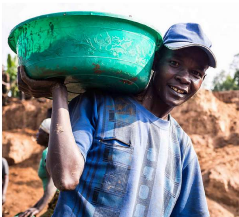
Mining in Eastern DRC. Managing extractives is seen as key to inclusive growth and development on the continent

the African Union Commission, ECA and AfDB. While an increasing number of Africans are enjoying higher living standards, countries in Sub-Saharan Africa should redouble efforts to ensure crises such as the current Ebola outbreak in West Africa do not reverse development achievements, says the report.