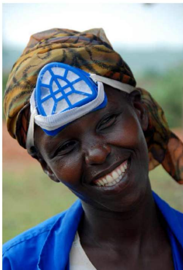
In Cibitoke, Burundi, a woman smiles as she takes part in a UNDP waste disposal programme

In addition, the HR team has continued implementing RBA's talent management programme for women. To date, 12 of the 23 women who attended the training were placed in higher positions across different parts of the organization, with the addition of three being offered detail assignments and nominated for the Deputy Country Director (DCD)/Deputy Resident Representative (DRR) candidate pool assessment.