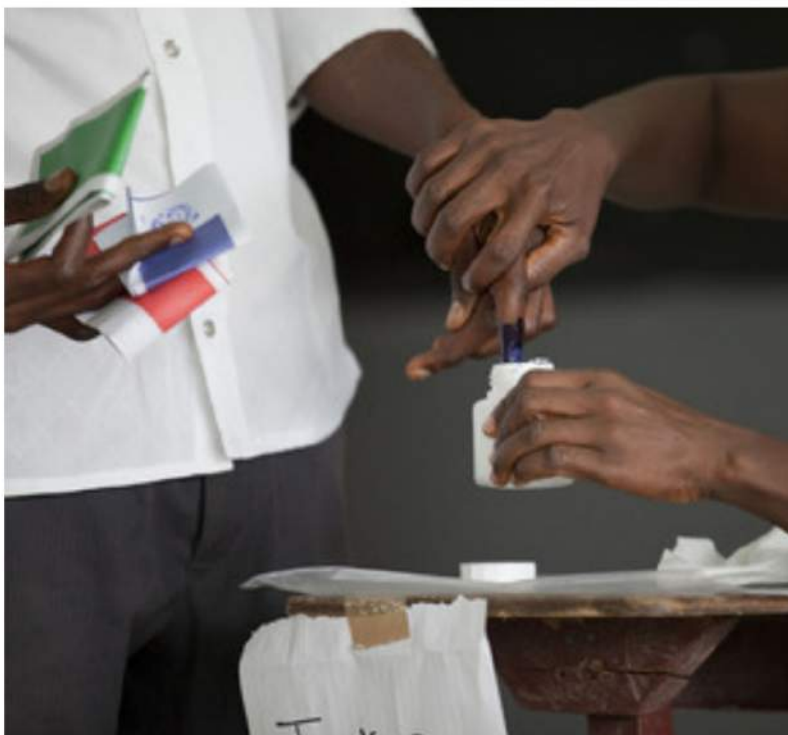
UNDP supported several elections in Africa in 2014. 2015 promises to be an election-heavy year

to mobilize tax revenues and improve budget management in Africa. The programme currently supports 17 countries in West and Central Africa and it will expand its portfolio to include a large number of civil society representatives, parliamentarians, universities and government departments involved in service delivery. Part of this effort will be conducted through online training.