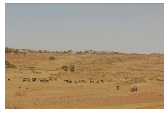
Land degradation and migration: Will restoring the land keep people at home?

With climate change, continuing urbanization trends and demographic growth – especially also in coastal areas, the impacts of floods are expected to increase dramatically in the next decades. Finding innovative and sustainable ways to work together with, rather than against, nature for effective flood risk reduction will be critical. Read full blog here.