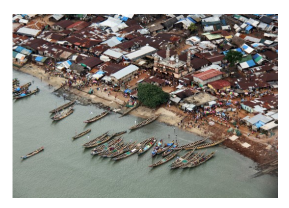
Nature to the rescue: using ecosystem services to reduce flood risks

improving governance of the fisheries sector, pollution control, and management of marine-protected areas (MPAs). Read full blog <u>here</u>.