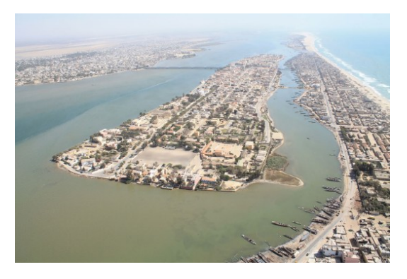
Saint-Louis, Senegal: the challenge o sustainability