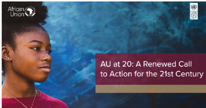
PRESS RELEASE: African Union and UNDP launch “AU at 20” Study to review progress ahead of the AU’s 20th anniversary