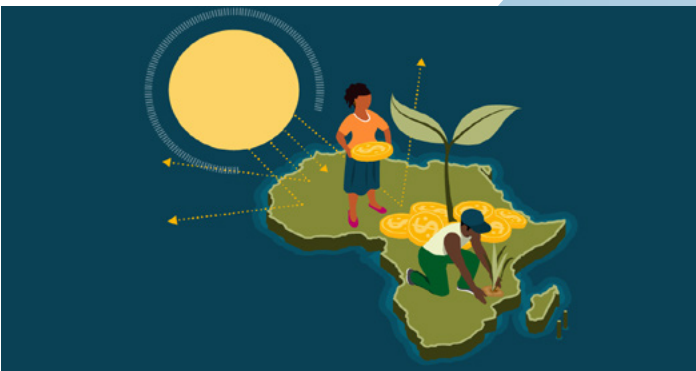
PRESS RELEASE: Launching of the Inclusive Budgeting and Financing for Climate Change in Africa (IBFCCA) Programme: A SIDA-funded initiative