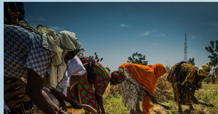
PRESS RELEASE: European Union ramps up support to Africa Adaptation Initiative with EUR 1 million grant