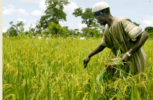
Guinea: A Guinean peasant at work. He is pulling out the weeds in his rice field, supported by NERICA in Farahan

Around 20 million rice farmers in West Africa use slash and burn practices which tend to degrade land and diminish yields over time. A cross between Asian and African varieties, the New Rice for Africa (NERICA) has been introduced to thirteen African countries, helping farmers to grow and harvest the grain in difficult environments. NERICA matures quickly, boasts higher yields in areas with low soil fertility and is 25 percent richer in protein, as well as resistant to most plant diseases found in Africa. Accompanied by participatory training, research and technical support aimed at accelerating its uptake, NERICA has been associated with increases in the incomes of women farmers, higher primary school attendance rates and reductions in child sickness. This initiative is supported by a wide variety of African and international partners, including UNDP, the Government of Japan, the Japan International Cooperation Agency (JICA), the African Development Bank (AfDB) and the International Centre for Tropical Agriculture (CIAT).