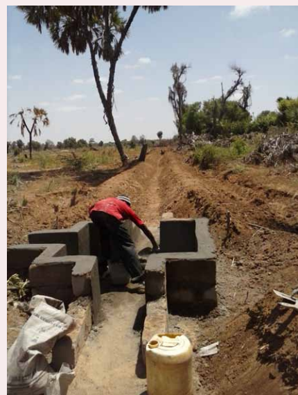
Kenya: Construction of division boxes in Galbet irrigation scheme

With support from the Government of Japan, UNDP assisted 500,000 people in the Kenyan counties of Turkana and Garissa to access food and water, generate extra sources of revenue through farming and infrastructure projects and send their children to school. Situated in areas where conflict over land has been exacerbated by drought and the influx of 650,000 refugees from neighboring countries, the project developed drought-proof irrigation over 860 hectares of land, training households, school authorities and pastoralists to grow and sell fruits and vegetables. The project also helped to build boreholes, water wells and tanks, providing access to clean drinking water for a total of 1,400 households and 4,000 children. These investments have led to better integration of refugees, considerable decreases in the number of malnutrition cases, higher school enrollment rates and the creation of new business ventures that have increased living standards for tens of thousands of people.