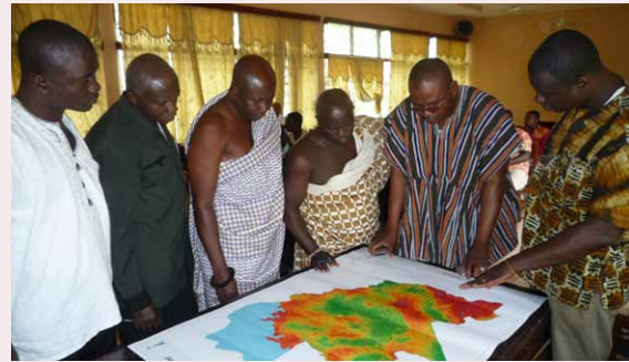
Ghana: District Chief Executives in Begoro examines and validates flood and drought hazard maps

Between 2010 and 2012 and with USD 2.7 million from the Japan-financed Africa Adaptation Programme (AAP), UNDP partnered with the Government of Ghana to bolster disaster risk reduction and climate change adaptation at the district level. The scheme supported the national disaster reduction agency, National Disaster Management Organization (NADMO), to establish hazard maps in those five districts with high flood and drought risks, as well as locations for safe havens and evacuation routes. “Improving our capacity to prepare and respond to climate induced phenomena through