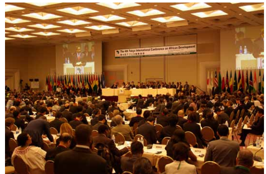
The Fourth Tokyo International Conference on African Development (TICAD IV) in 2008

TICAD was launched in 1993 and has held a summit level meeting every five years to facilitate high-level policy dialogue between African leaders and development partners. As a co-organizer of TICAD, UNDP has been helping to set its agenda and to formulate, implement and monitor programmes in support of TICAD priority areas. In this context, UNDP and the Ministry of Foreign Affairs of Japan have also been holding regular discussions on strategic policy-making, including consultations on assistance to Africa. In 2009, UNDP signed a Memorandum of Understanding (MoU) with the Japan International Cooperation Agency (JICA), leading to the organization of high-level symposiums and seminars on African development and increased country-level collaboration.