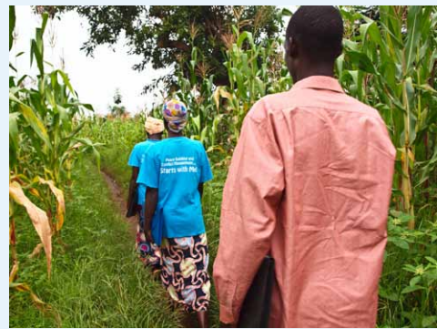
Uganda: Peace ring members move through thin and thick bushes to reach a victim

In the North of Uganda, young volunteers trained in peace-building and conflict resolution helped to settle land disputes and mitigate domestic violence under a programme aiming to facilitate recovery and resettlement of displaced populations in areas affected by the Lord's Resistance Army (LRA). Between 2009 and 2012, the programme solved 2,288 community conflicts through a 1,090-strong network of peace ring leaders. By supporting village savings associations, the effort also helped 3,335 people start small businesses, increase their farming acreage, take care of medical emergencies or pay school fees. A total of 12,578 farmers, half of them women, were trained on improved farming techniques and practices as well as given access to seeds and fertilizers. In addition, the project enabled households to increase their farm size and produce sufficient food to eat, sell, or store for replanting. UNDP, the World Health Organization (WHO) and the World Food Programme (WFP) implemented the project, with financing from the United Nations Trust Fund for Human Security.