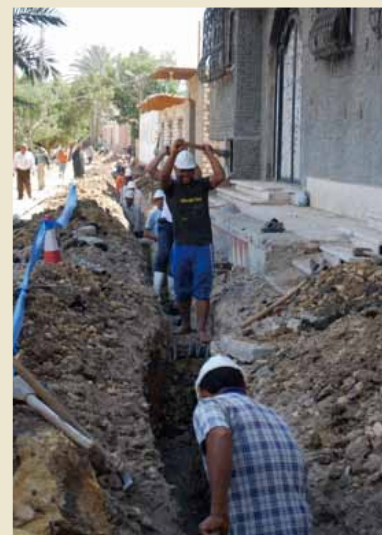
Egypt: Construction work of potable water connecting 7,000 beneficiaries to clean water in one village in Fayoum governorate