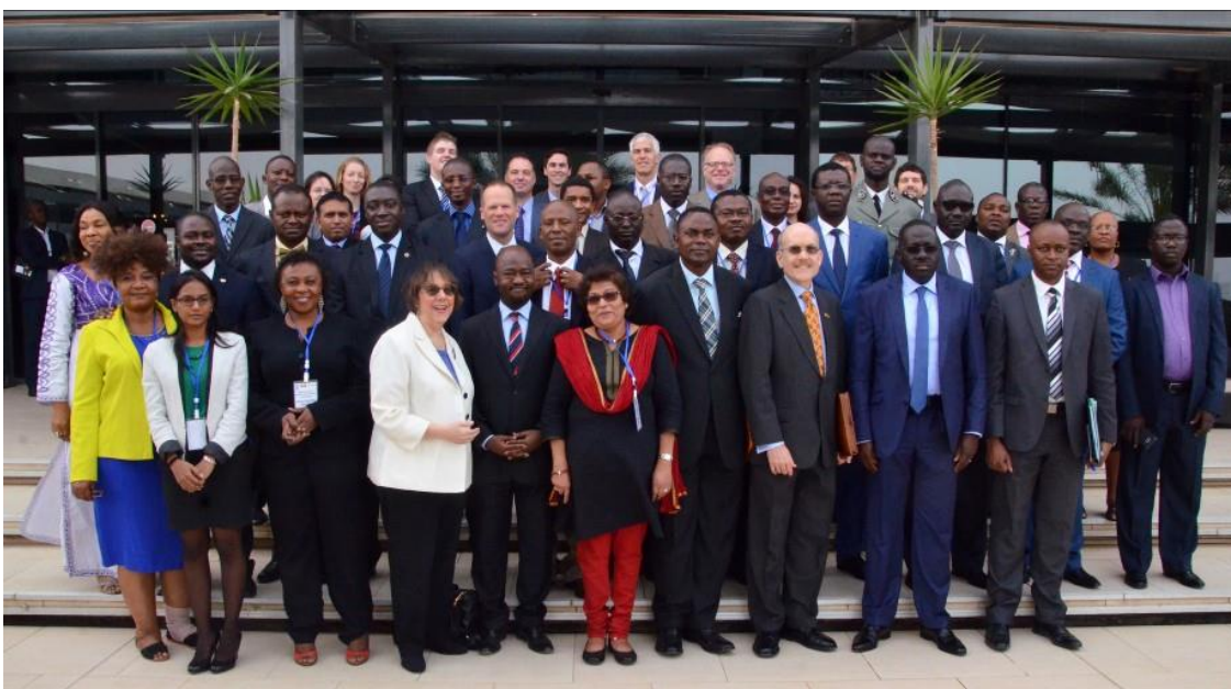
Technical experts, development partners and civil society in Dakar, Senegal for illicit financial flows consultation

Close to 50 experts from African and global revenue authorities, customs and foreign affairs departments participated in a technical consultation on the USA-Africa Partnership on Illicit Finance in Dakar, Senegal during 24-25 February, to discuss ways of strengthening national capacity to curb illicit financial flows (IFF) and promote intra-regional approaches.