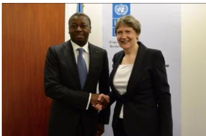
UNDP Administrator Helen Clark and President Faure Gnassingbé of Togo in New York, USA

UNDP and Togo embarked on a three-year USD 258 million programme to improve access to basic social services and involve communities in the economic and social development of their local areas.