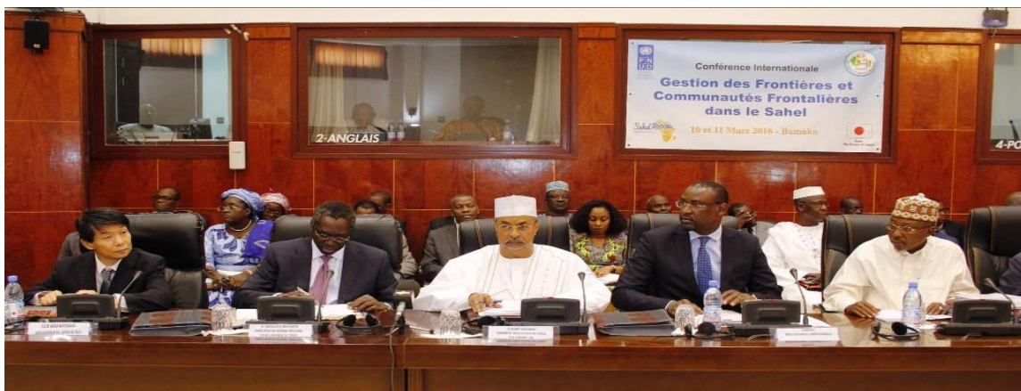
Sahel G5 countries and partners discuss border management in the Sahel in Bamako, Mali