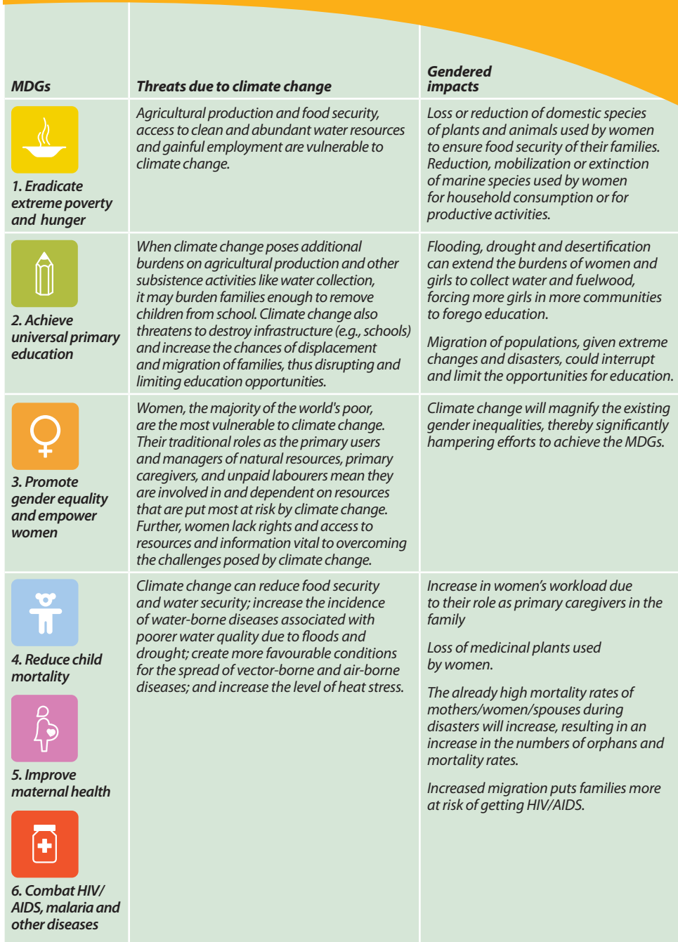
Table 1: Some ways climate change affects the MDGs and the gendered impacts