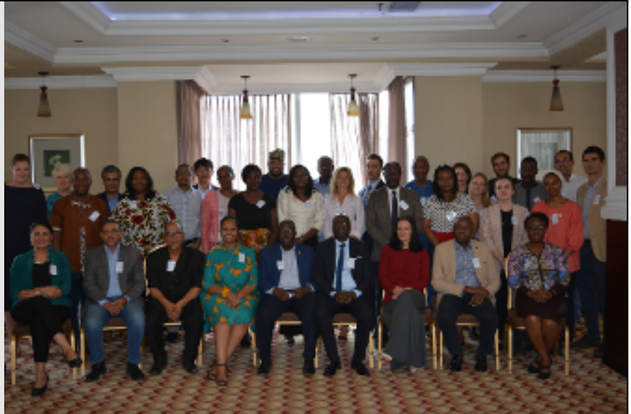
Participants of the UNDP PVE Retreat

During the retreat's concluding session, the participants agreed that the opportunity to interact with the various country office and regional office colleagues was highly beneficial, particularly as PVE is still a nascent field of practice. There was unanimous concurrence for the establishment of a Community of Practice (CoP) that would facilitate participants' continued communication, knowledge exchange and learning on PVE. The Regional PVE team has established the MS Teams 'UNDP PVE Africa' site to enable interactions between UNDP PVE professionals working in Africa. Additionally, a public Yammer Group called Preventing and Responding to Violent Extremism in Africa was created. All UNDP staff are eligible to join the Yammer group, view the content posted to this group and share files and inputs.