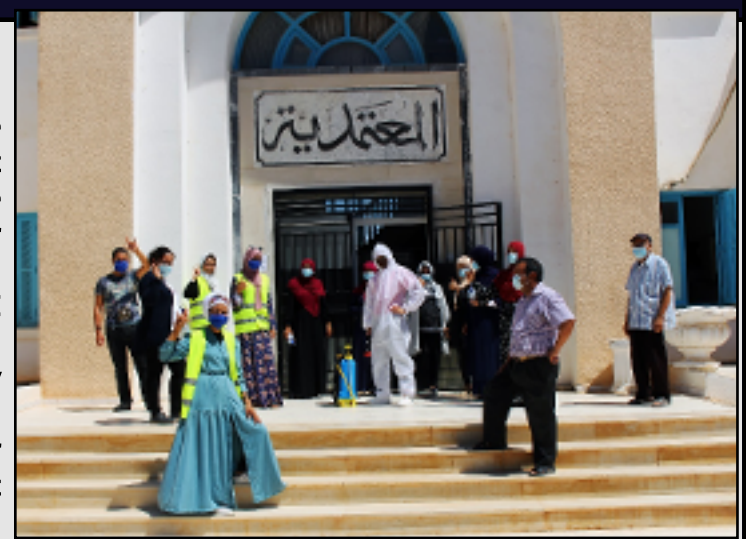
Disinfecting Local Public Institution, Association Nour Féminine, UNDP Tunisia

Due to movement of restrictions, UNDP Tunisia faced the challenge of implementing its community-level projects, with civil society organisations, during the Covid-19 crisis. The "TARABOT* – Cohesion to prevent violence" project works to strengthen the capacity of the Tunisian government, specifically the National Counter Terrorism Commission, through training, research and analysis to inform the deployment of national PVE strategy. The project focuses on creating trust in competent, effective and accountable institutions by opening channels of consultation and collaboration with Tunisian society, including academia, the private sector and civil society organisations (CSOs), in the pilot governorate of Médenine, in south eastern Tunisia.