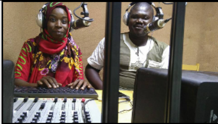
Radio Ndarasson, UNDP Nigeria

To ensure objective information about COVID-19 and its risks in those Lake Chad Basin areas that suffer from inaccessibility due to geographical and security constraints, UNDP engaged with Radio Ndarason Internationale in Ndjamena, operating from the Multinational Joint Task Force (MNJTF) base, on the short term in its news programming, attractive infotainment around COVID-19 prevention measures and talk-shows encouraging discussion between security providers and community members. Furthermore, the partnership will result in a quantitative evidence base regarding community perceptions on violent extremism, stabilization and security actors in the Lake Chad Basin, feeding into the partnership with MNJTF regarding strategic communication against violent extremism. The results of the partnership UNDP's Regional PVE Project will therefore also inform communication efforts.