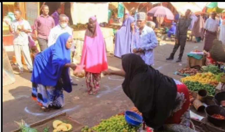
Maintaining Social Distancing in Mogadishu, UNDP Somalia

In March, Somalia recorded its first case of COVID-19. By mid-April, there were over 200 cases, mostly local transmissions. Prevention is a central public policy choice in Somalia, given the insufficient state of health capacity nationwide. Preventative measures require mobilising the right kind of collective and community action, targeted at helping the most vulnerable. UNDP Somalia launched a campaign to support Somalia's religious leaders as the trusted messengers for the Somali communities in times of need. The campaign "Clerics vs. COVID" engaged sheiks, Imams and madrassa teachers to share health-related information