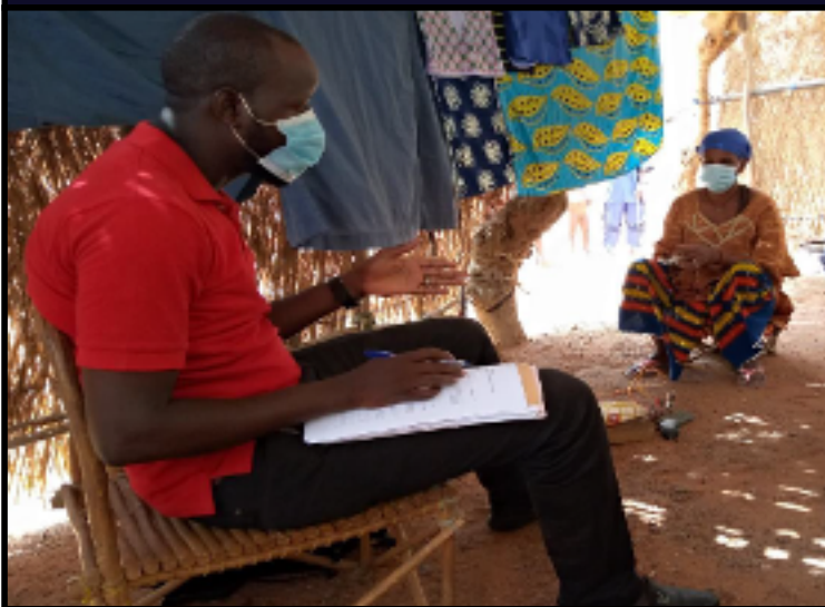
Data Collection in Mopti, UNDP Mali

One of the activities in the context of COVID-19 response, in Nigeria aims to undertake community-based bonding, trust and confidence building activities among community security providers and stakeholders to enhance community security and peaceful co-existence in three states (Kaduna, Kogi, and Adamawa). Community mapping had been carried out earlier but the workshops were postponed due to social distancing measures.