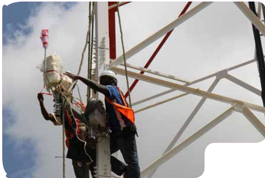
AN ALL-IN-ONE AUTOMATIC WEATHER STATION (AWS) BEING INSTALLED ON A CELL-PHONE TOWER NEAR KOTIDO, UGANDA. FIVE SUCH AWS HAVE BEEN INSTALLED ON CELL TOWERS ACROSS UGANDA THROUGH THE COUNTRY'S STRENGTHENING CLIMATE INFORMATION AND EARLY WARNING SYSTEMS PROJECT. CONNECTED DIRECTLY INTO THE TELEPHONE BACKBONE NETWORK, THE DATA ARE SENT TO UGANDA NATIONAL METEOROLOGICAL AUTHORITY (UNMA) FOR PROCESSING AND ANALYSIS. THE FIVE STATIONS, EACH OF WHICH ALSO INCLUDES A LIGHTNING LOCATING SENSOR, WILL PROVIDE DATA TO AN END-TO-END MONITORING AND FORECASTING SYSTEM, WHICH ALLOWS UNMA TO ISSUE EARLY WARNINGS FOR IMPENDING HAZARDOUS THUNDERSTORMS, CONNECT WITH REGIONAL MONITORING SYSTEMS AND IMPROVE THE COUNTRY'S OVERALL SUSTAINABILITY OF INVESTMENTS IN CLIMATE INFORMATION SERVICES.

Sub-Saharan Africa is already facing a combination of challenges perhaps greater than any other region—rapid population growth, urbanization leading to megacities, challenges in providing basic services, the lowest rates of electricity and energy access in the world, low rates of agricultural productivity, and outbreaks of disease. Despite continued economic growth and advances in food security, constraints in regional cooperation, capacity limitations in NHMSs and related government agencies, and challenges in access to new technologies, information and training remains persistent and creates tough-to-break poverty traps that hinder progress in resilient development and poverty reduction. Today in Africa, an estimated 330 million people live in extreme poverty, with projections from the World Bank's Global Monitoring Report indicating only small gains in poverty reduction in sub-Saharan Africa over the next 15 years. 3