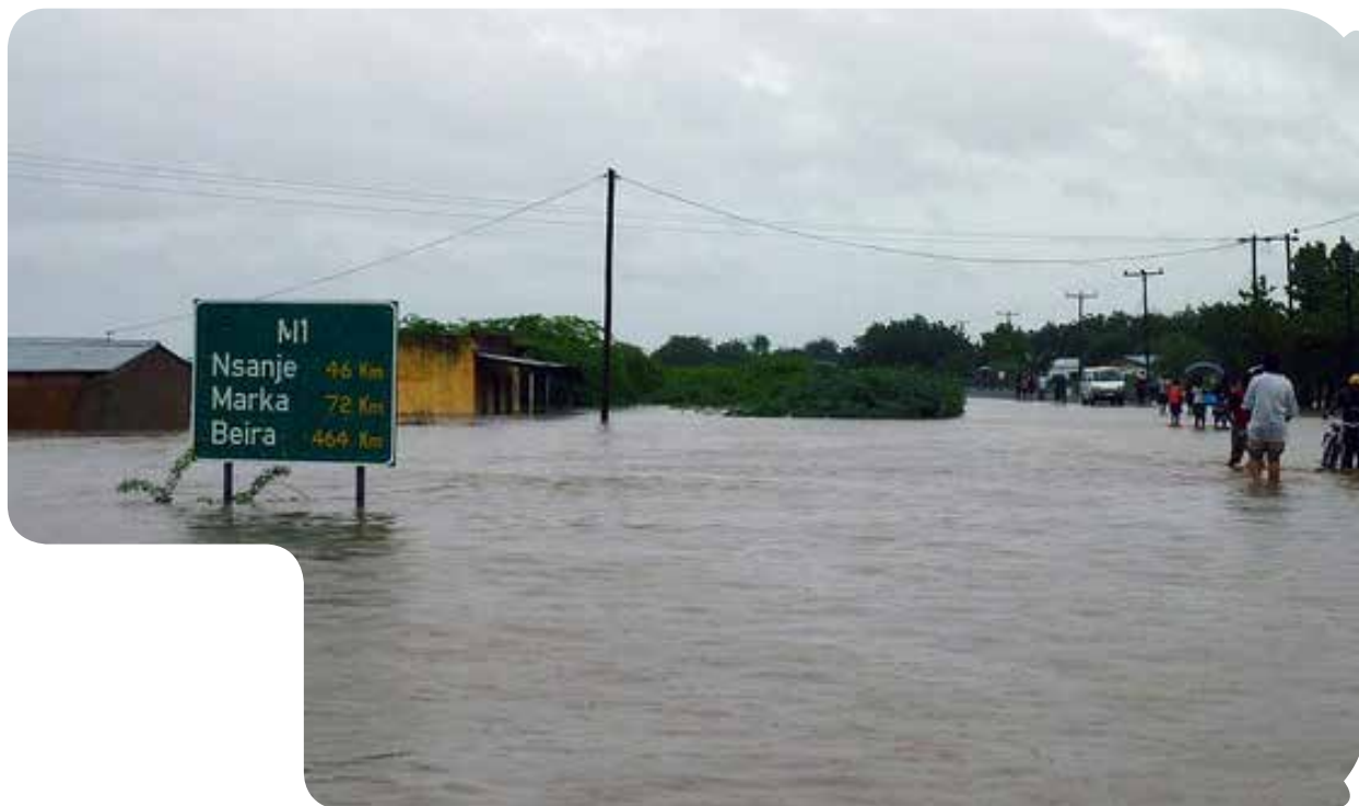
FLOODS NOT ONLY PUT LIVES AT RISK, THEY ALSO DESTROY PRODUCTIVE INFRASTRUCTURE LIKE ROADS.

The approach described in this report emerged from UNDP’s response to requests from 11 African nations to help them address this situation.