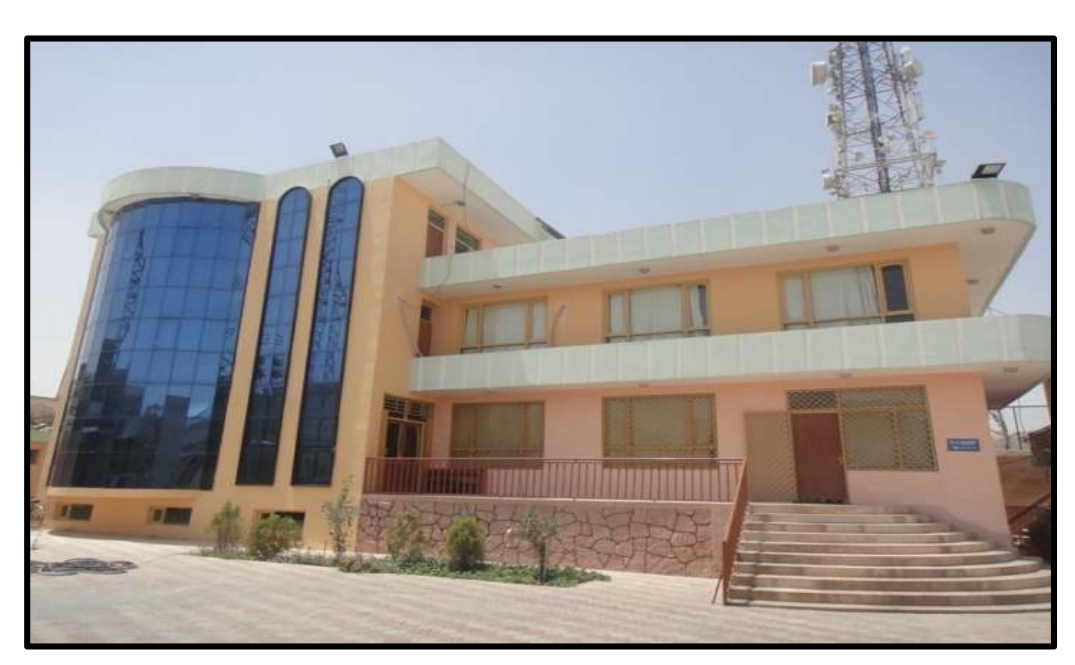
Photo Two: Mazar-e-Sharif center, Balkh province NABDP-Constructed Regional Office

The construction of the administrative building is the Regional Office NABDP for located in the Provincial Rural Rehabilitation Development (PRRD) compound. This will be a longterm asset to MRRD and will assist the staff to conduct