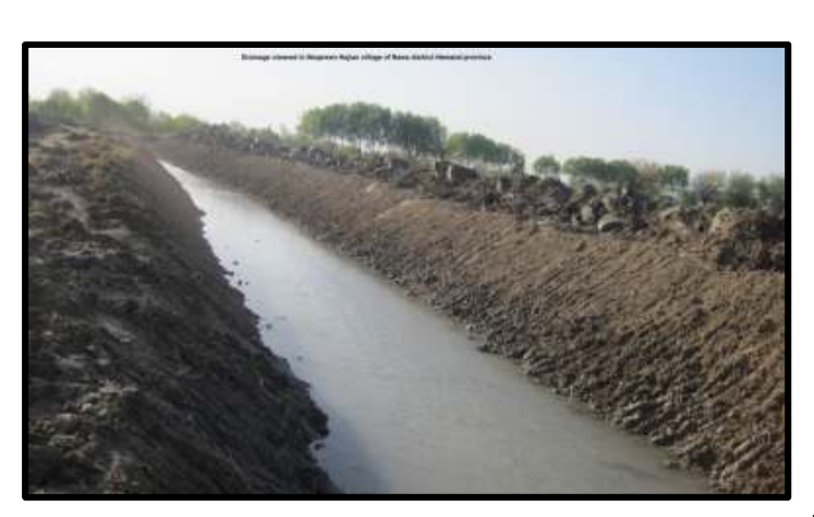
Photo Three: Hijayan village, Nawa district, Balkh province Drainage project

In the Second Quarter of 2013, NABDP completed 15 disaster management projects including 14 protection walls and one gabion wall. The completion of these projects resulted in the protection of 2,809 jeribs (562 hectares / 1388 acres) of land