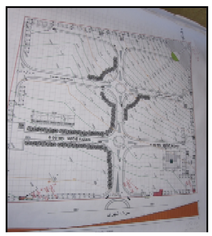
Rural Technology Park Blue Prints

AIRD has elaborated the first draft of first volume of the Rural Technology Directory (RTD) with more than 95 rural technologies. AIRD expects to publish the first volume of the RTD in 2013.