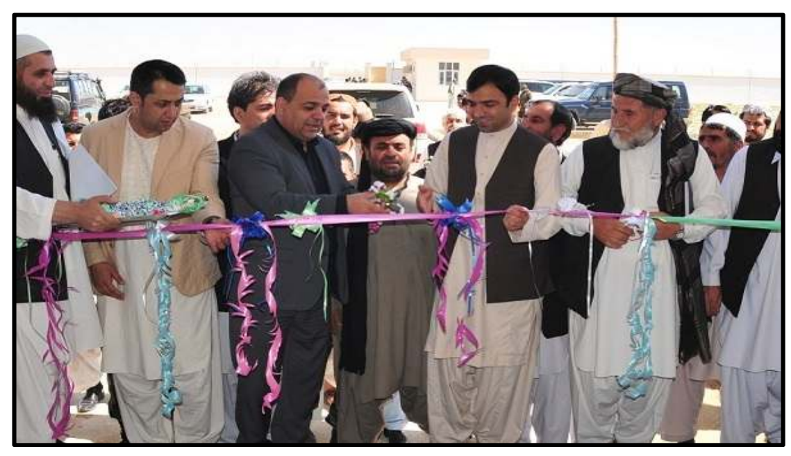
Photo Four: Kandahar province Inauguration of KRARDI by H.E Minister Wais Barmak

KRARDI is a key element of the Integrated Alternative Livelihood Programme (IALP-K2). It is funded by the Canadian International Development Agency (CIDA) and implemented by NABDP. The project is intended to facilitate the creation of new and permissible livelihoods for Afghan farmers in Kandahar and the region. As Kandahar is a heavily agricultural-based province, KRARDI will assist them with modern methods and technologies in both agricultural and livestock products; ultimately assisting the villager's economic stability and livelihood.