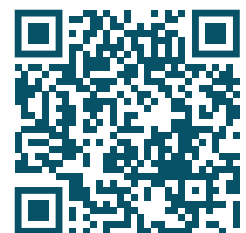
National Greenhouse Gas Inventory 2020-2022