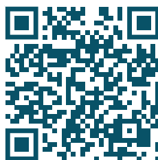
International Day of Rural Women