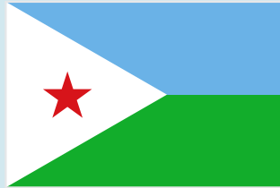
Government of the Republic of Djibouti

We express our gratitude to the Government of the Republic of Djibouti: