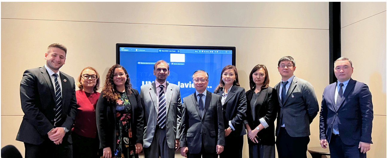
At the Steering Committee's Meeting

With support from the Joint SDG Fund, UNDP assisted the Bishkek Mayor's Office in moving beyond reporting toward practical implementation of the VLR, positioning it as a living policy tool to guide urban planning, regulatory reforms, and service delivery improvements. This work also supported Kyrgyzstan's broader decentralization and territorial development agenda, ensuring stronger vertical alignment between national strategies and municipal action.