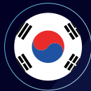
Republic of Korea