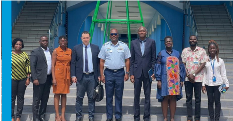
SALIENT scoping mission team at Kofi Annan International Peacekeeping Training Centre in Accra, Ghana