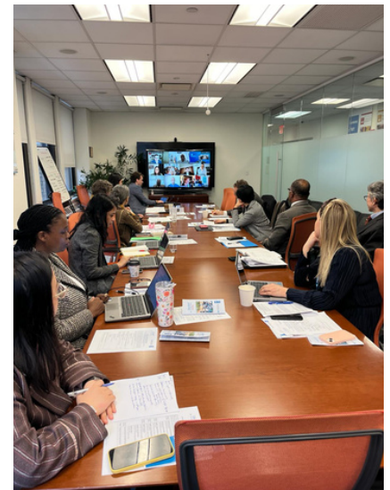
Hybrid programme board convened online and in New York

SALIENT event on sidelines of RevCon4 : 18 June 2024.