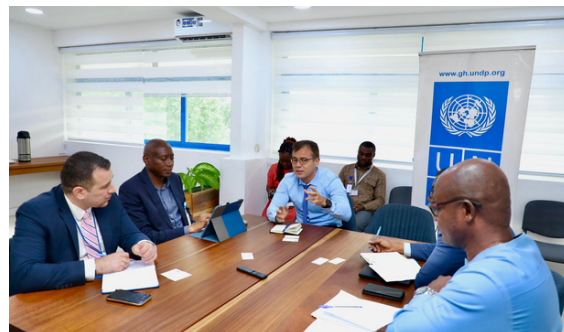
SALIENT mission team in discussion with UNDP Deputy Resident Representative Khoshmukhamedov

The project proposal for Panama is being finalized by UN implementing agencies, under the coordination of the RC, based on the results of the scoping mission.