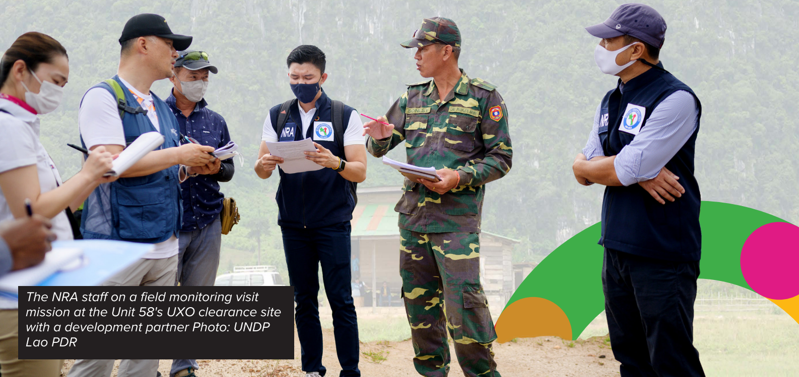
The NRA staff on a field monitoring visit mission at the Unit 58's UXO clearance site with a development partner

per capita, the most heavily bombed country in the world. Today, much of the country is still contaminated with cluster sub-munitions and other Unexploded Ordnance (UXO). These kill and injure dozens of people yearly, with 20 casualties in 2022 and 47 in 2023. Their presence also negatively affects socio-economic development, by preventing safe access to agricultural land and increasing the costs, of all development projects due to the necessity of expensive and time-consuming clearance of UXO from the land. In September 2016, Lao PDR launched its own national Sustainable Development Goal, SDG 18: Lives Safe from UXO, in the presence of the Prime Minister of Lao PDR and the UN Secretary General during the ASEAN Summit held in Vientiane.