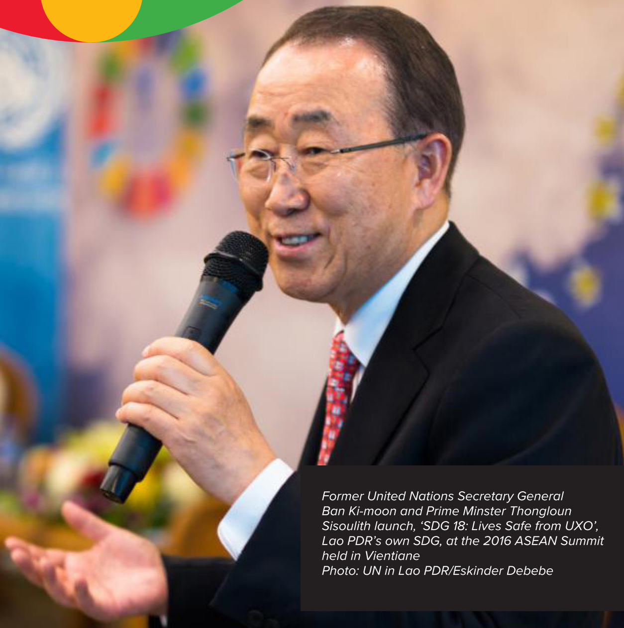
Former United Nations Secretary General Ban Ki-moon and Prime Minister Thongloun Sisoulith launch, 'SDG 18: Lives Safe from UXO', Lao PDR's own SDG, at the 2016 ASEAN Summit held in Vientiane