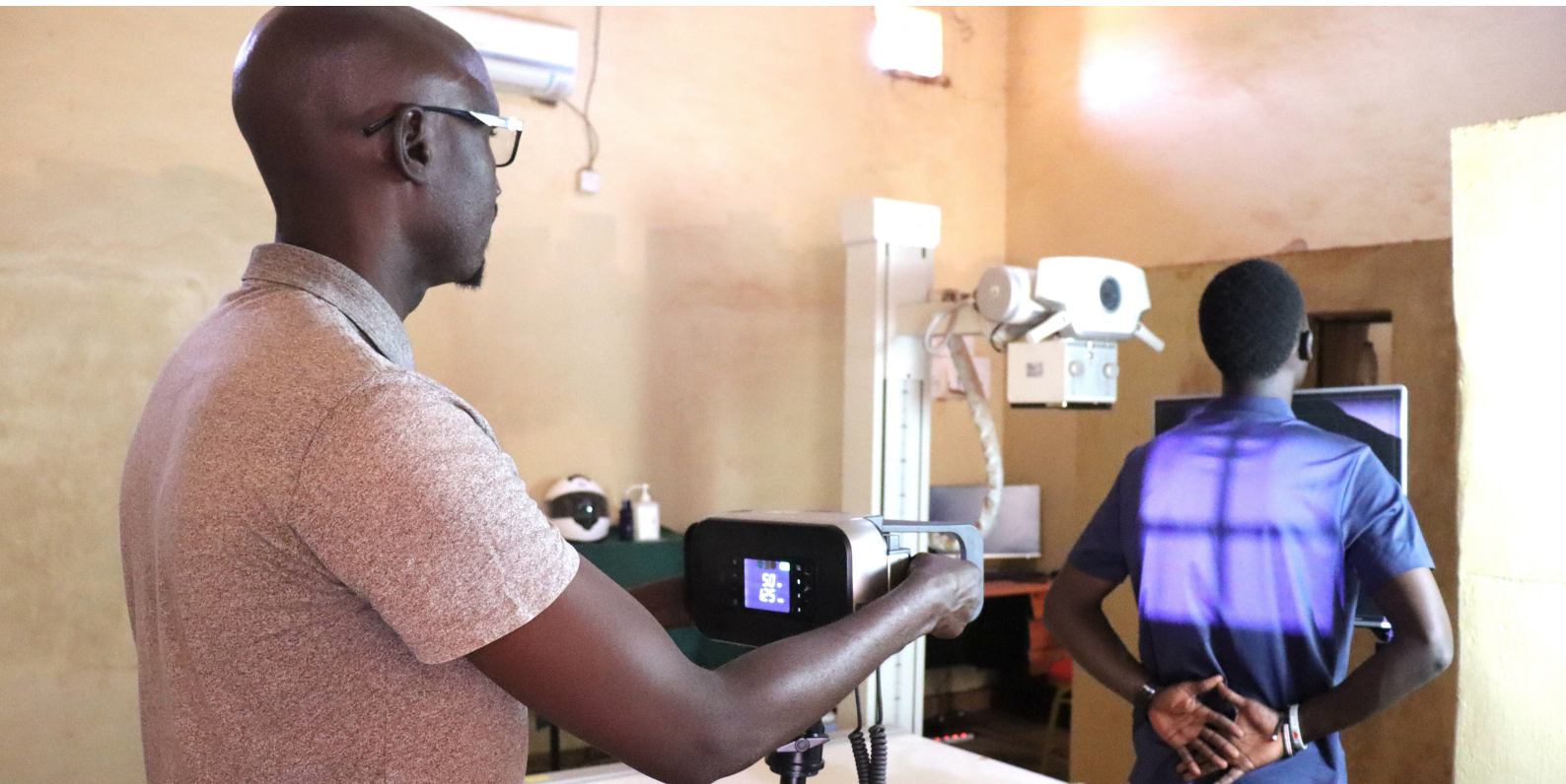
The digital X-ray machines are enabling health care at Torit State Hospital

Innovation is helping to accelerate progress in the fight against diseases while preparing the world for future pandemics. In South Sudan, we are beginning to use artificial intelligence-aided digital X-ray machines to scale up TB screening and treatment.