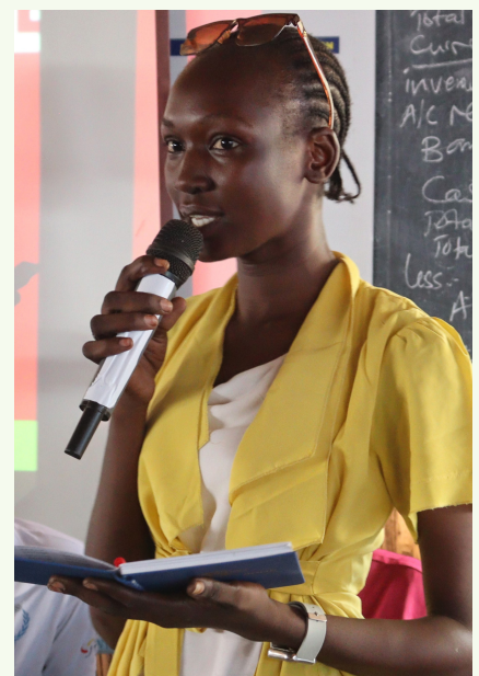
There were animated discussions about TB during the annual event

He disclosed that the Ministry of Health is committed to observing all the health-related commemorations to raise awareness and renew action to end health threats and achieve good health and wellbeing for all. "Lets us come together, fight all the diseases that we are encountering in our country with concerted effort and one voice. So, let us all commit and say: 'Yes! We can end TB in South Sudan!'"