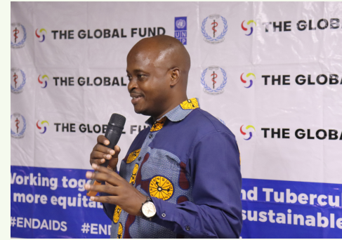
The happy hour sessions have fostered discourse and increased awareness about HIV/AIDS and TB among staff.