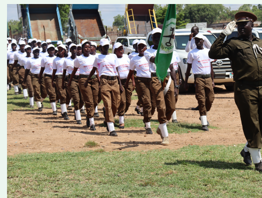
We all have a role to play to combat HIV/AIDS. Security personnel actively participated in the World AIDS Day ceremonies.