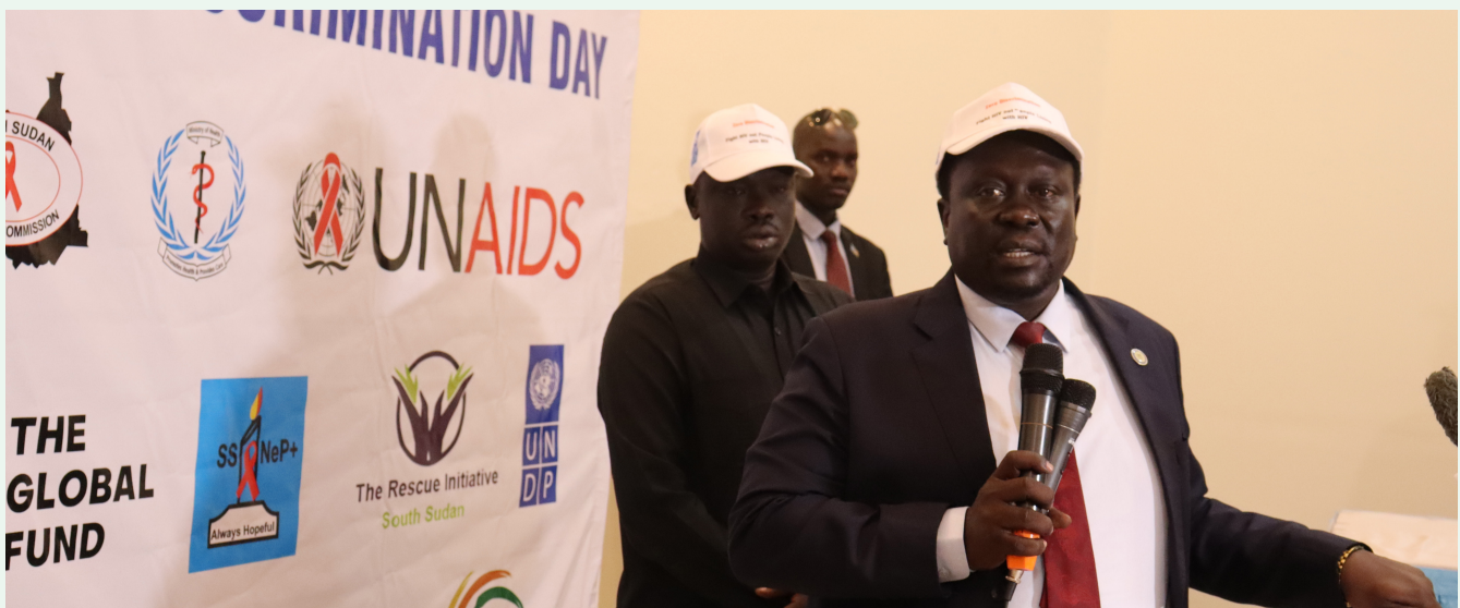
The Vice President and Chair of the Services Cluster H.E Hussein Abdelbagi Akol

Government and partners in the health services implementation in South Sudan have called for an end to stigma and discrimination against persons living with HIV and tuberculosis so as to ensure good health and wellbeing for all. This was the highlight of the Zero Discrimination Day observed on 1 March 2024, to renew calls for every individual to live a life free from discrimination, with dignity and respect. In line with the day's theme, participants were reminded that by protecting everyone's rights, we can protect everyone's health.