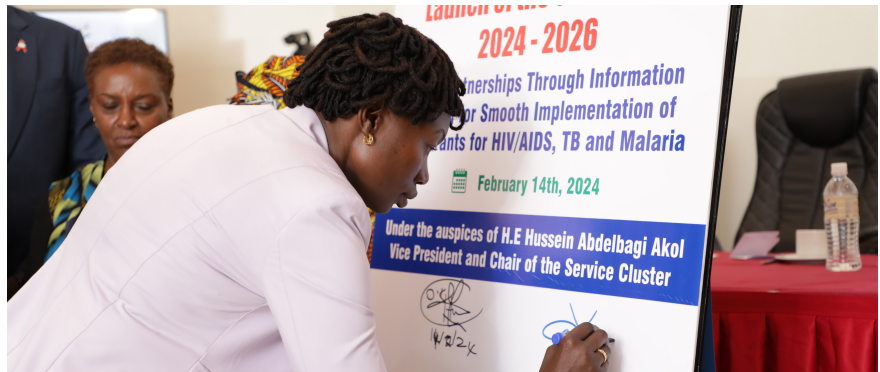
The Minister of Health Hon. Yolanda Awel Deng

The oversight of the grant will be undertaken by the Country Coordinating Mechanism (CCM), a multisectoral body that coordinated the development of the funding request that was submitted to the Global Fund expressing the country's priorities.