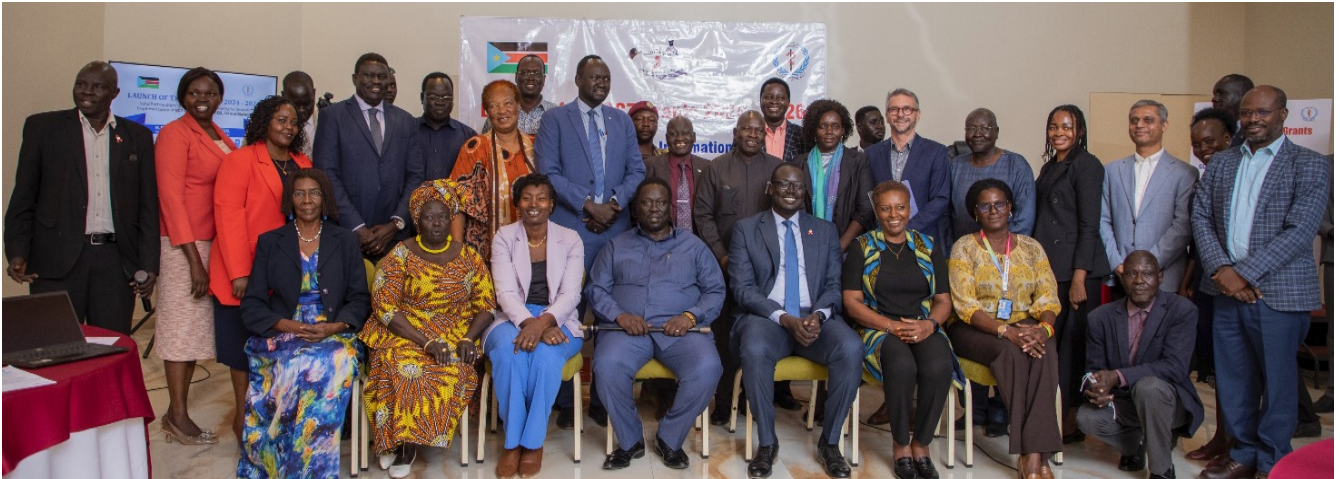
The Vice President and Chair of the Services Cluster H.E Hussein Abdelbagi Akol, the Minister of Health Hon. Yolanda Awel Deng, other Government dignitaries and partners during the launch of the GC7 grant.

Valued at US$167 million, the Grant Cycle 7 will be implemented over the period 2024–2026.