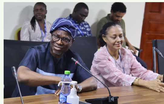
The happy hour sessions have been attended by the senior management team led by the Resident Representative and the two Deputy Resident Representatives