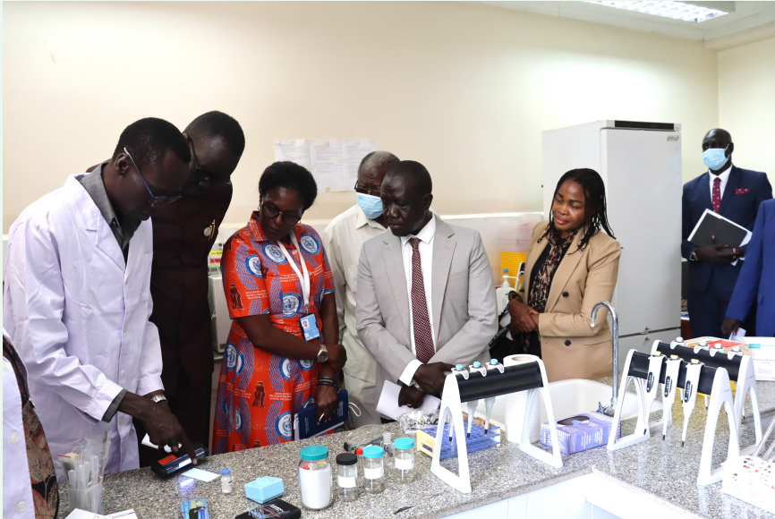
The quality-control minilab will also boost confidence in the country's health sector

A quality-control minilab has been launched to regulate food and medicinal standards through rapid drug quality verification and falsified medicines detection to ensure access to safe, effective, quality-assured foods and medicines in the country.