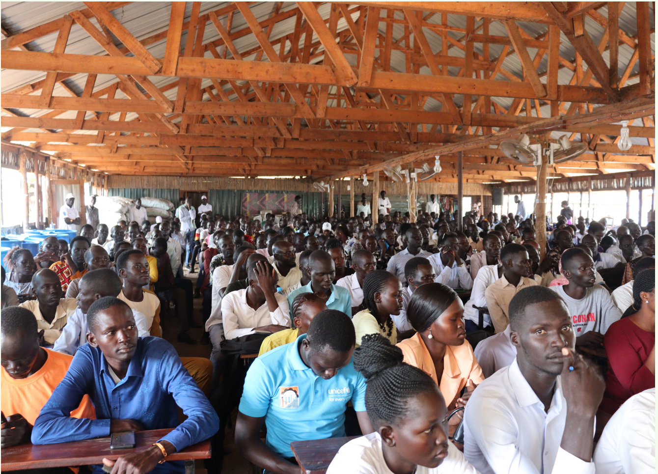
World TB Day commemoration at Upper Nile University

During the commemoration, key resource persons including TB physicians and lecturers made presentations about TB and had animated and engaging discussions with students about TB, its causes, signs and symptoms and treatment options. There was also infotainment and playing of advocacy songs on ending TB.