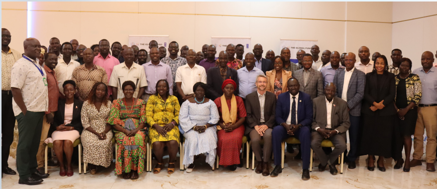
Partners in the implementation of the GC7 grant during the orientation workshop.

The United Nations Development Programme (UNDP) has oriented partners on the implementation modalities of the Grant Cycle 7 (GC7) which runs across the period 2024 – 2026.