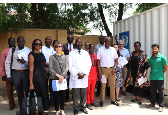
Officials from the Global Fund Country Team, Ministry of Health, UNDP and partners during the recent Global Fund mission to South Sudan