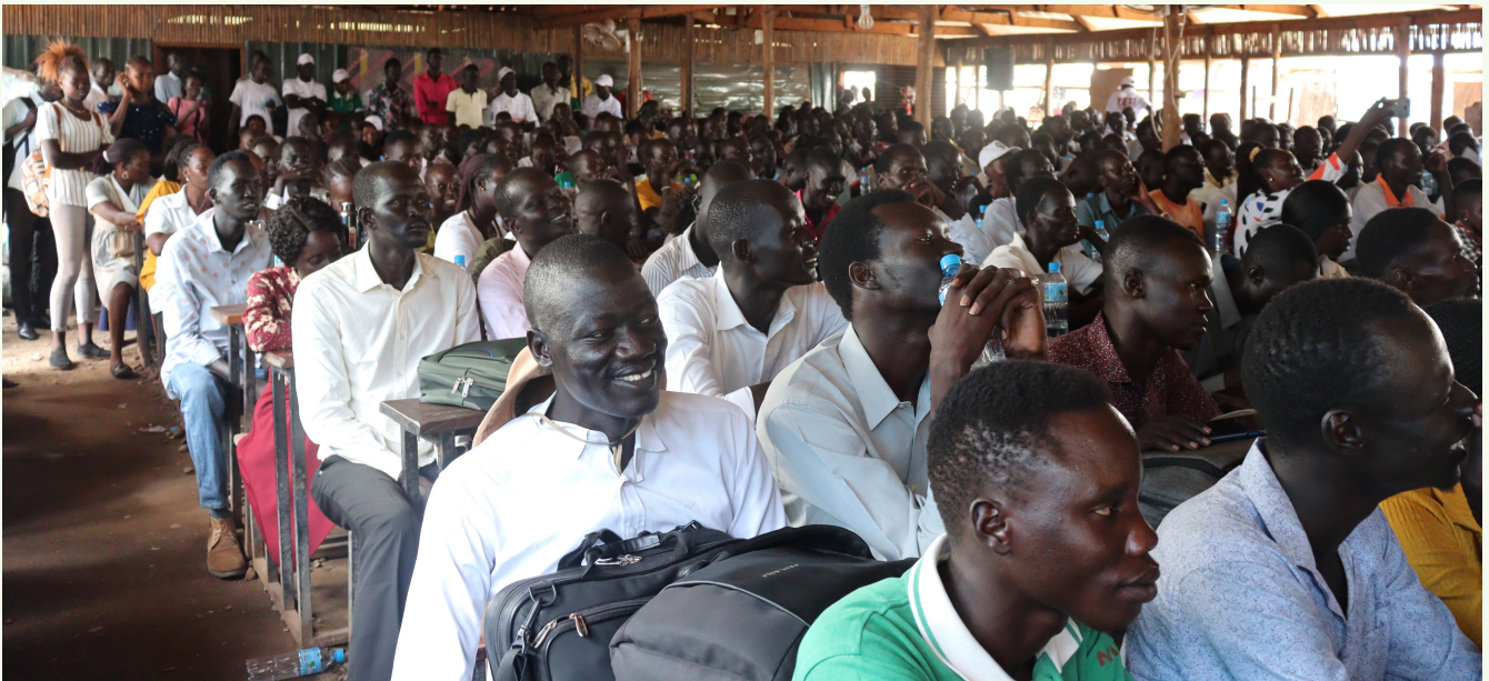
Students were enthusiastic to learn about TB and its devastating impact.