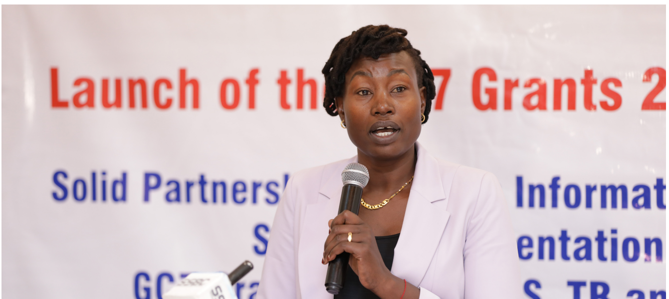
The Minister of Health Minister Hon. Yolanda Awel Deng

The Global Fund assesses grant performance based on Principal Recipient reporting in the Progress Update every six months, using indicator results to confirm the programmatic rating and budget utilization, and in-country absorption to confirm the financial rating. The programmatic and financial ratings are combined to establish the overall grant performance.