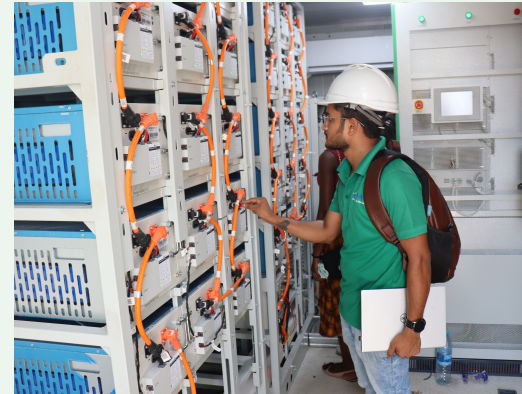
Solar power installation in 28 hospitals and health facilities is transforming health delivery, saving lives and enabling critical hospital operations, given the power shortages.